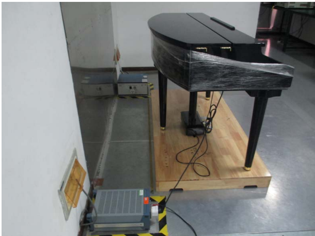
Conducted Emissions Setup Side View