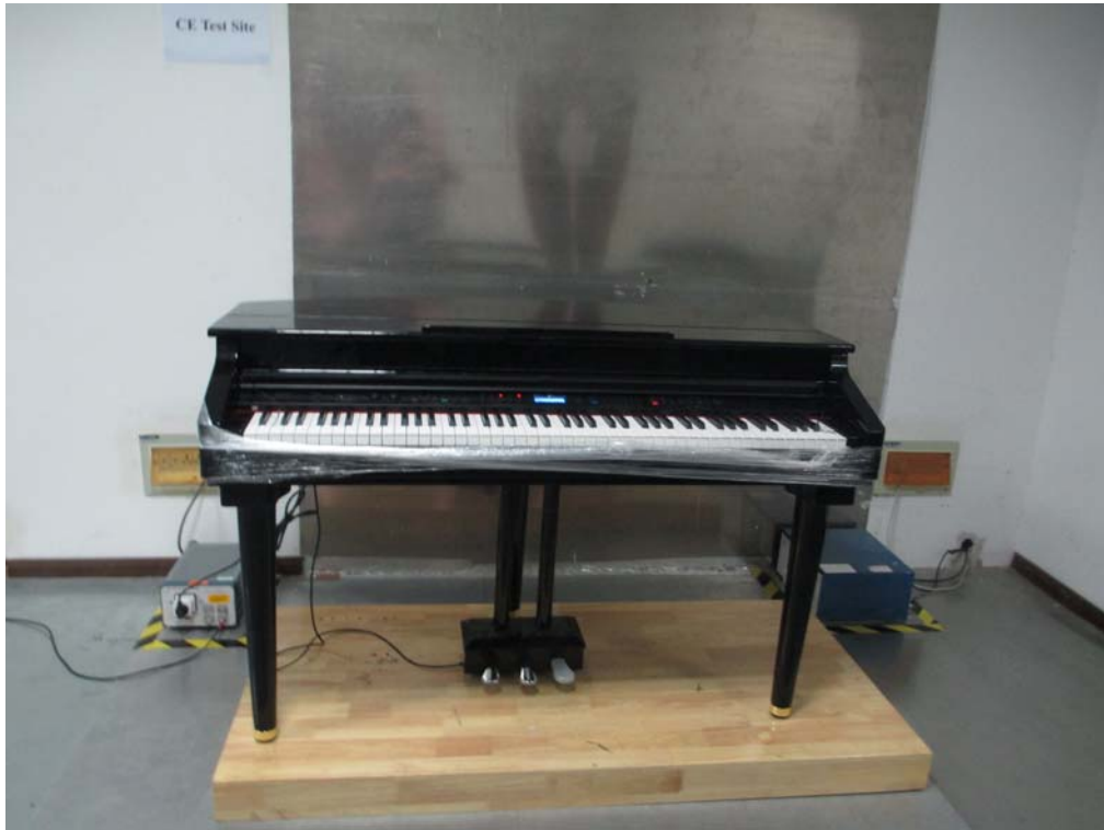
Conducted Emissions Setup Front View