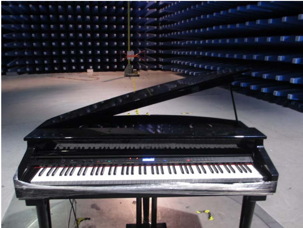
Radiated Emissions Setup Front View

Report No.: 13020567-FCC-E Issue Date : July 23, 2013 Page: 28 of 34 www.siemic.com.cn