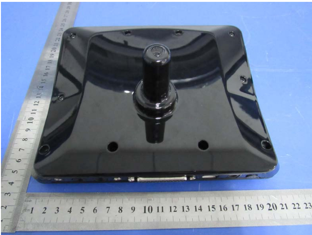
EUT Cover Off - Rear View