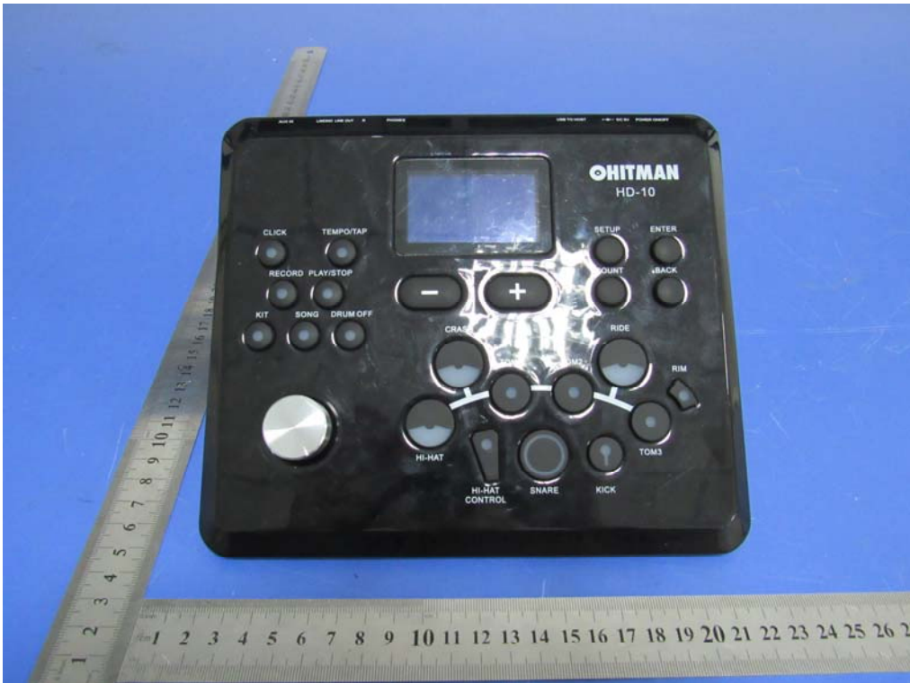
EUT Cover Off - Front View