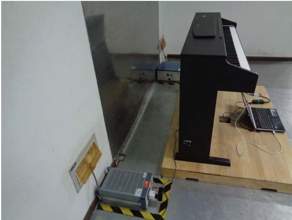
Conducted Emissions Setup Side View