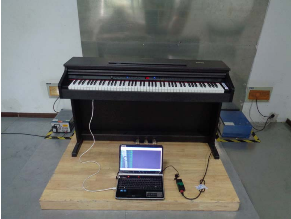
Conducted Emissions Setup Front View