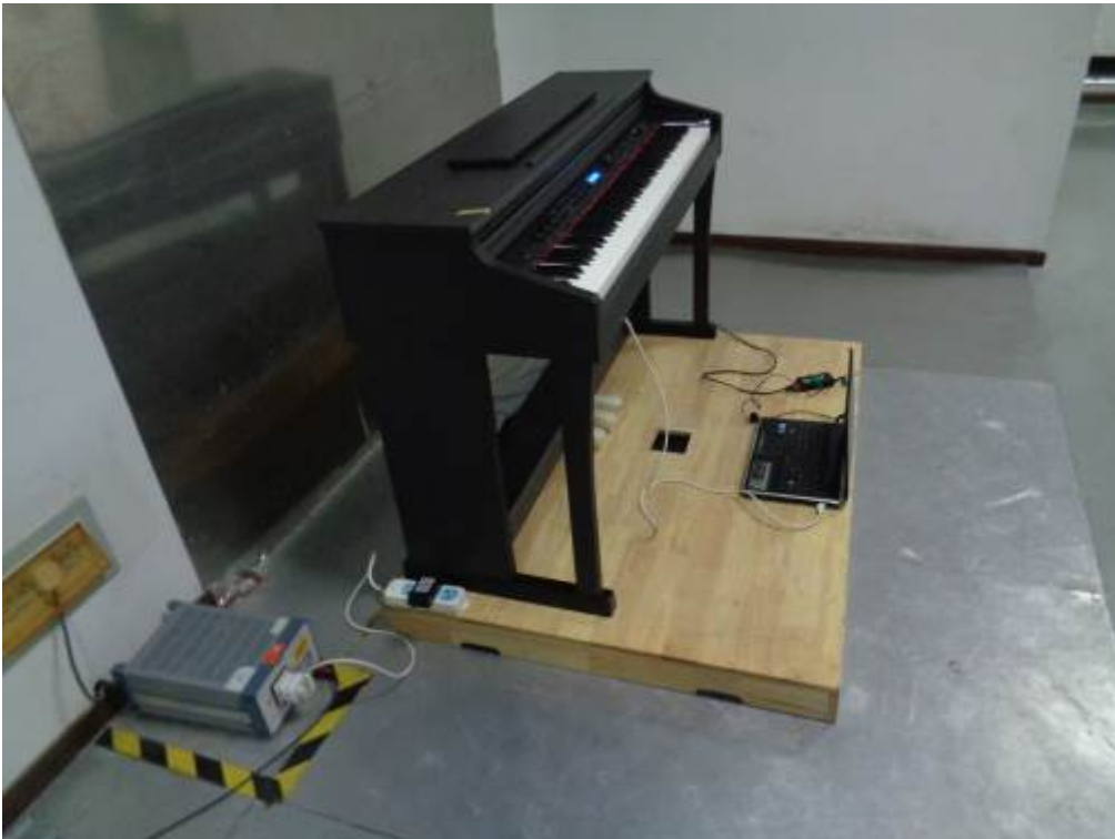
Conducted Emissions Setup Side View