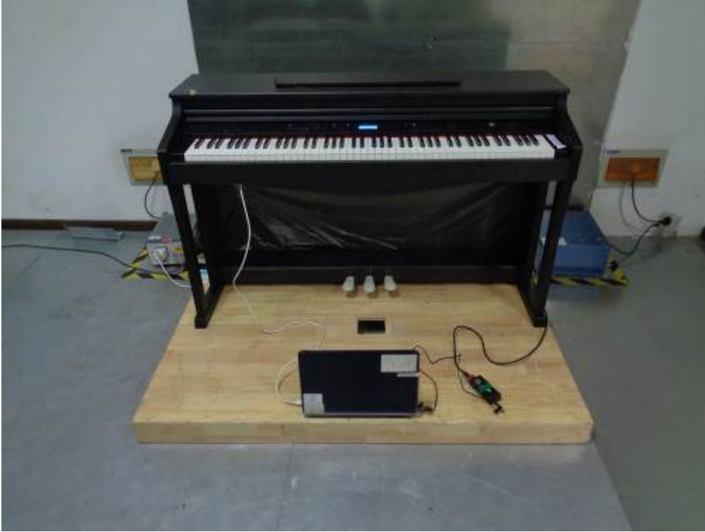
Conducted Emissions Setup Front View