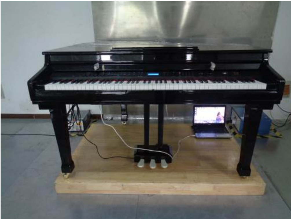
Conducted Emissions Setup Front View