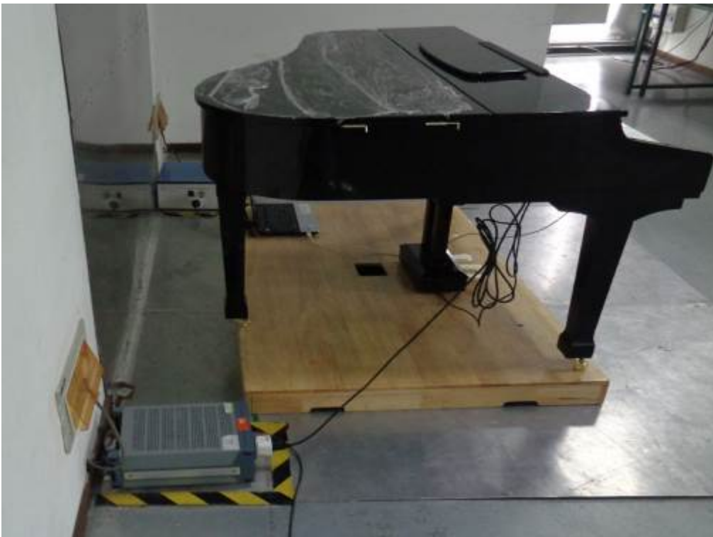
Conducted Emissions Setup Side View