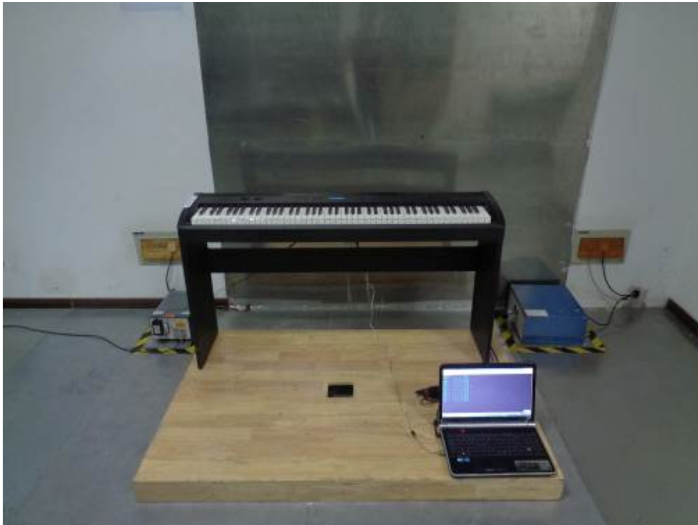
Conducted Emissions Setup Front View