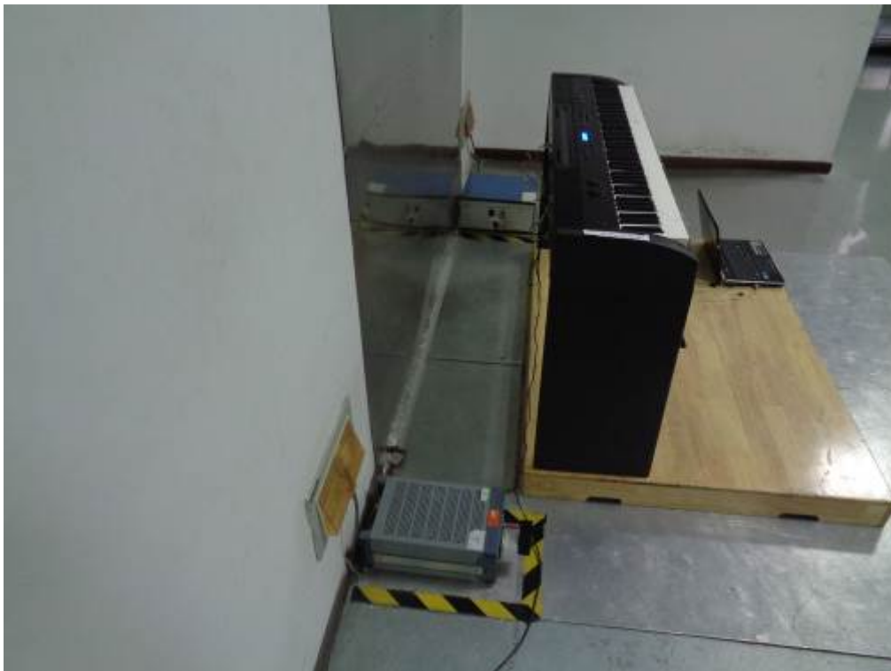
Conducted Emissions Setup Side View