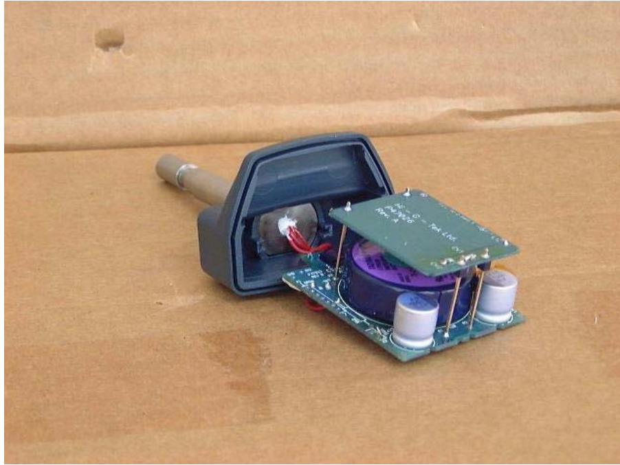
Figure 1 Internal View