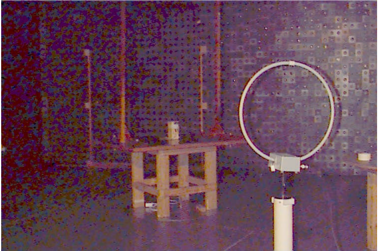
Photograph No.1 Radiated emission measurements test setup with loop antenna, 9 kHz – 30 MHz frequency range, anechoic chamber method