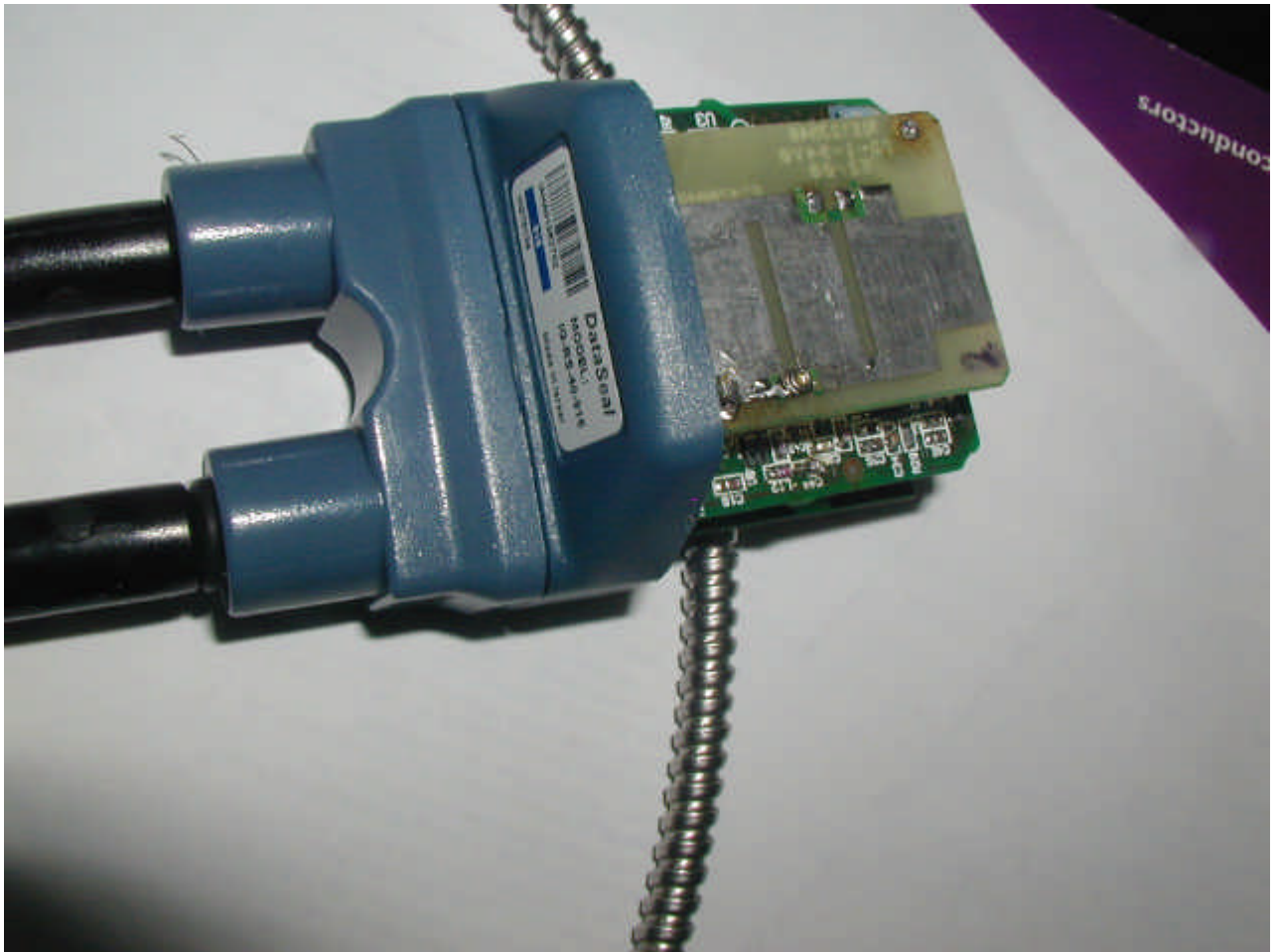
Photograph No.1 Internal view with antenna