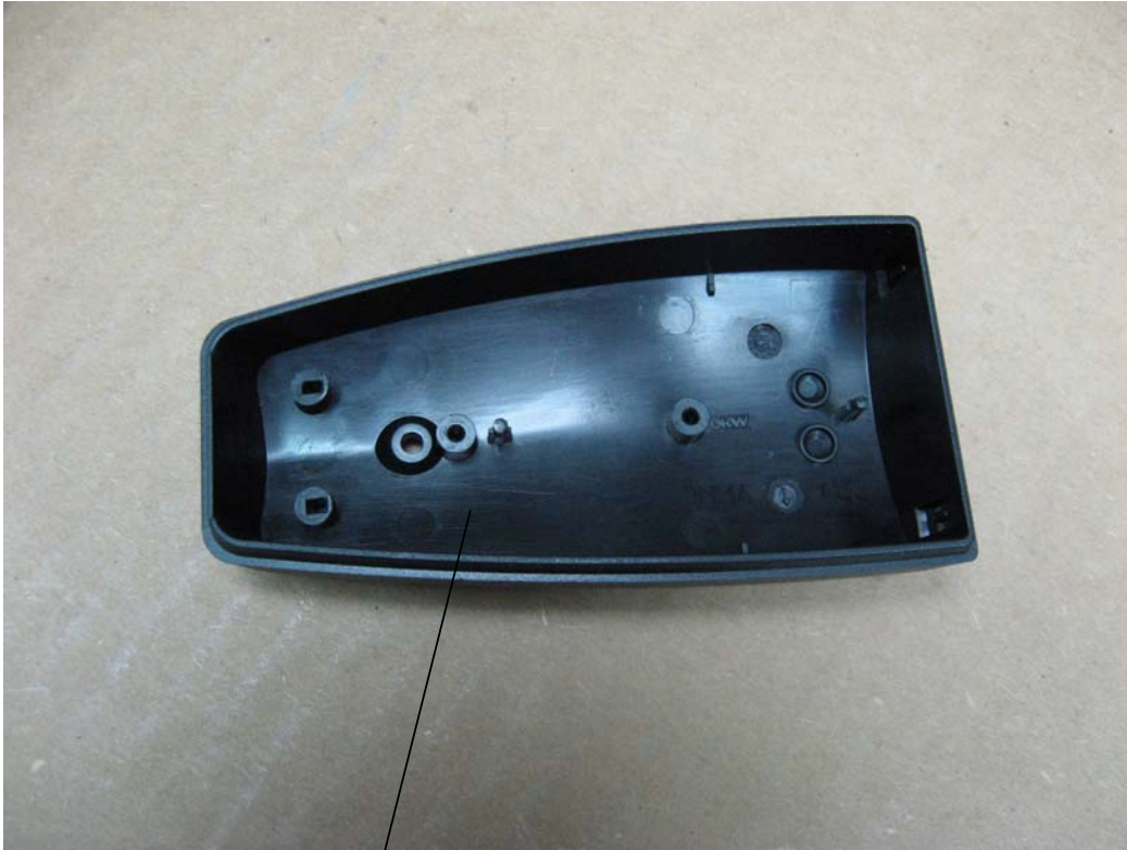
Bottom Plastic cover Bottom