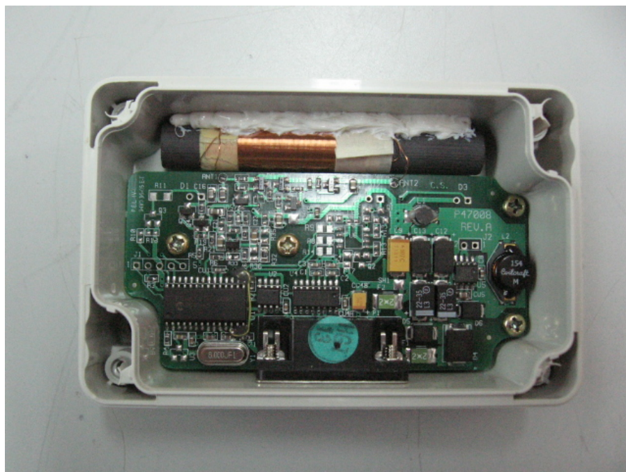
Figure 1 PCB in Cover