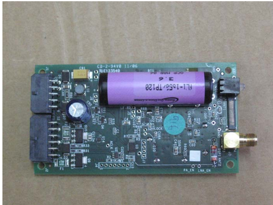
Figure 1 PCB Side 1