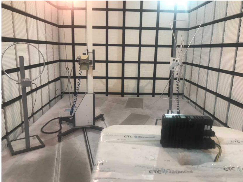
Photo 3 1-18 GHz test setup