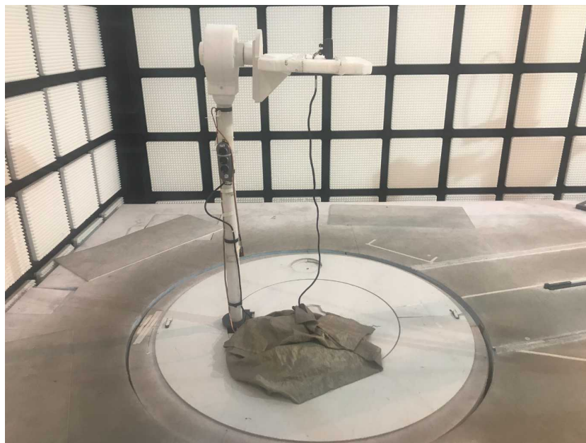
Photo 2 1-18 GHz test setup