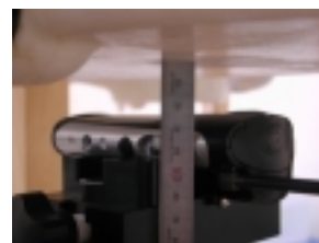
Figure 11. Mouth Face SAR Test Setup