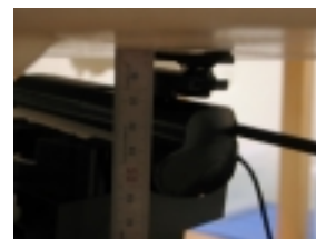
Figure 12. Body SAR Test Setup