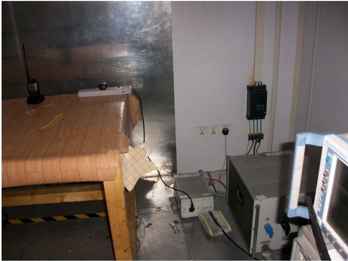
Conduction Emission setup3