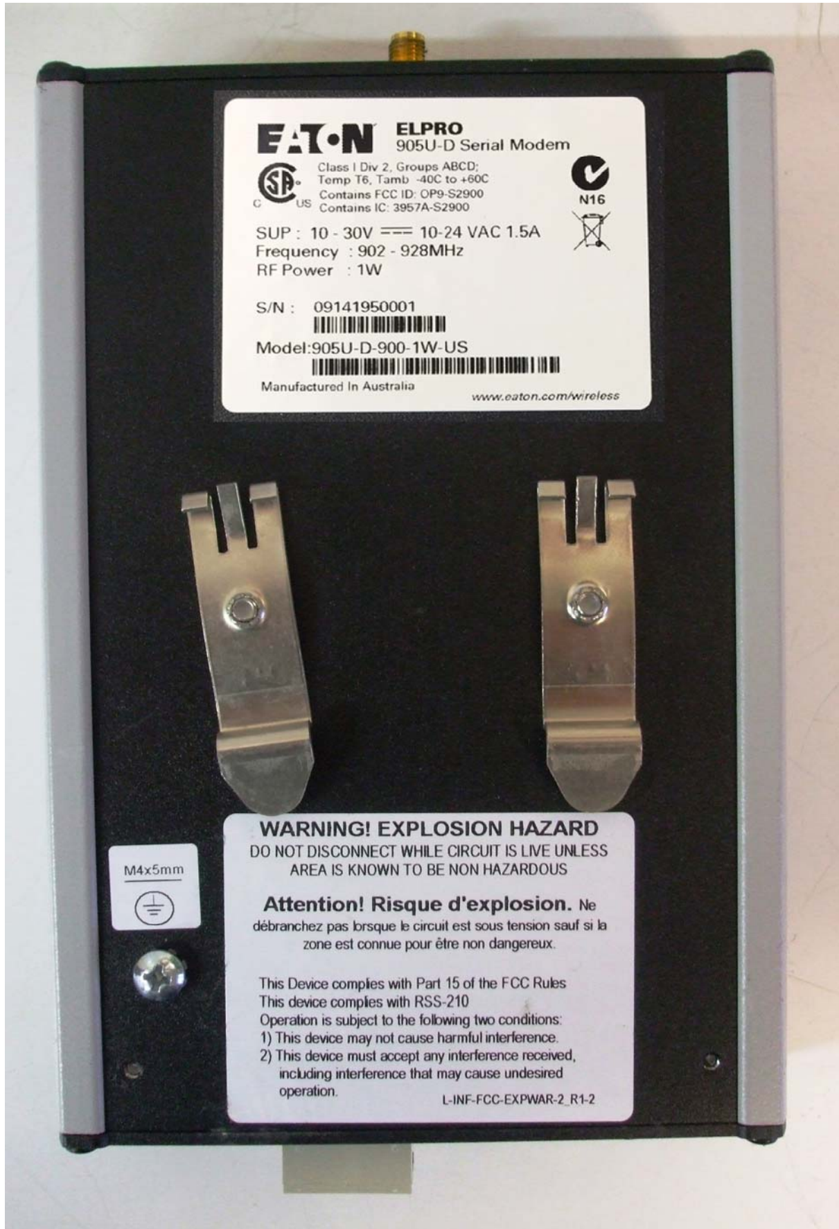
Label on Host details