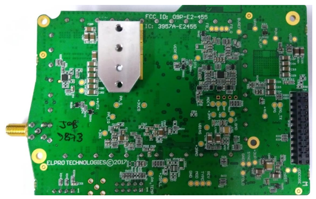
Under Side View - Heat Sink removed