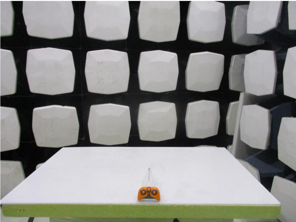
Up to 1GHz (EUT was placed in the centre of the turntable)