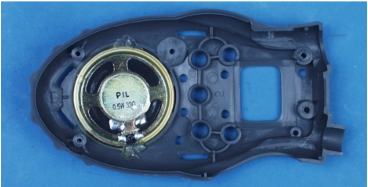
Inside Front Cover