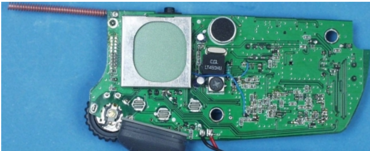
PCB Track Side