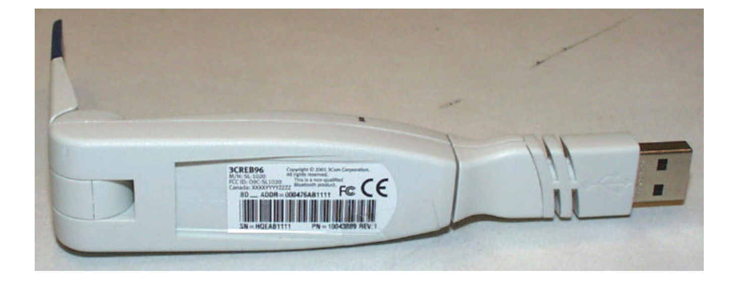
EXHIBIT 1: Labeling and Placement