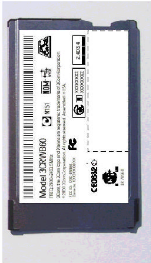
Photograph of Label Placement