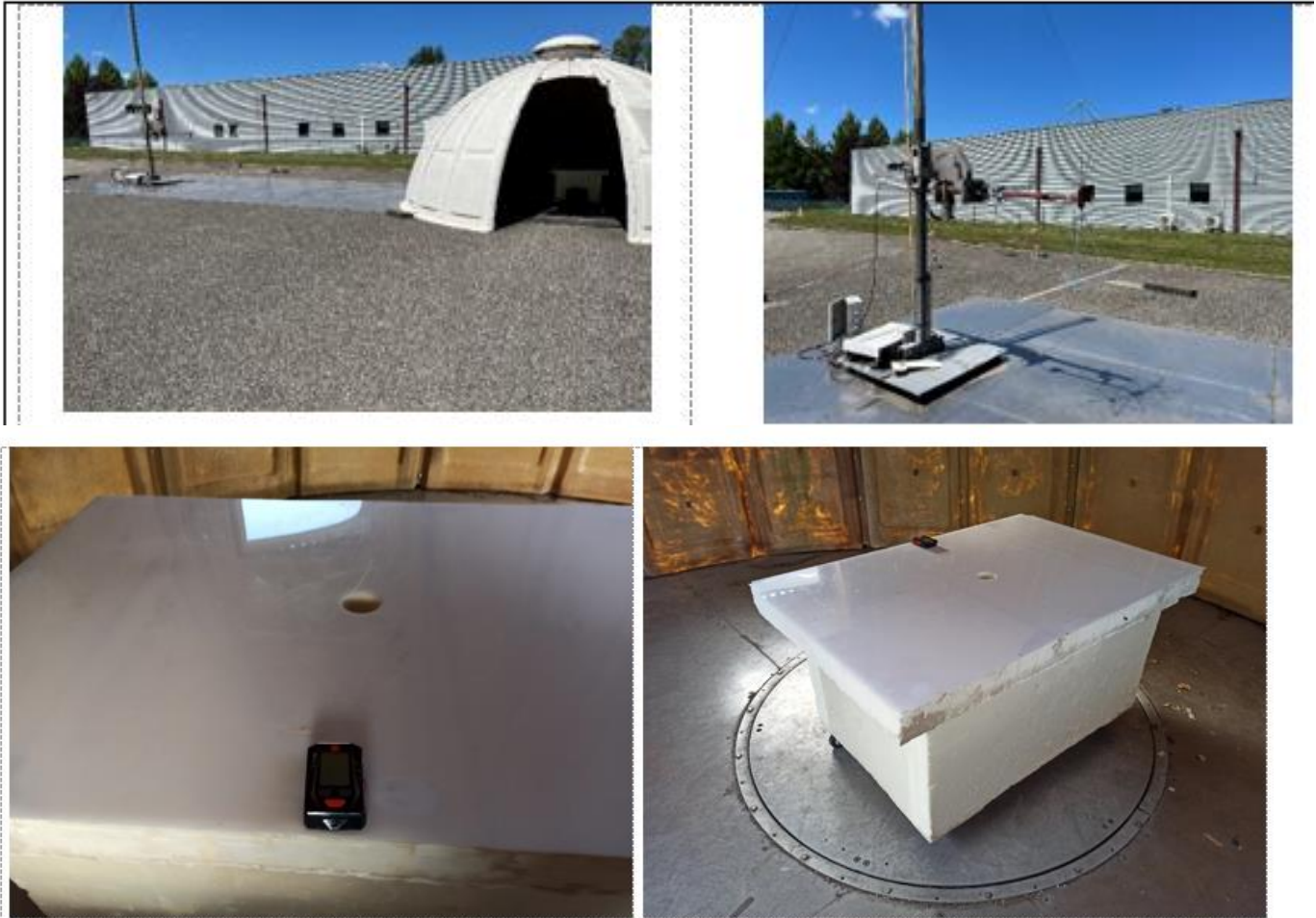
Test setup on OATS