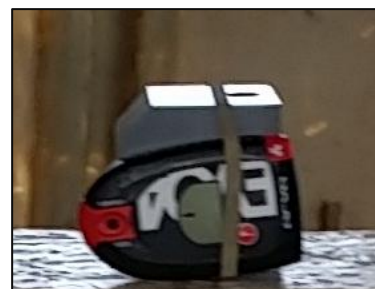
Radiated emission test setup