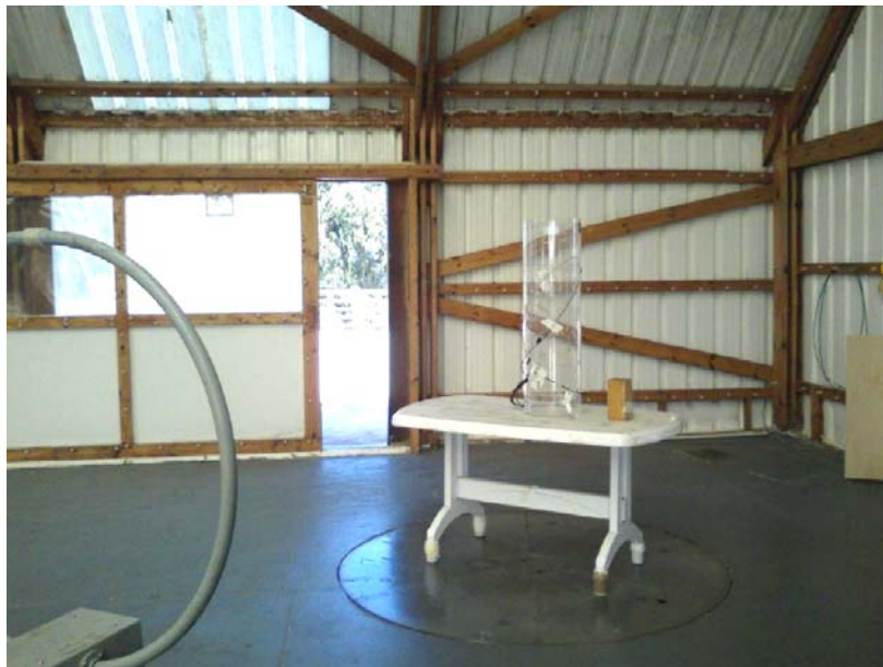
Photograph No.1 In-band radiated emissions measurement setup with loop antenna at the OATS