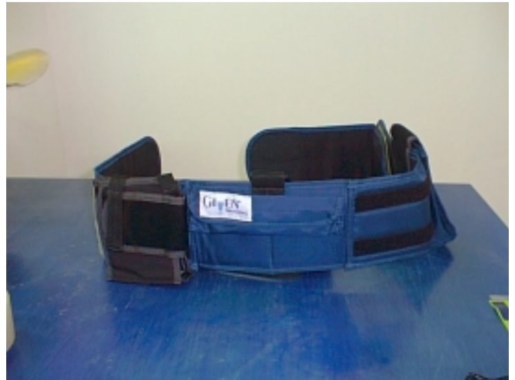
Waist belt – view from outside