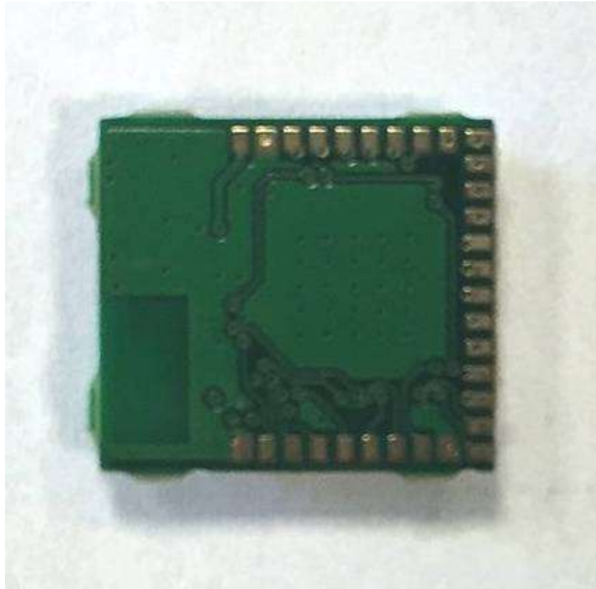
Figure 2. Solder Side of BLE Module

FCC Part 15 Certification O7P-RL78 10147A-RL78 17-0165 November 2, 2017 Inventek ISMRL78G1D