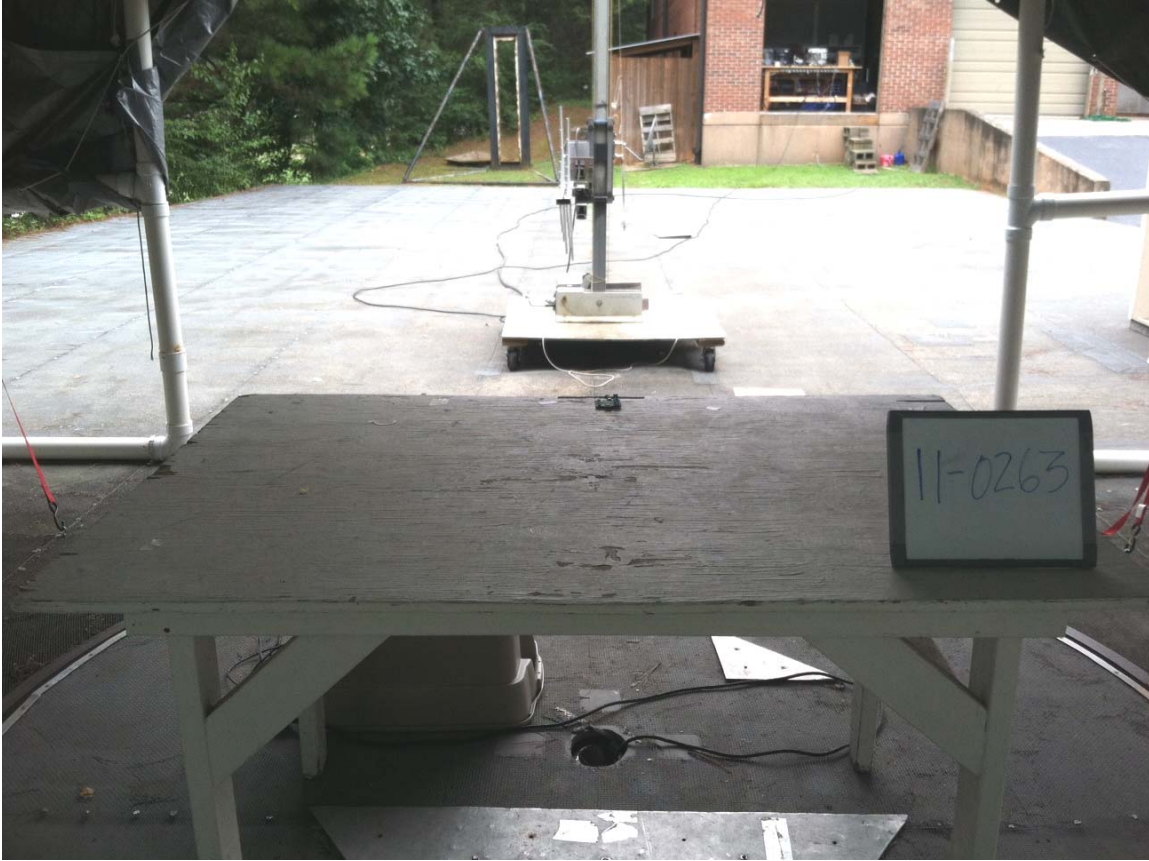
Figure 6- Test Setup, Log Periodic Antenna

FCC Part 15 Certification O7P-ISM4319F1 11-0263 April 11, 2012 Inventek Systems ISM4319-E, ISM4319-U, ISM4319-C