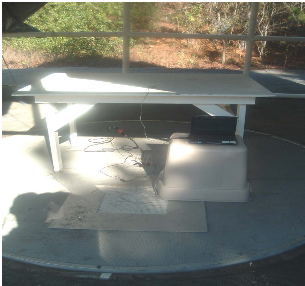
Figure 2- Radiated emissions Front View, Trace Antenna

FCC Part 15 Certification O7P-ISM4319F1 11-0263 April 11, 2012 Inventek Systems ISM4319-E, ISM4319-U, ISM4319-C