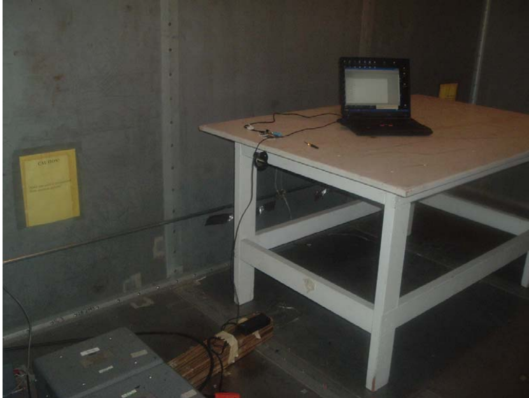
Figure 8- Conducted Emissions Test Setup

FCC Part 15 Certification O7P-ISM4319F1 11-0263 April 11, 2012 Inventek Systems ISM4319-E, ISM4319-U, ISM4319-C