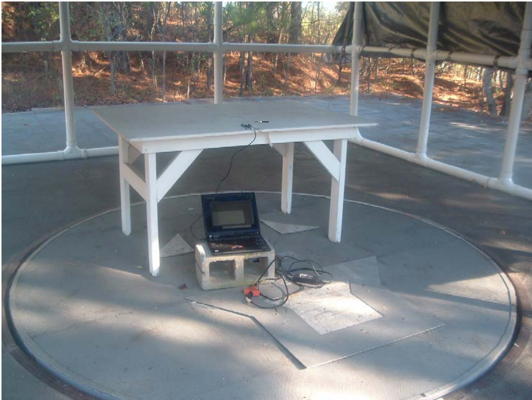
Figure 1- Radiated Emissions Front View, Dipole