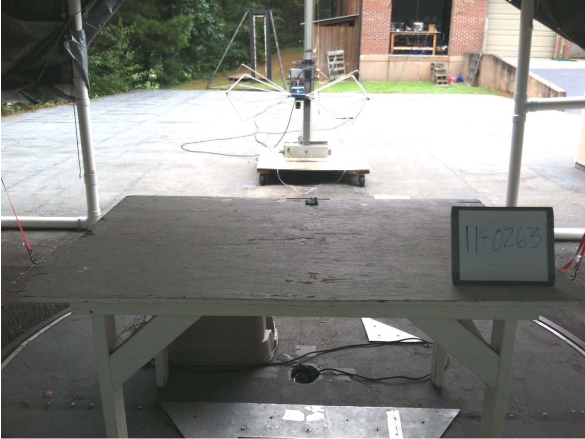
Figure 5- Test Setup, Bicon Antenna

FCC Part 15 Certification O7P-ISM4319F1 11-0263 April 11, 2012 Inventek Systems ISM4319-E, ISM4319-U, ISM4319-C