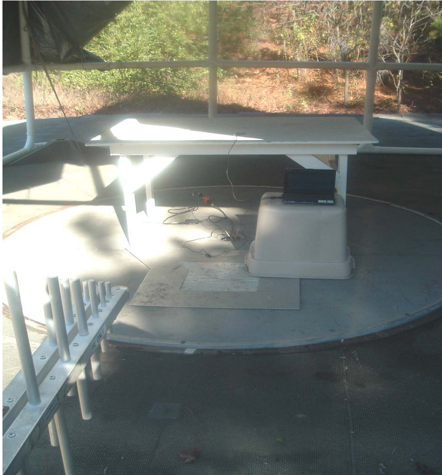
Figure 3- Radiated emissions Front View, Chip Antenna

FCC Part 15 Certification O7P-ISM4319F1 11-0263 April 11, 2012 Inventek Systems ISM4319-E, ISM4319-U, ISM4319-C