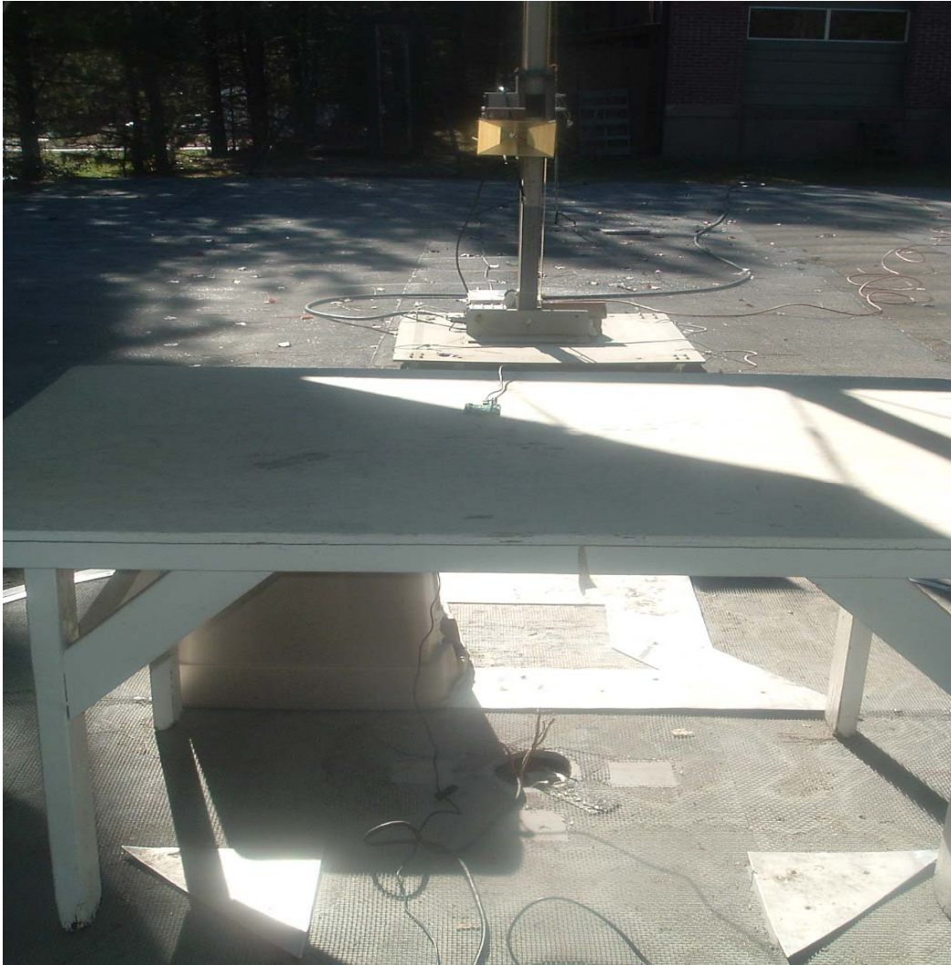
Figure 7- Radiated Emissions, Rear View

FCC Part 15 Certification O7P-ISM4319F1 11-0263 April 11, 2012 Inventek Systems ISM4319-E, ISM4319-U, ISM4319-C