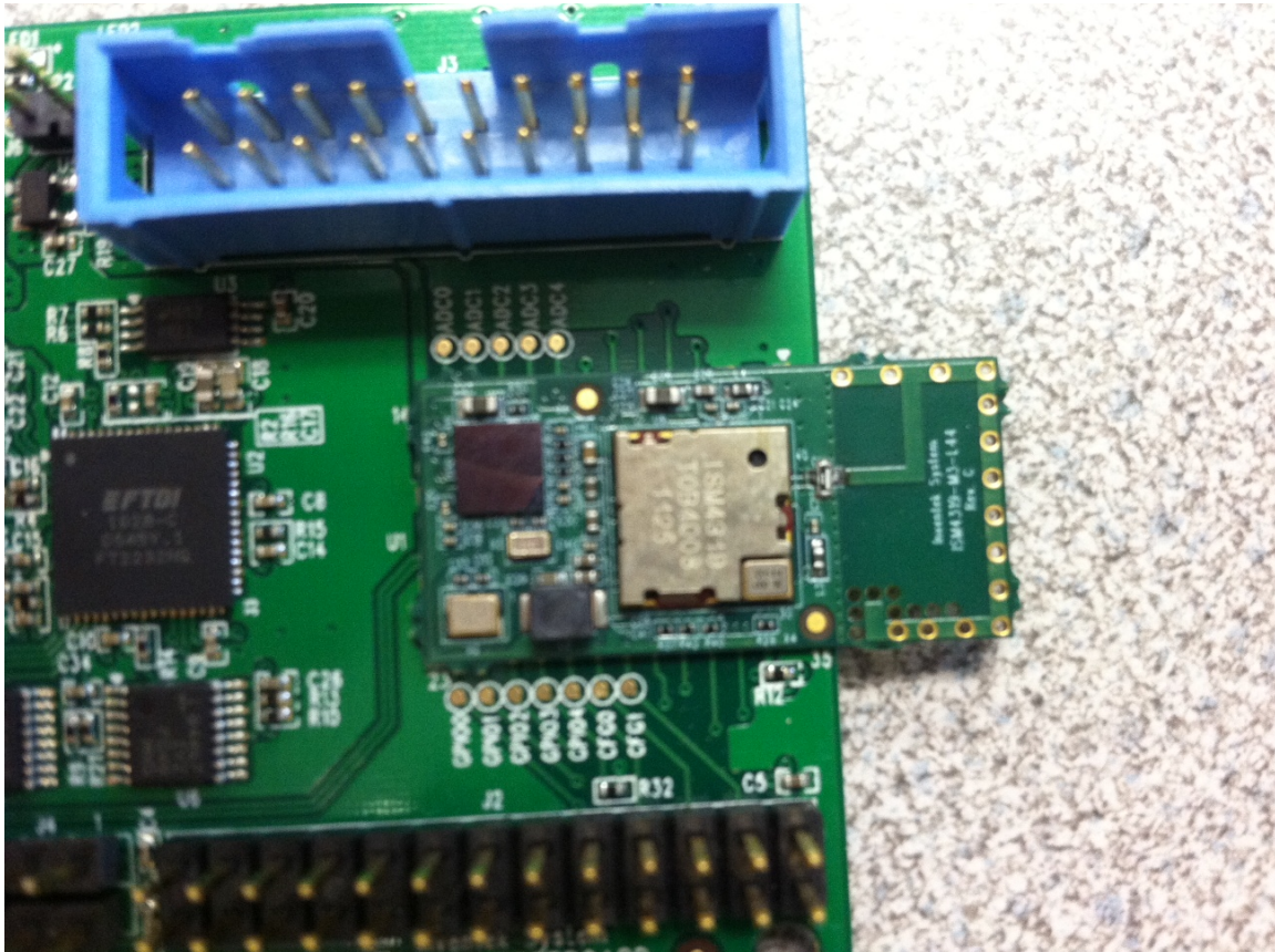
Figure 4- Radio Module with Trace Antenna - Top View

FCC Part 15 Certification O7P-ISM4319F1 11-0263 April 11, 2012 Inventek Systems ISM4319-E, ISM4319-U, ISM4319-C