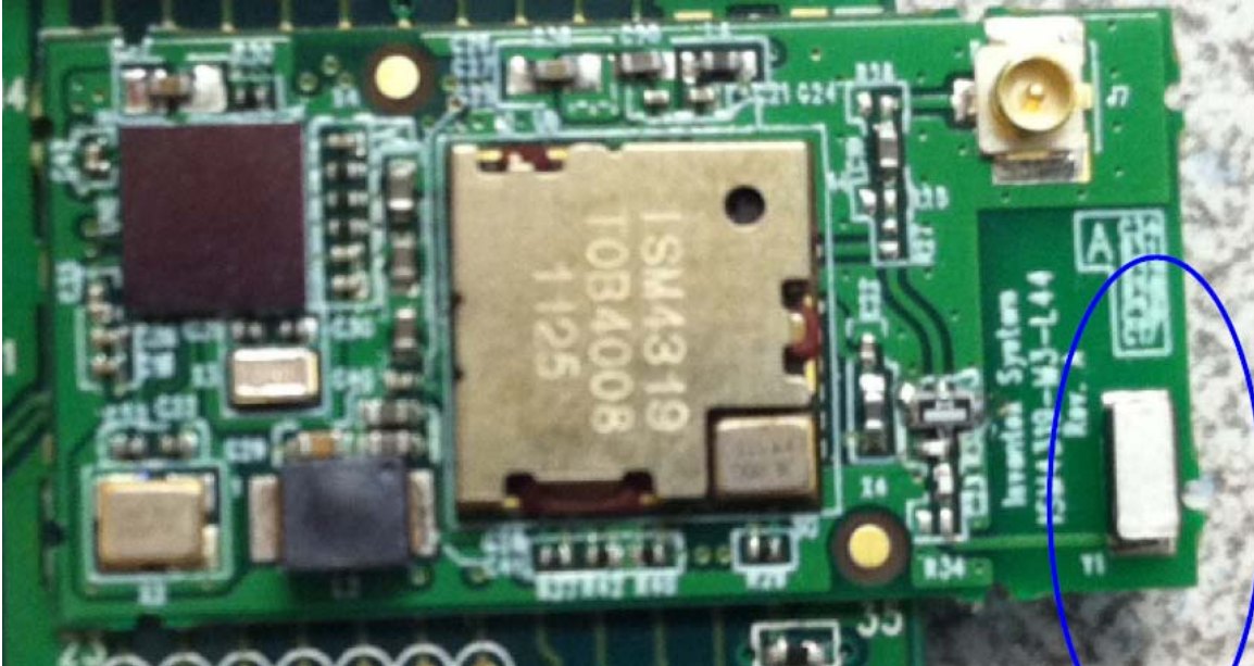
Figure 5. Enlarged Photo of Module Board

FCC Part 15 Certification O7P-ISM4319F1 11-0263 April 11, 2012 Inventek Systems ISM4319-E, ISM4319-U, ISM4319-C