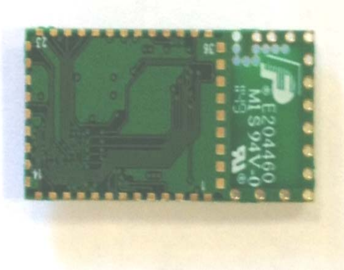
Figure 1- Radio Module - Rear View