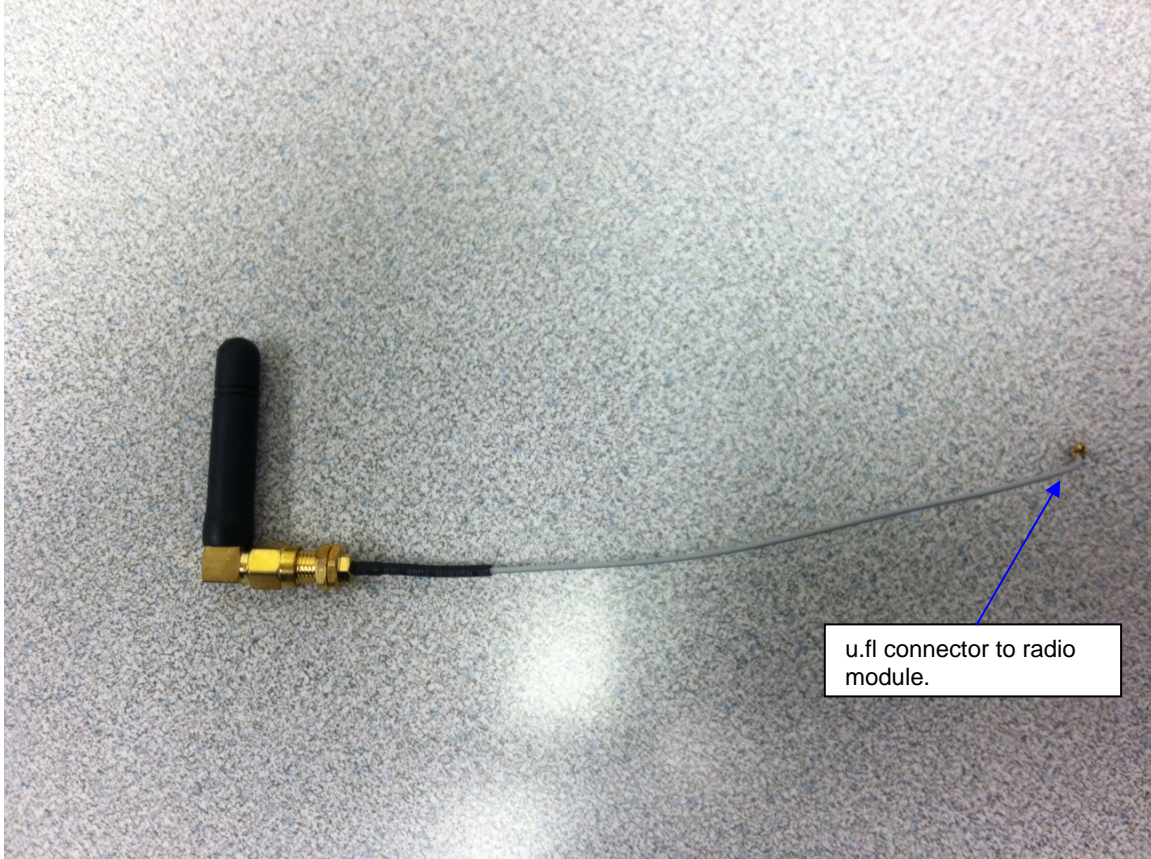
Figure 3- Dipole Antenna

FCC Part 15 Certification O7P-ISM4319F1 11-0263 April 11, 2012 Inventek Systems ISM4319-E, ISM4319-U, ISM4319-C