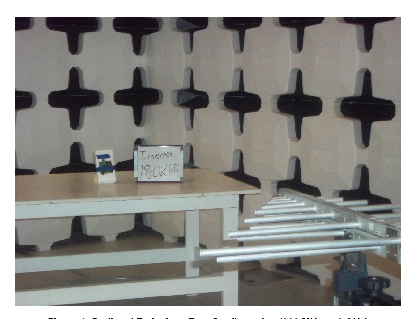
Figure 3. Radiated Emissions Test Configuration (200 MHz to 1 GHz)

US Tech Test Report: FCC ID: IC: Test Report Number: Issue date: Customer: Model: