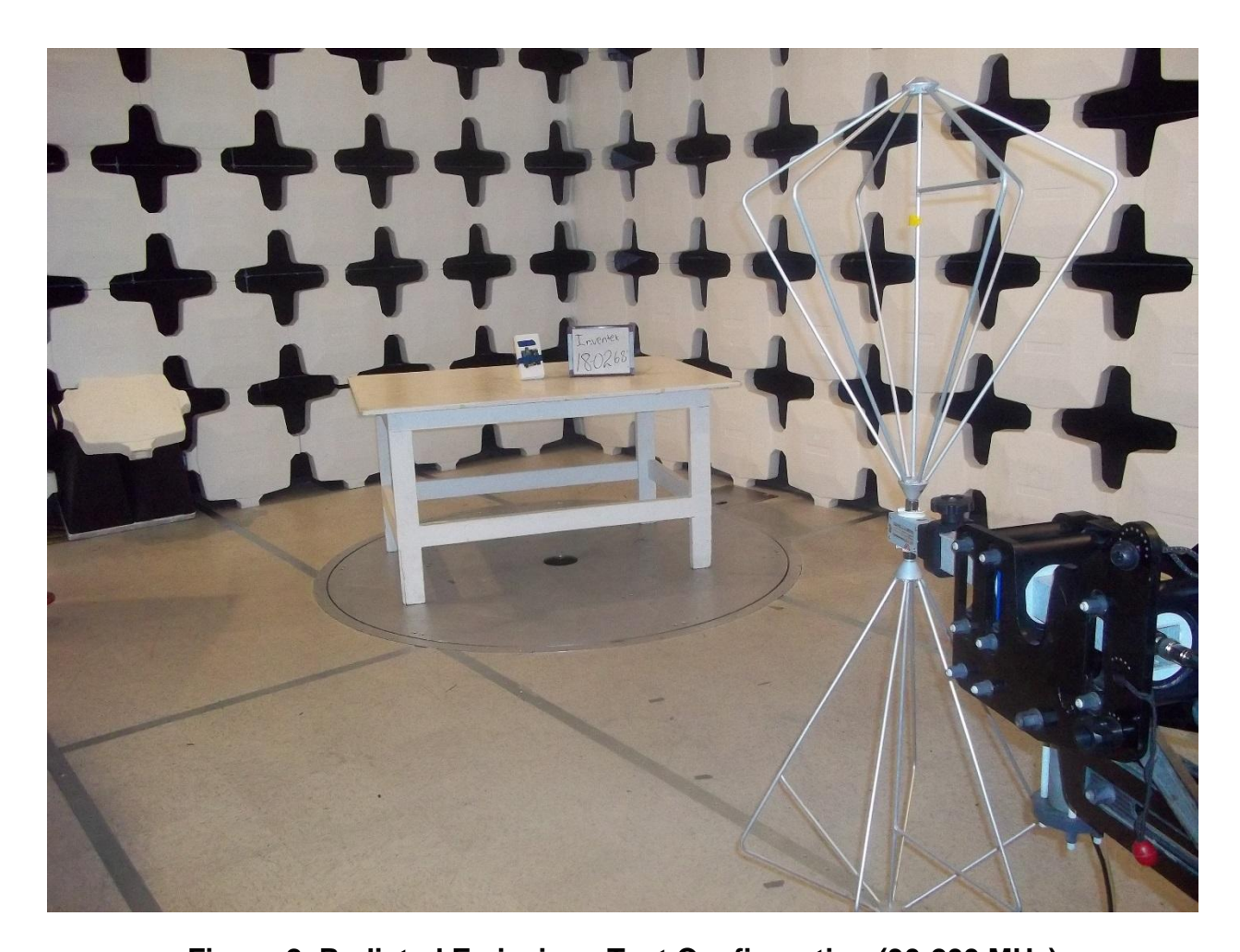
Figure 2. Radiated Emissions Test Configuration (30-200 MHz)

US Tech Test Report: FCC ID: IC: Test Report Number: Issue date: Customer: Model: