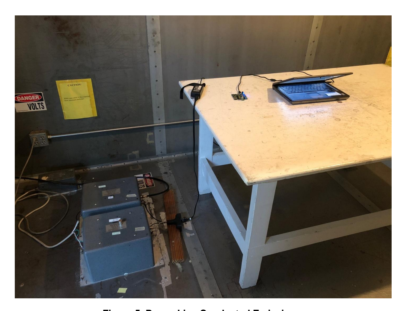
Figure 5. Power Line Conducted Emissions

US Tech Test Report: FCC ID: IC: Test Report Number: Issue date: Customer: Model: