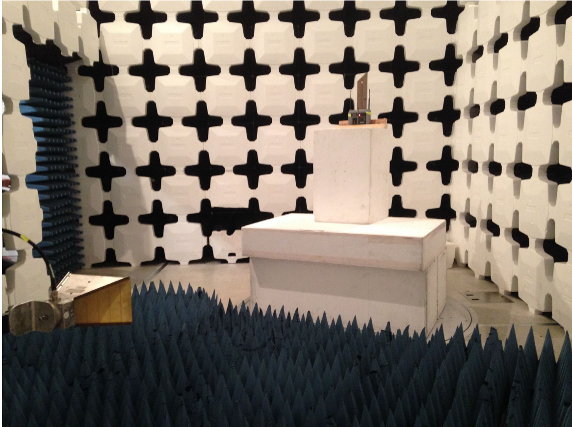
Figure 4. Radiated Emissions above 1 GHz, Intentional Emissions

FCC Part 15 Certification/ RSS 210 O7P-362 10147A-362 21-0267 November 12, 2021 Inventek Systems ISM43362-M3G-L44-*