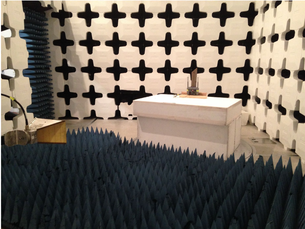
Figure 3. Radiated Emissions above 1 GHz, Spurious Emissions

FCC Part 15 Certification/ RSS 210 O7P-362 10147A-362 21-0267 November 12, 2021 Inventek Systems ISM43362-M3G-L44-*