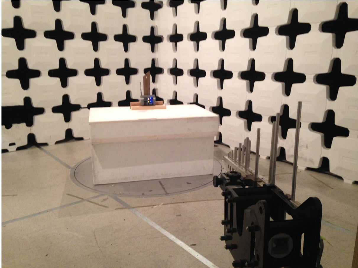
Figure 2. Radiated Emissions 200 MHz to 1 GHz

FCC Part 15 Certification/ RSS 210 O7P-362 10147A-362 21-0267 November 12, 2021 Inventek Systems ISM43362-M3G-L44-*