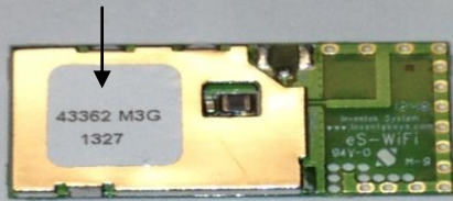
SAMPLE LABEL FOR MODEL ISM43362-M3G-L44-E

Inventek Mod: ISM43362-M3G-L44-E FCC ID: 07P-362 IC: 10147A-362 Date code : xxxX