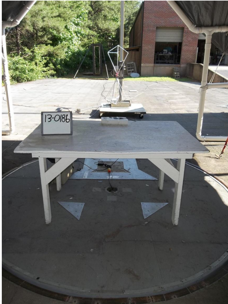
Figure 3- Radiated Emissions, Bicon Antenna

FCC Part 15 Certification O7P-362 10147A-362 13-0186 July 29, 2013 Inventek Systems ISM43362-M3G-L44-E and ISM43362-M3G-L44-U