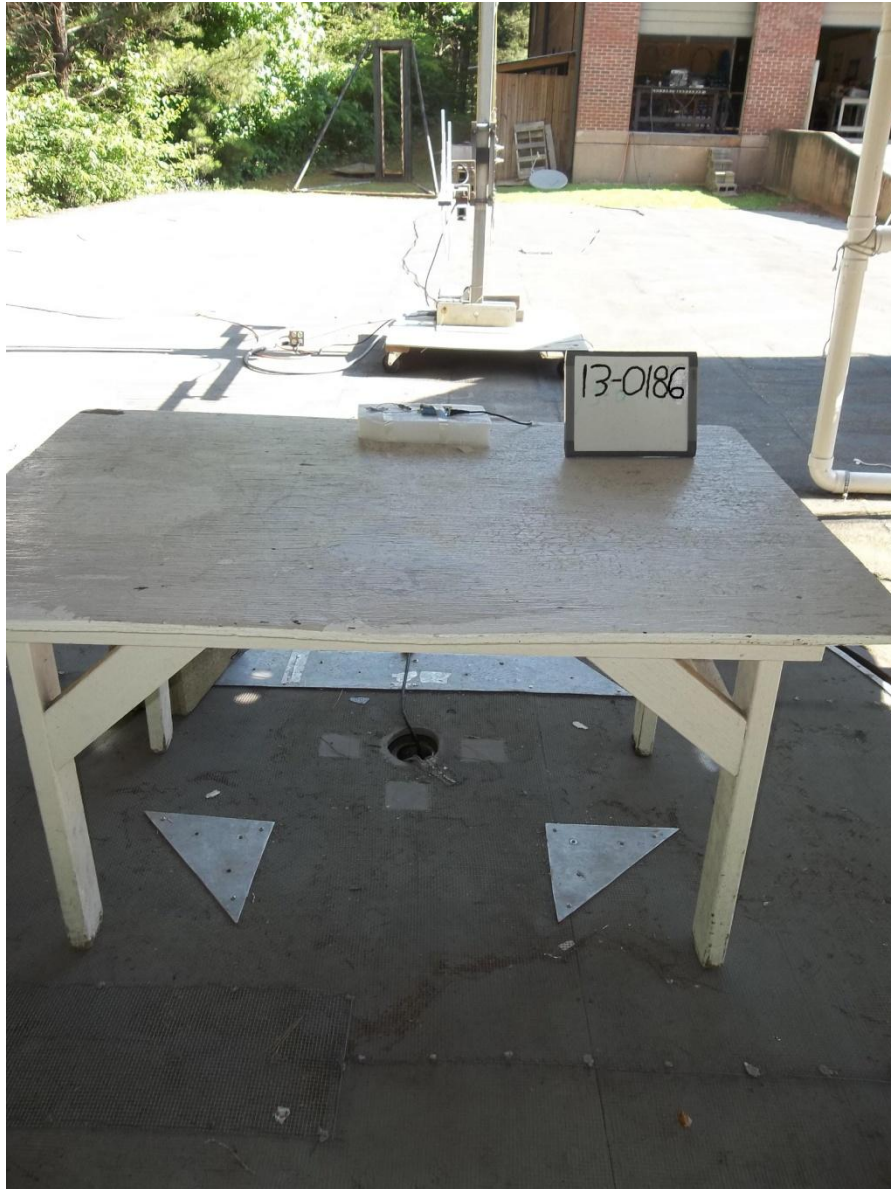
Figure 2- Radiated Emissions, Log Periodic Antenna

FCC Part 15 Certification O7P-362 10147A-362 13-0186 July 29, 2013 Inventek Systems ISM43362-M3G-L44-E and ISM43362-M3G-L44-U