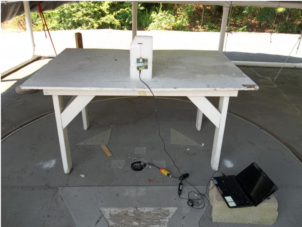
Figure 1- Radiated Emissions Test configuration