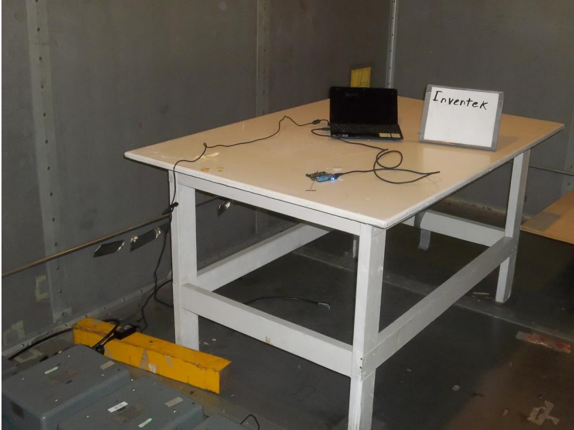
Figure 5- Conducted Emissions Test Setup

FCC Part 15 Certification O7P-362 10147A-362 13-0186 July 29, 2013 Inventek Systems ISM43362-M3G-L44-E and ISM43362-M3G-L44-U