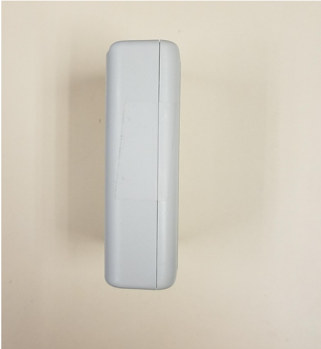
Host Device – Side 2

FCC Part 15/ISED Certification 07P-341 0147A-341 17-0338 March 30, 2018 Inventek ISM43340-M4G-L44