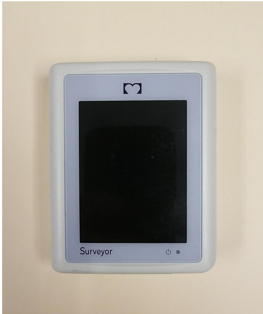
Host Device – Front View

FCC Part 15/ISED Certification 07P-341 0147A-341 17-0338 March 30, 2018 Inventek ISM43340-M4G-L44