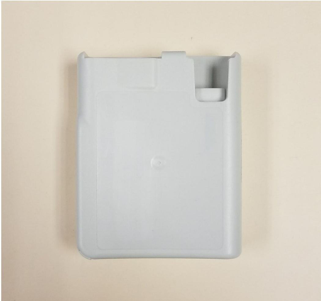
Host Device – Back View

FCC Part 15/ISED Certification 07P-341 0147A-341 17-0338 March 30, 2018 Inventek ISM43340-M4G-L44