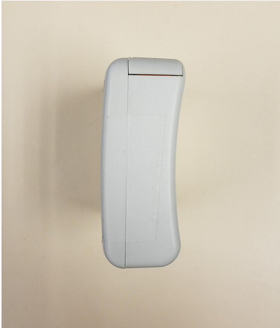
Host Device – Bottom Side

FCC Part 15/ISED Certification 07P-341 0147A-341 17-0338 March 30, 2018 Inventek ISM43340-M4G-L44