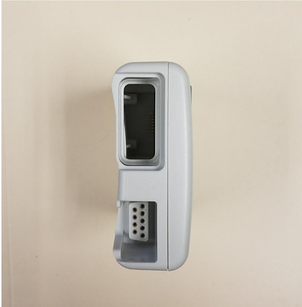
Host Device – Top Side

FCC Part 15/ISED Certification 07P-341 0147A-341 17-0338 March 30, 2018 Inventek ISM43340-M4G-L44