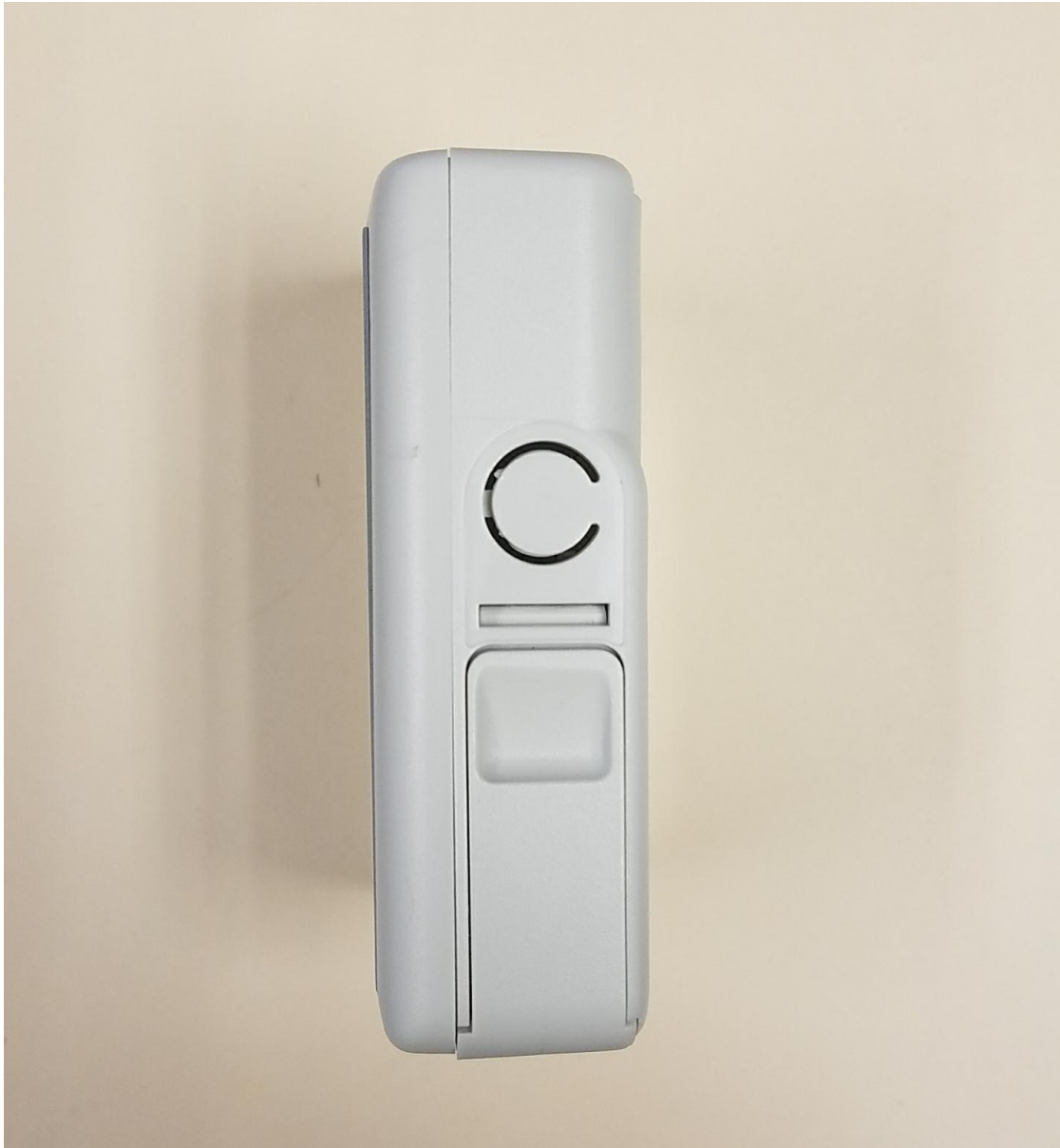
Host Device – Side 1

FCC Part 15/ISED Certification 07P-341 0147A-341 17-0338 March 30, 2018 Inventek ISM43340-M4G-L44