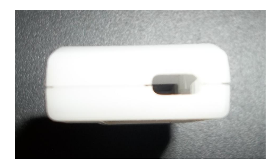
Figure 6. Button Removed