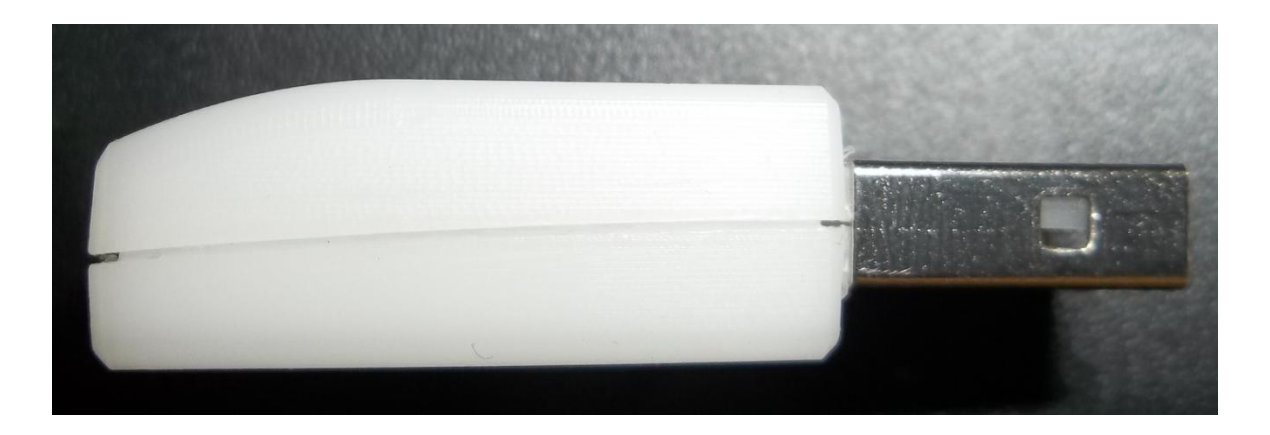
Figure 4. EUT Side 2