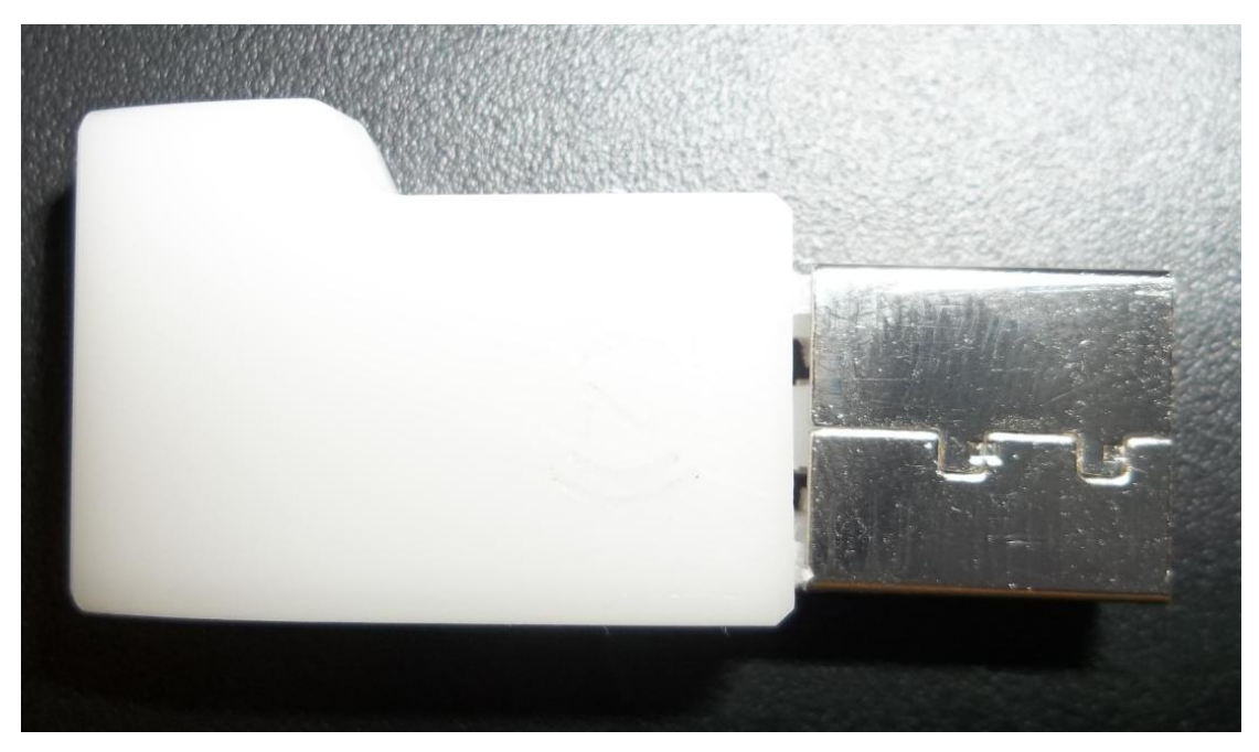
Figure 2. EUT Bottom