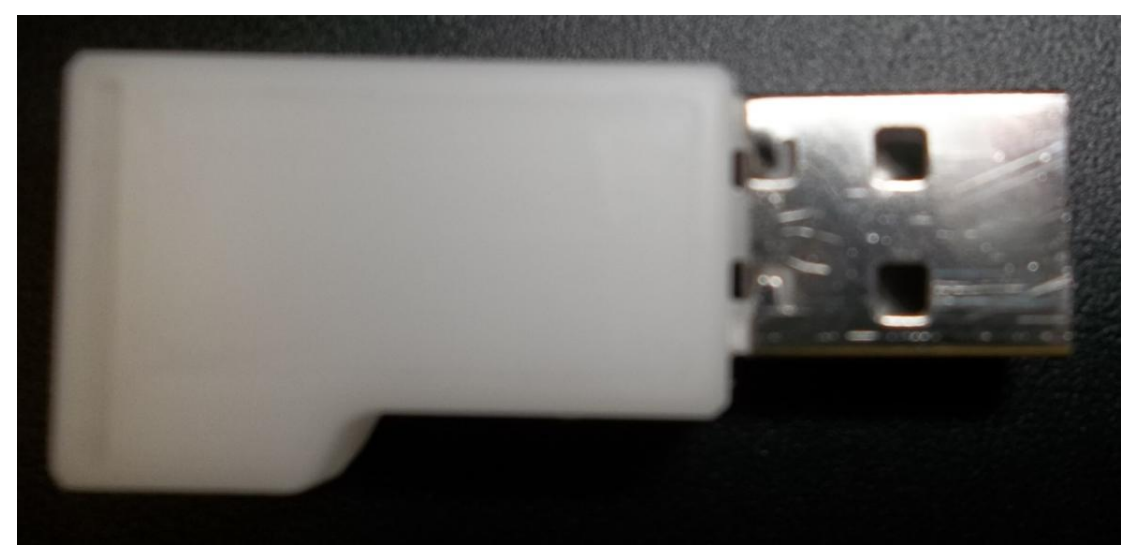
Figure 1. EUT Top