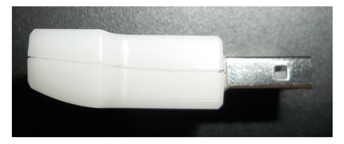
Figure 3. EUT Side 1

FCC Part 15 Certification O7P-2531F 10147A-2531F 14-0212 September 19, 2014 Inventek Systems ISM2531-USB-F