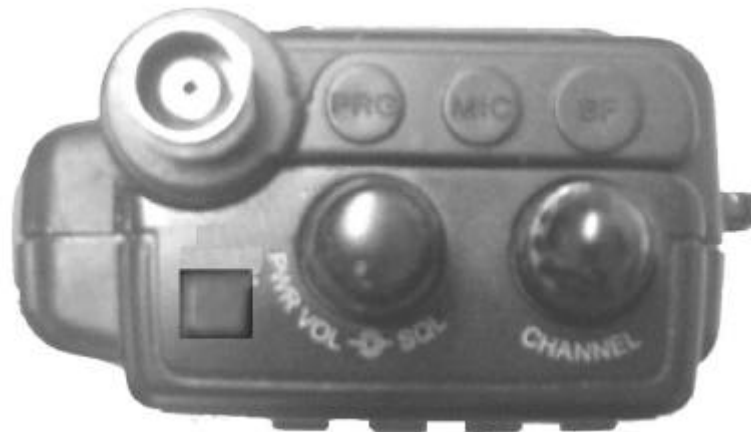
SCV08 Top View