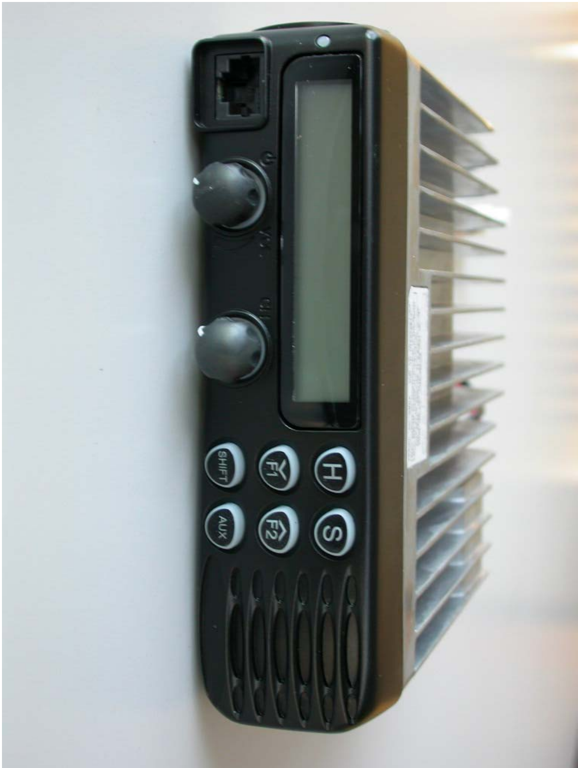
1) Model view of SC-980A – Front view