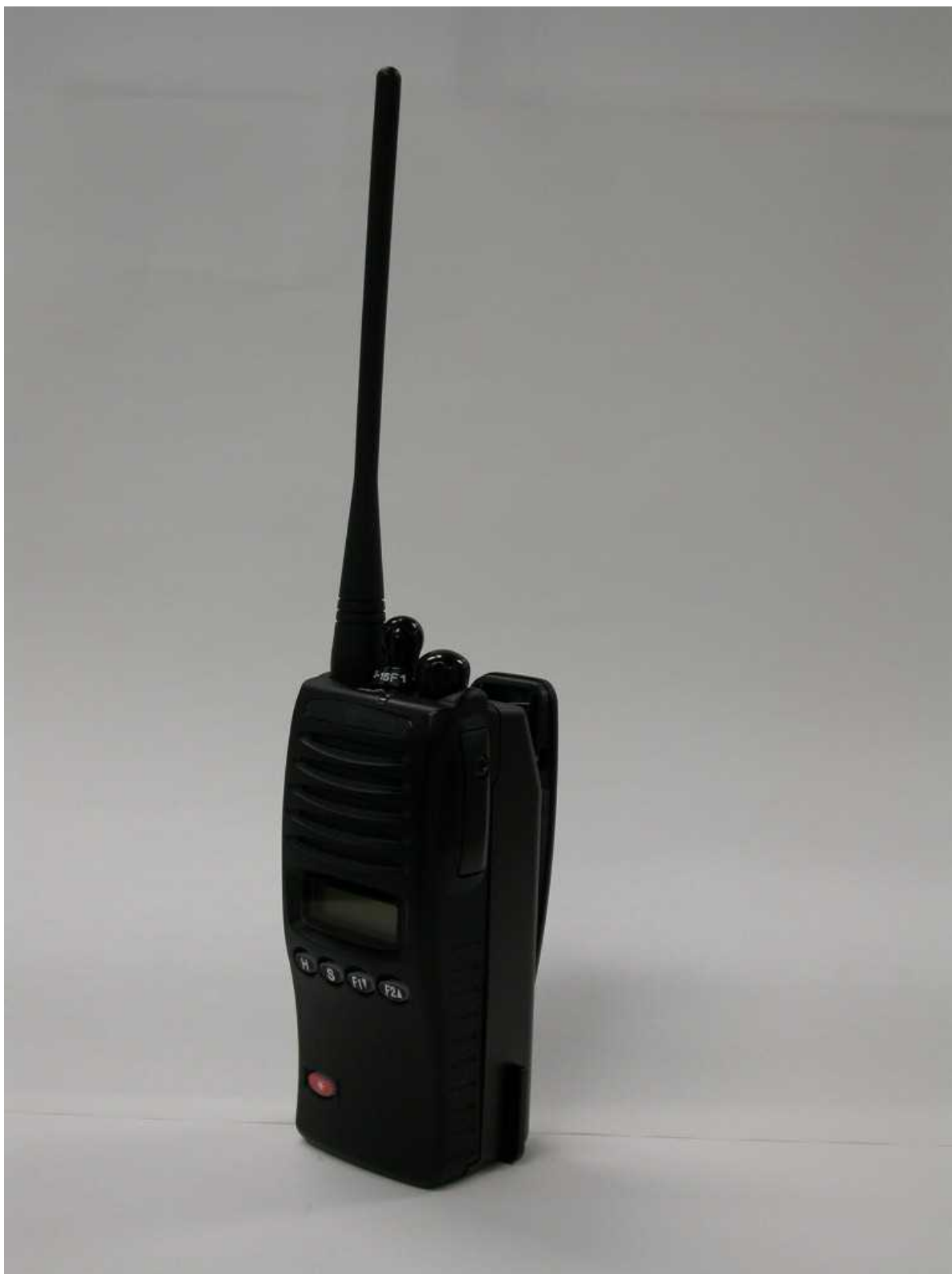
1) Model view of SC-581 C – Front Three- Quarter View 1