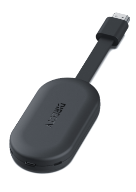
3. Side View