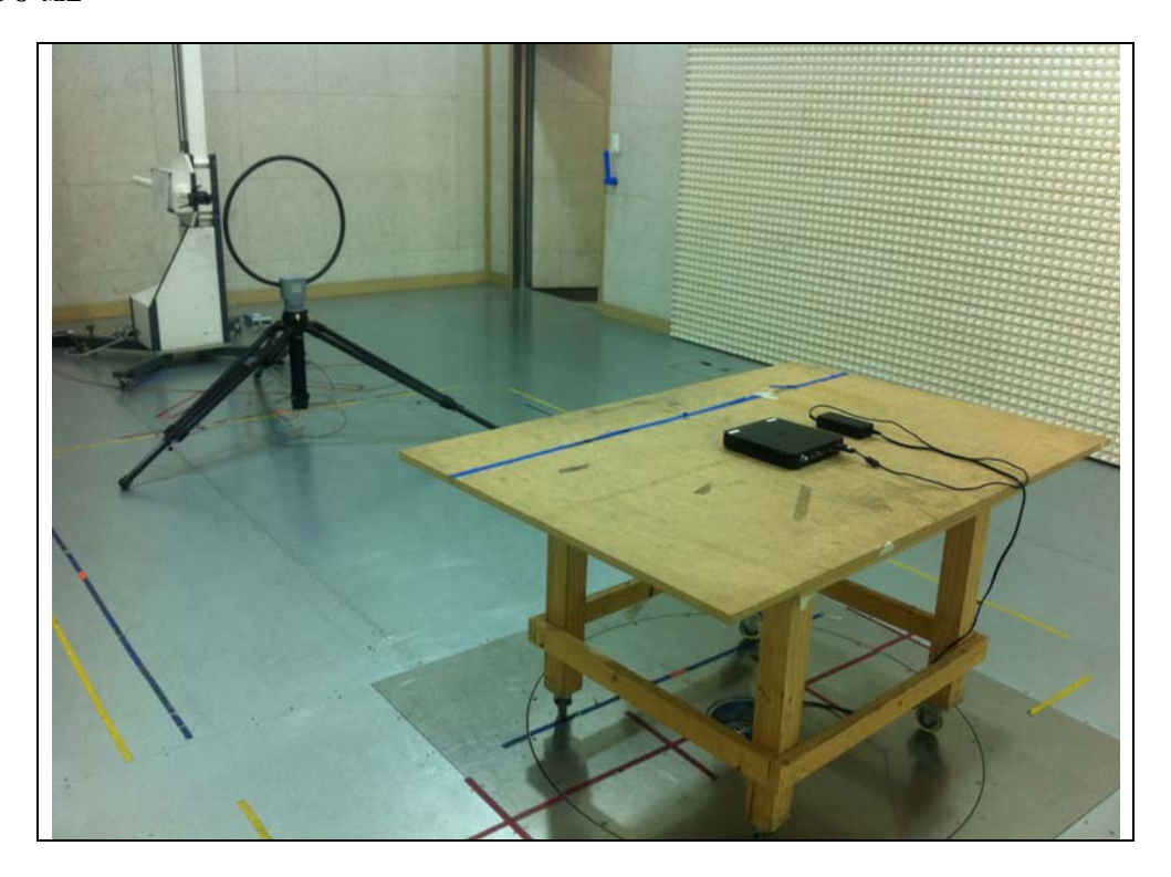
* 30 MHz ~ 1 GHz