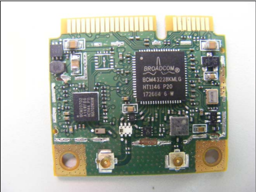
Bottom view of WLAN and BT module