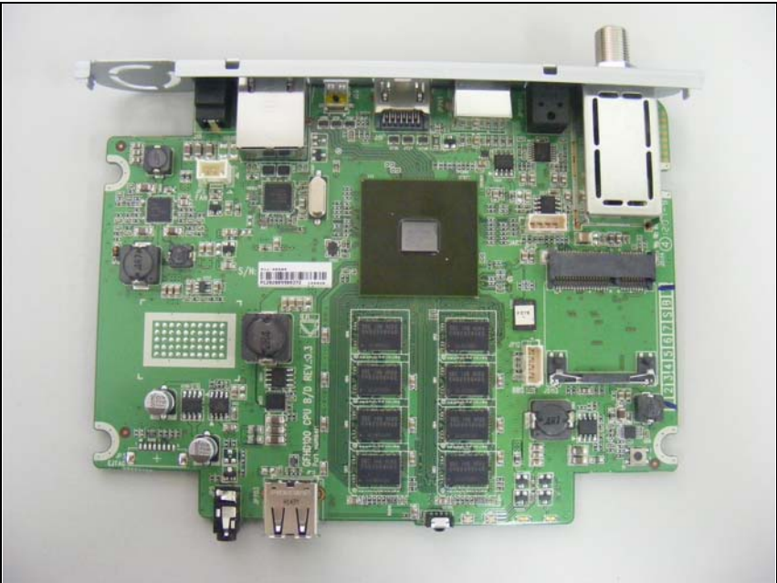
Bottom view of Main PCB