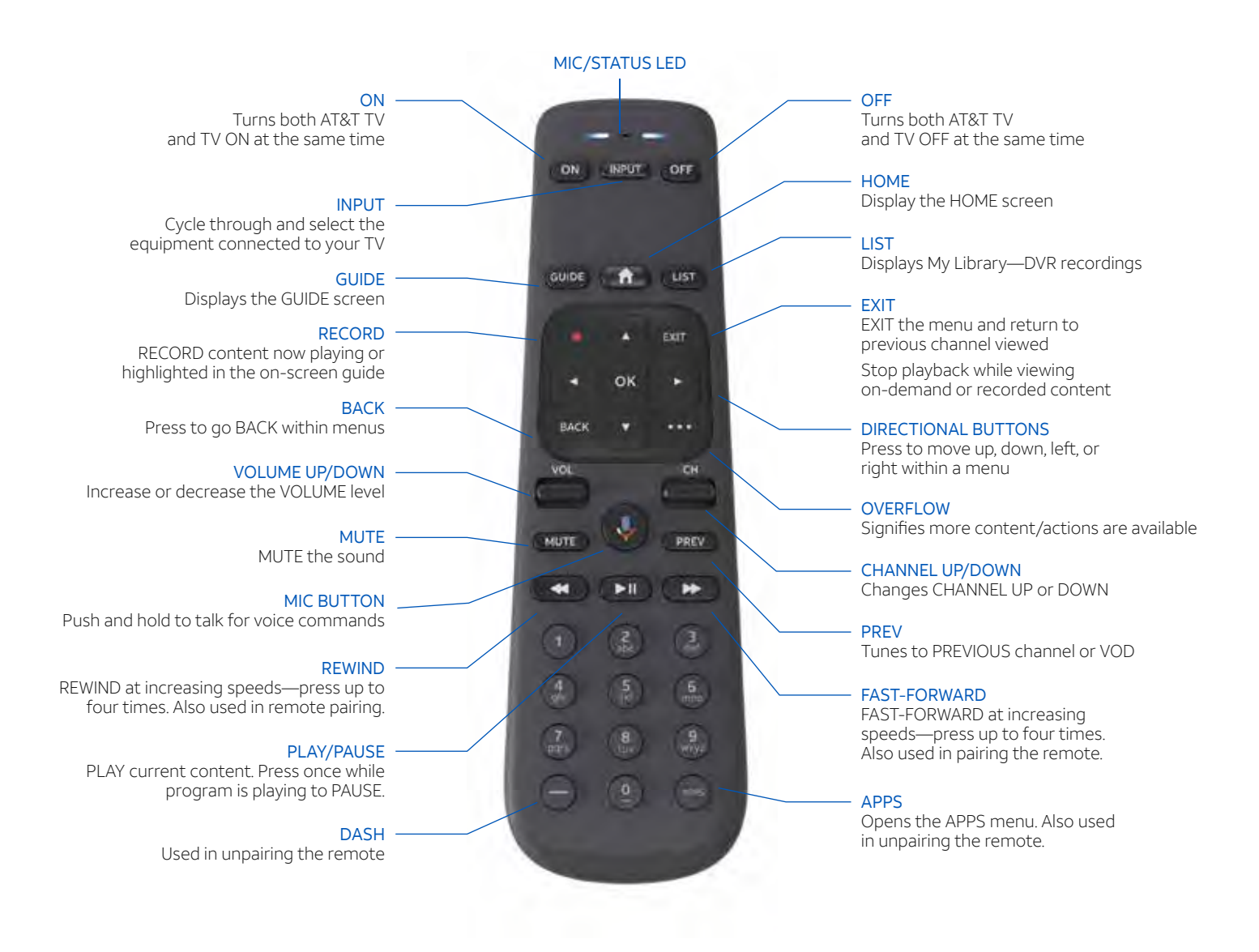
FIGURE 5: RC82V—REMOTE