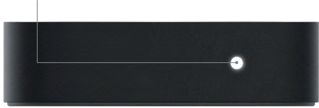
FIGURE 1: AT&T TV—FRONT PANEL