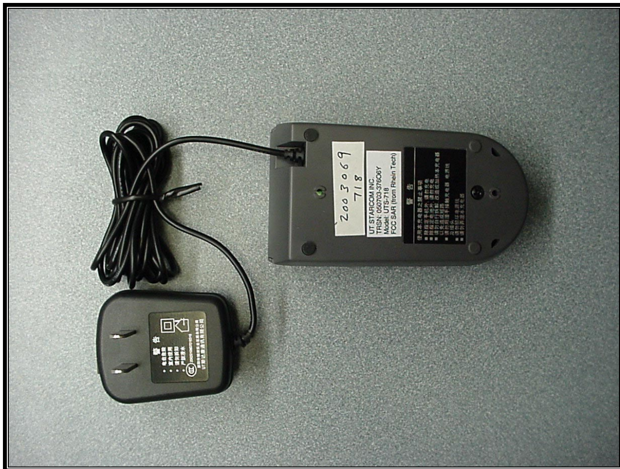
PHOTOGRAPH 21: SMALL BATTERY CHARGER BOTTOM VIEW