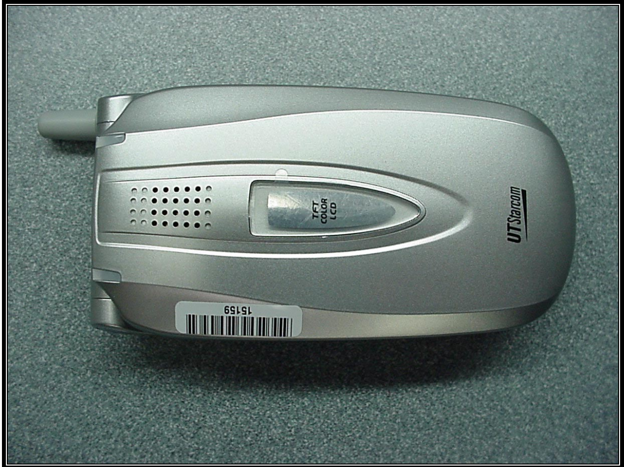
PHOTOGRAPH 8: FRONT VIEW