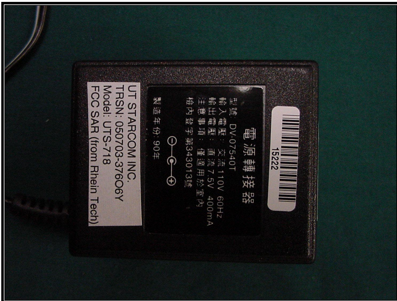
PHOTOGRAPH 19: ADAPTER BACK VIEW