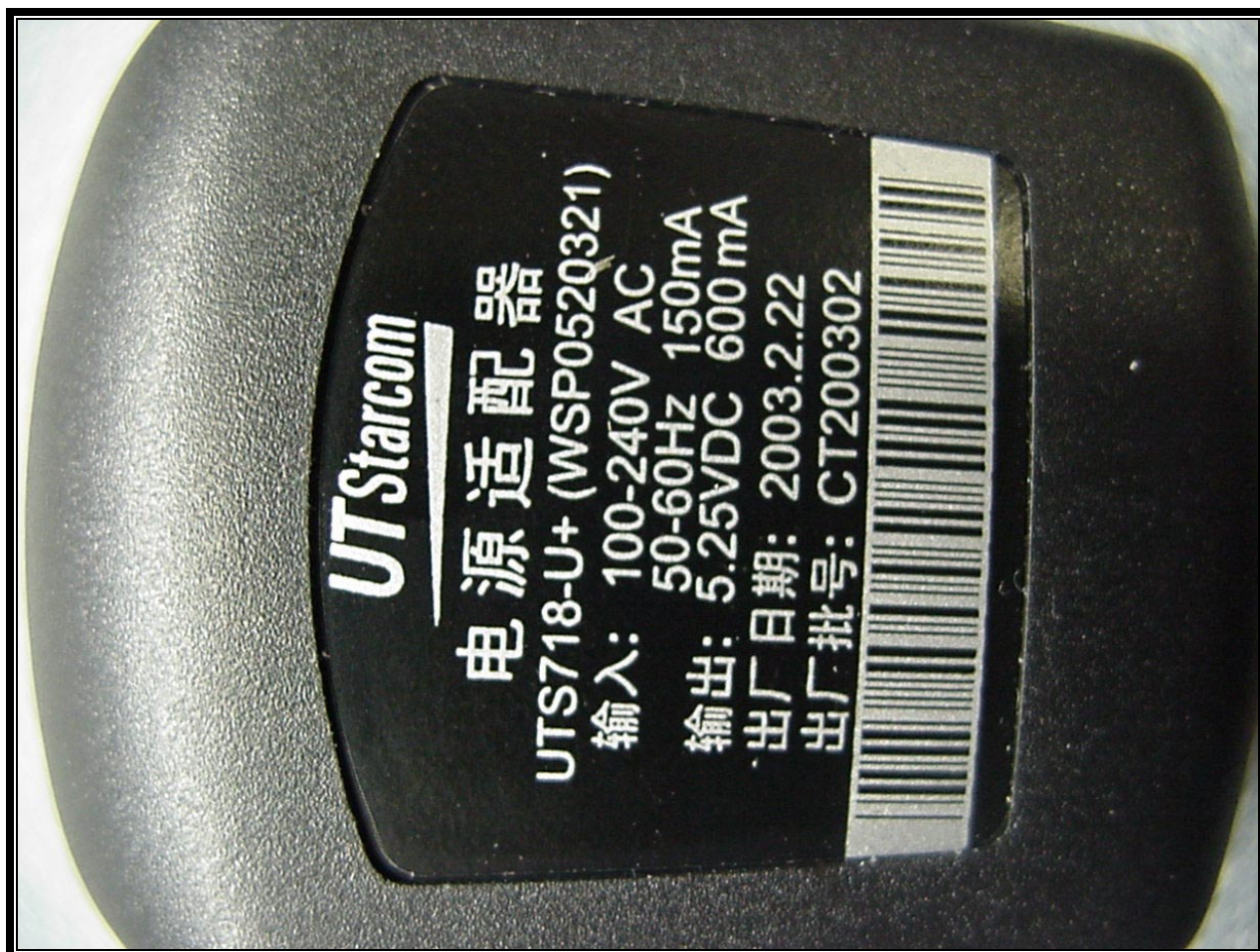
PHOTOGRAPH 22: SMALL BATTERY CHARGER AC/DC UNIT TOP VIEW