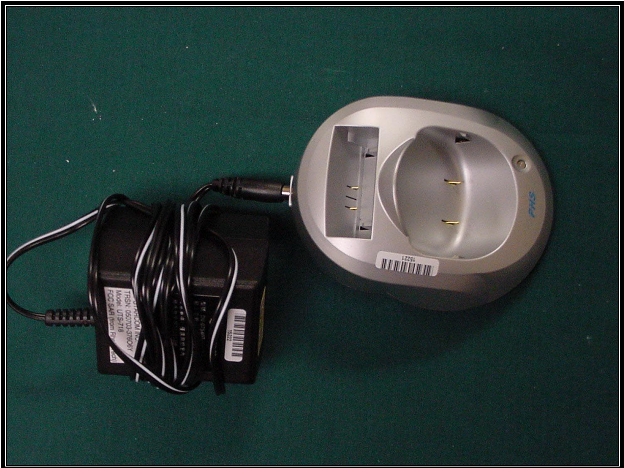
PHOTOGRAPH 15: ADAPTER AND CHARGER