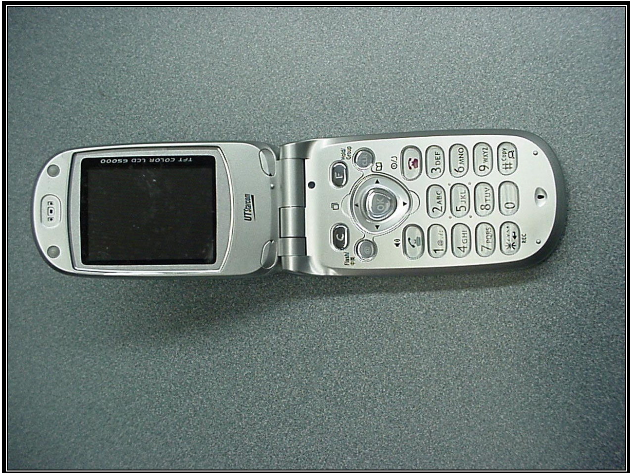
PHOTOGRAPH 13: EUT OPENED