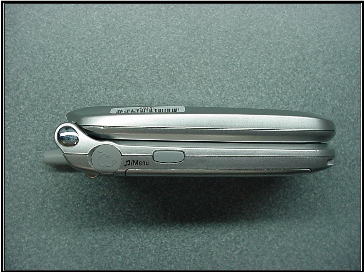
PHOTOGRAPH 10: LEFT SIDE VIEW