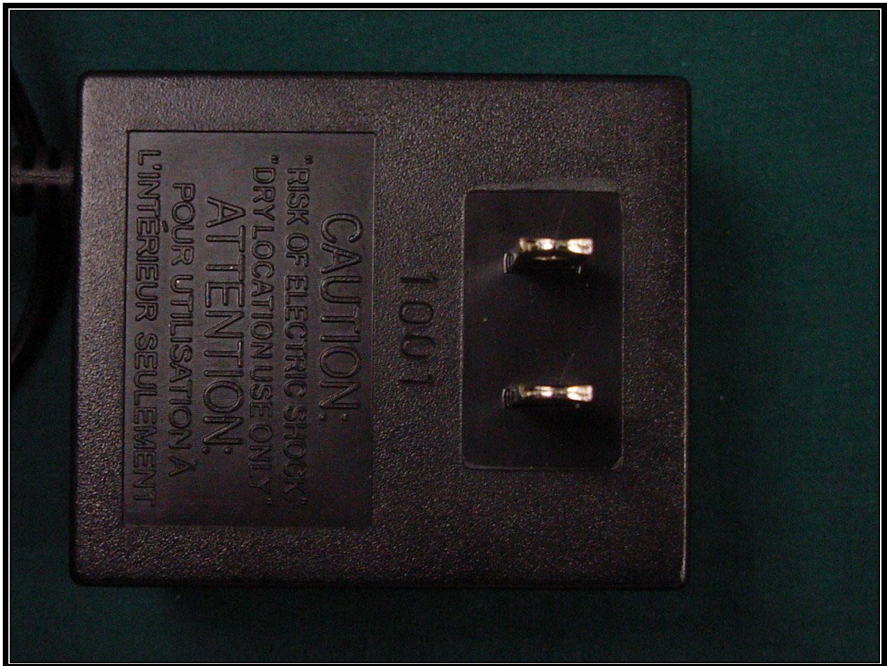
PHOTOGRAPH 18: ADAPTER FRONT VIEW