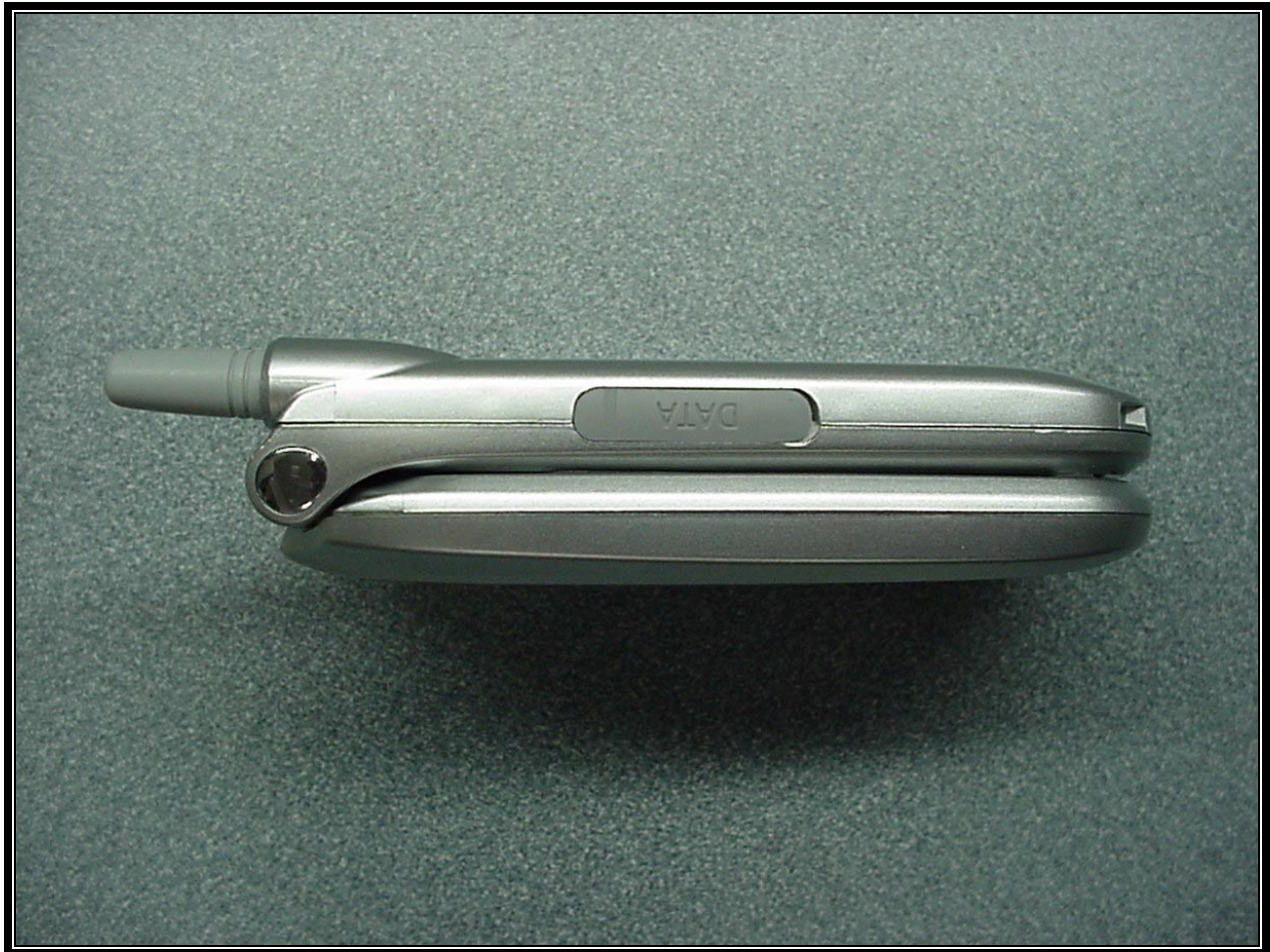
PHOTOGRAPH 11: RIGHT SIDE VIEW