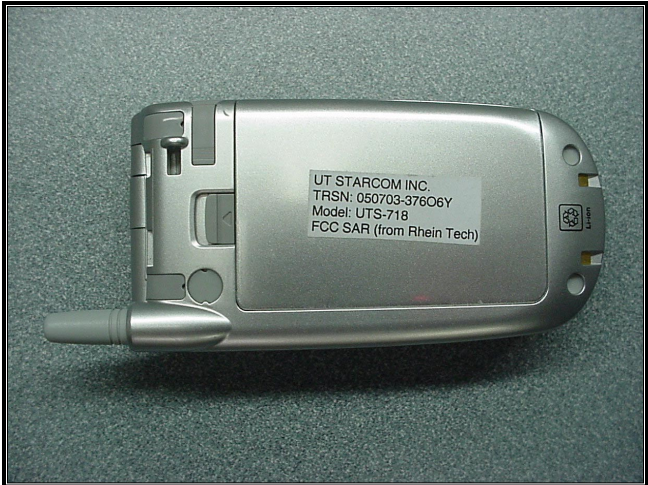
PHOTOGRAPH 9: BACK VIEW