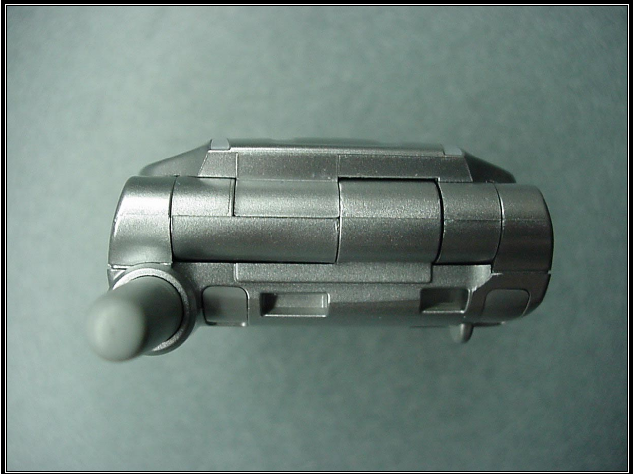
PHOTOGRAPH 12: TOP VIEW