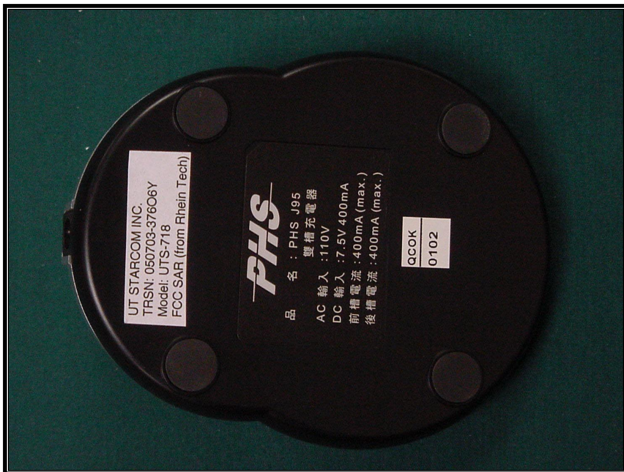
PHOTOGRAPH 17: CHARGER BACK VIEW