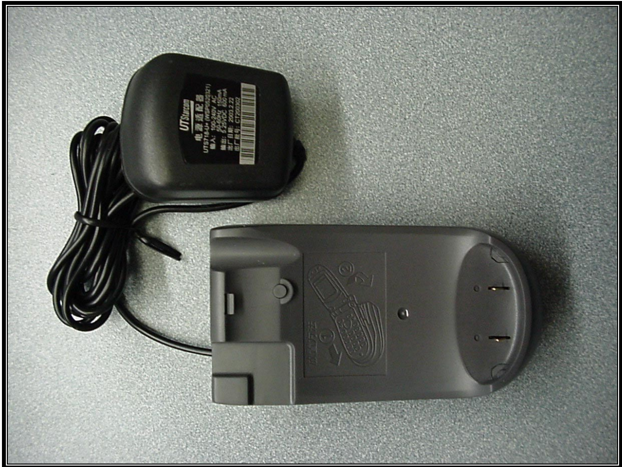
PHOTOGRAPH 20: SMALL BATTERY CHARGER TOP VIEW