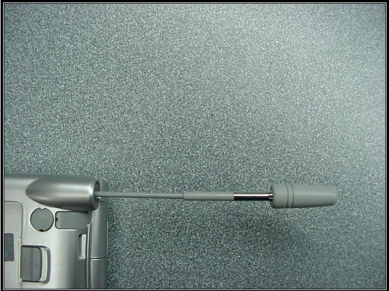
PHOTOGRAPH 14: ANTENNA EXTENDED