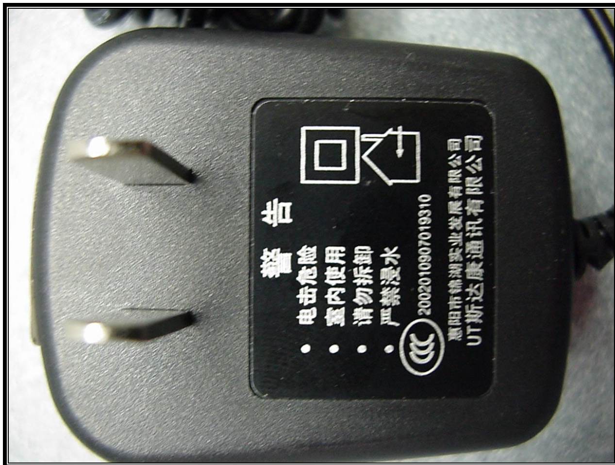
PHOTOGRAPH 23: SMALL BATTERY CHARGER AC/DC UNIT BACK VIEW