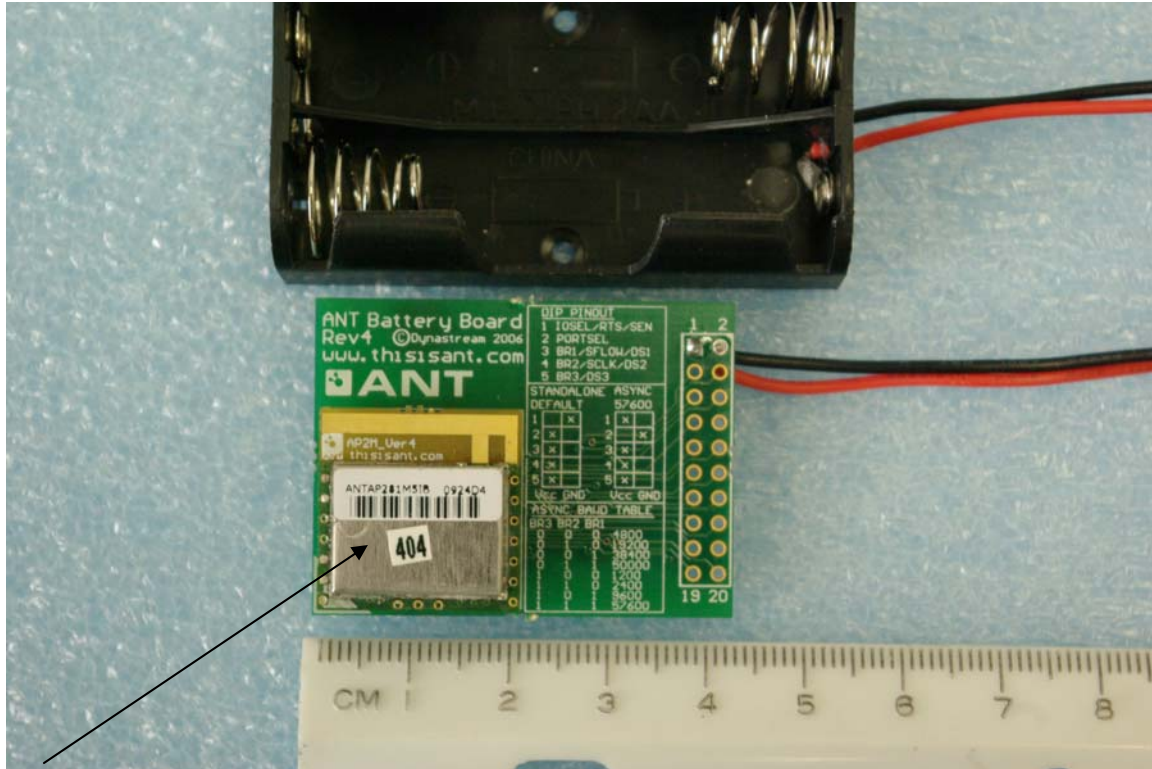
EUT mounted on test development support board (top)