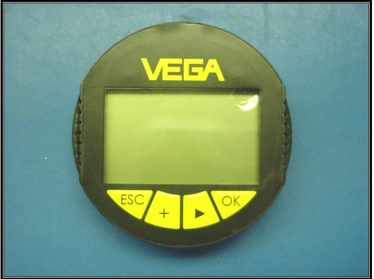
PHOTOGRAPH 18: EUT LCD DISPLAY TOP VIEW