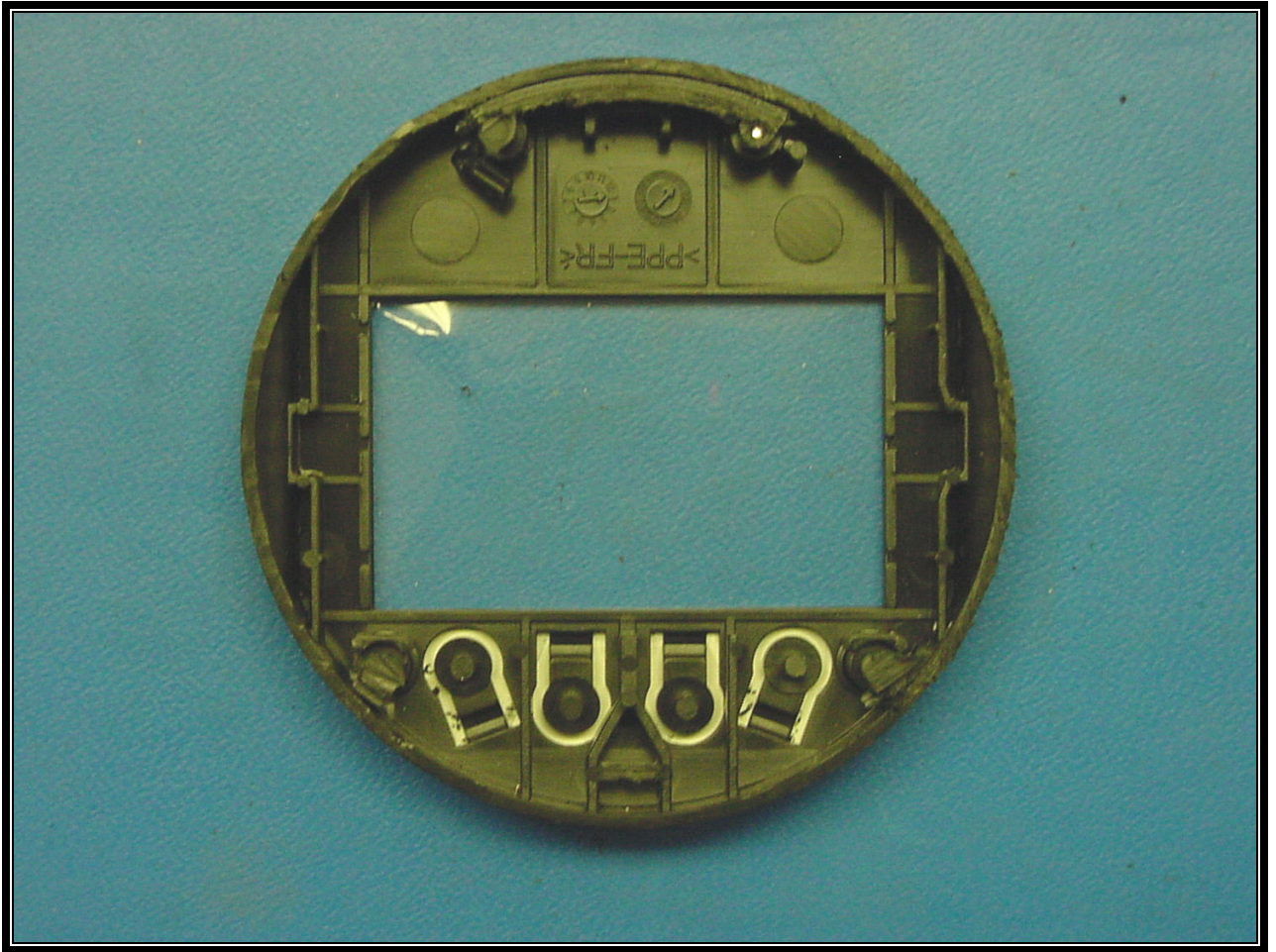
PHOTOGRAPH 20: EUT LCD DISPLAY INSIDE VIEW