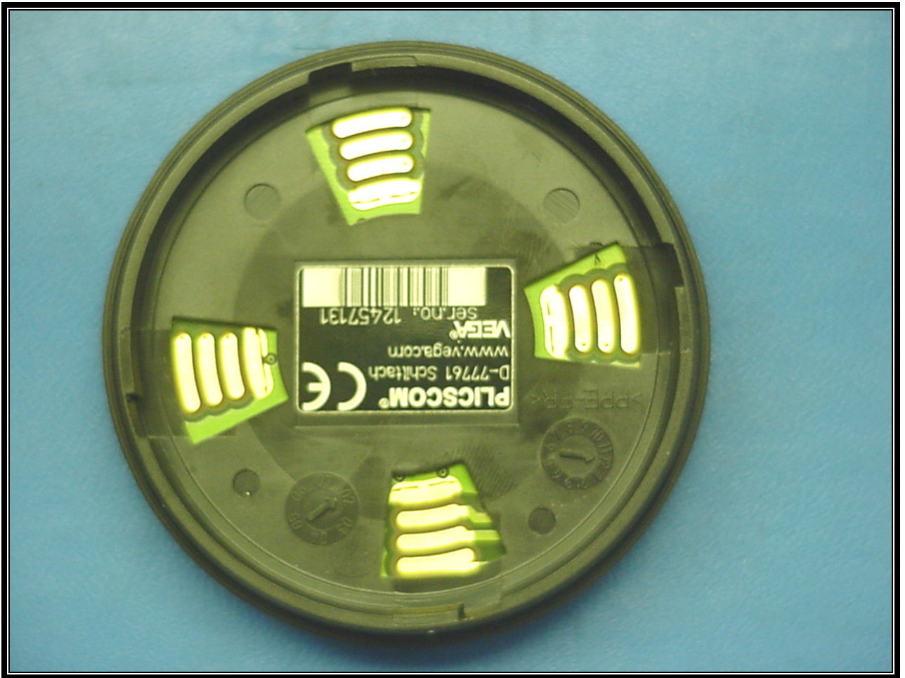
PHOTOGRAPH 19: EUT LCD DISPLAY BOTTOM VIEW