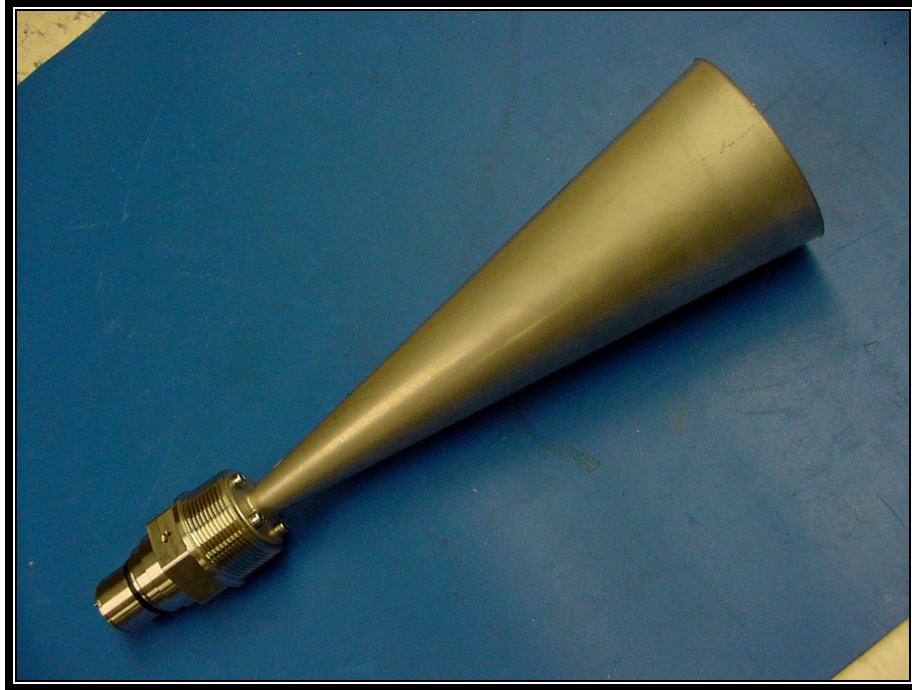
Photograph 35: 24.7 dBi Horn Antenna