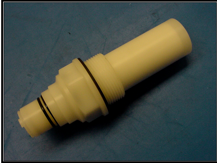
Photograph 33: 19.5 dBi Rod Antenna