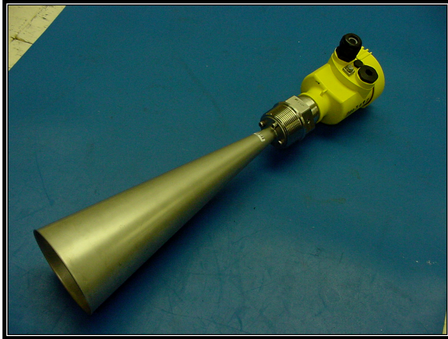
Photograph 34: EUT with 24.7 dBi Horn Antenna