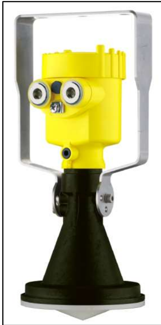
EUT Swivel Holder, In-Tank Installation