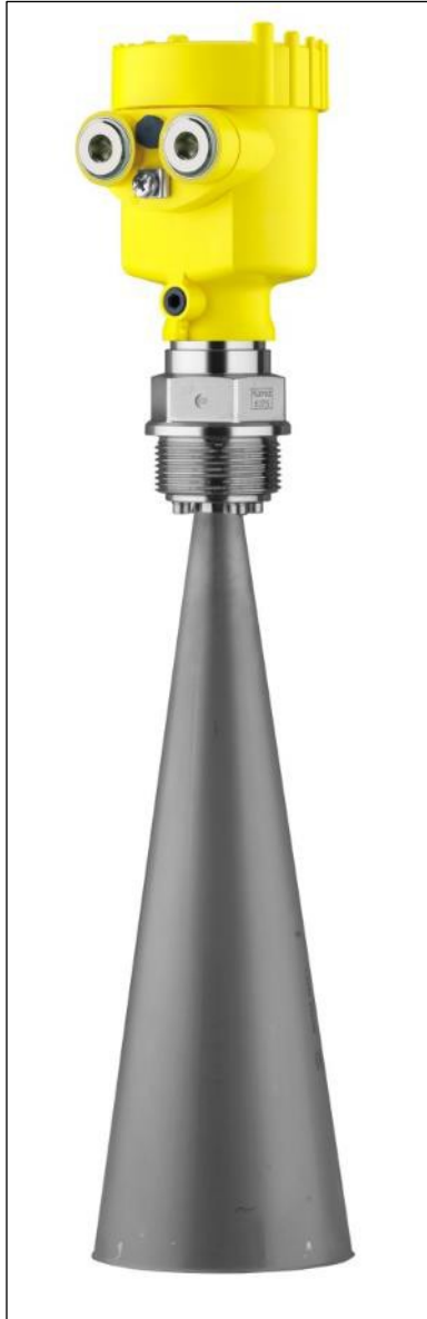
Photograph 5: PS60K with 95mm Horn Antenna