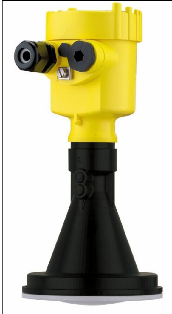
Photograph 1: PS60K with 75mm Plastic Horn Antenna