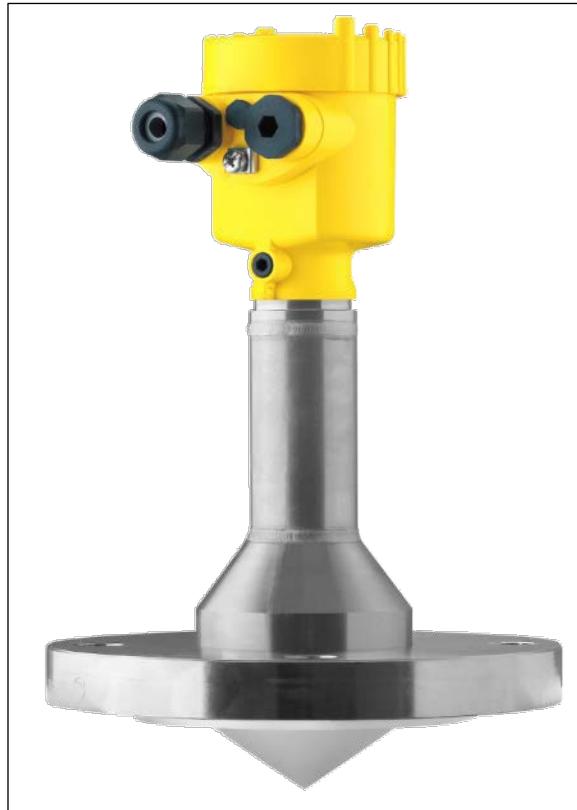
Photograph 9: PS60K with 75mm Filled Horn Antenna