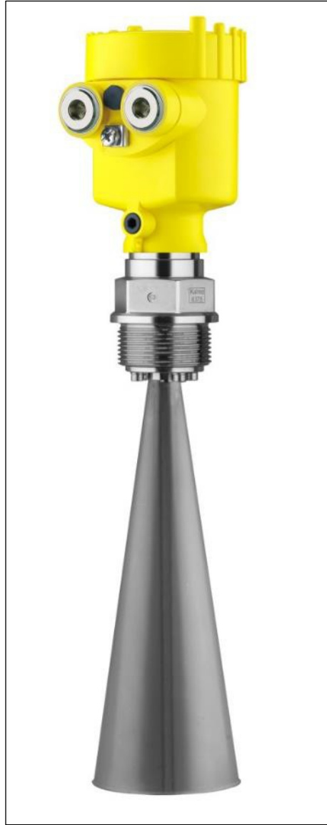
Photograph 4: PS60K with 75mm Horn Antenna