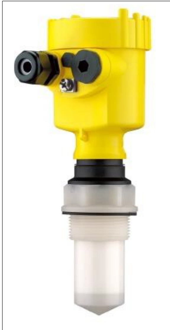
Photograph 8: PS60K with 40mm Encapsulated Horn Antenna