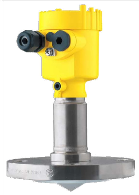
Photograph 7: PS60K with 48mm Filled Horn Antenna