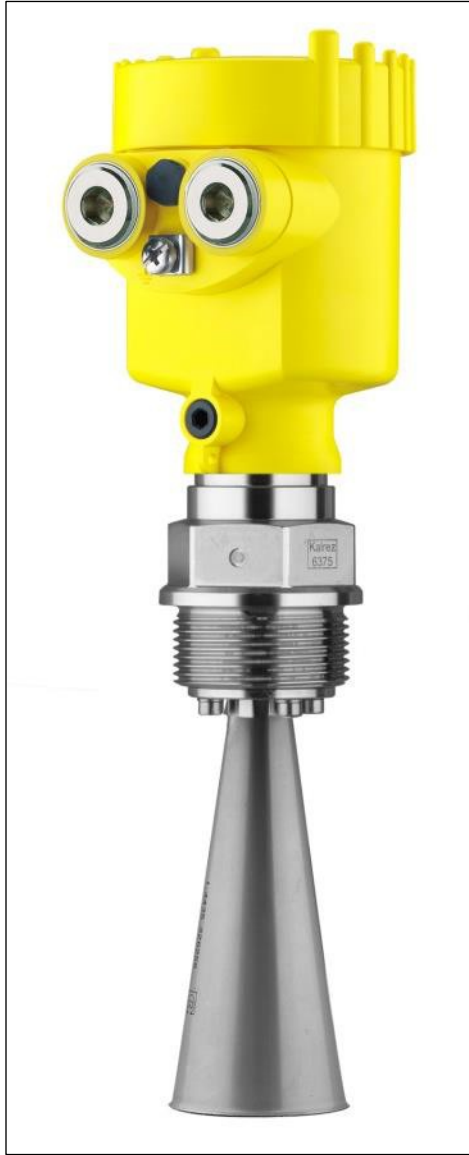
Photograph 3: PS60K with 48mm Horn Antenna