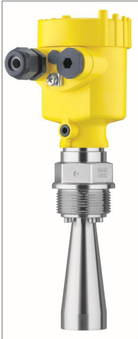
Photograph 2: PS60K with 40mm Horn Antenna