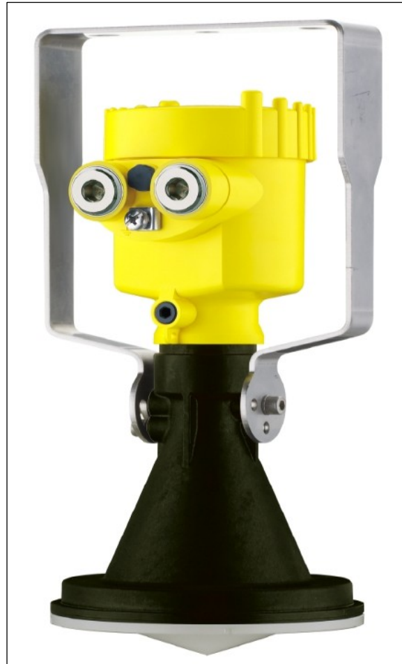
Photograph 10: EUT in Swivel Holder