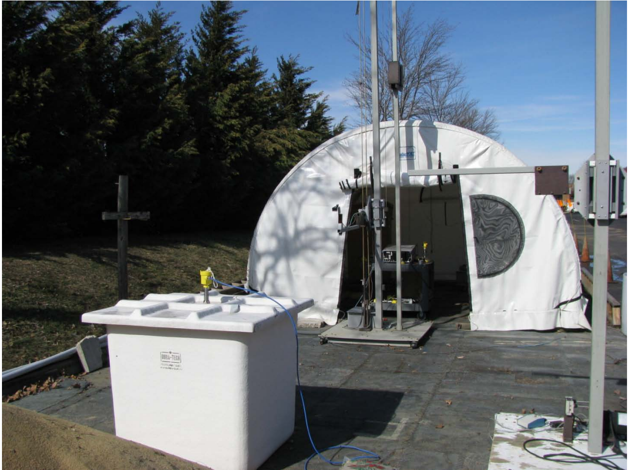
Photograph 36: 245mm Antenna Rear View Fiberglass Tank