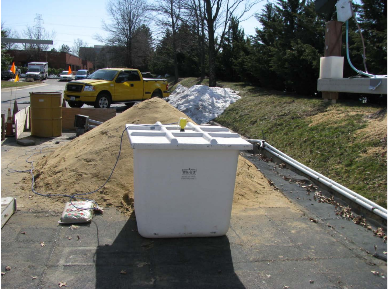
Photograph 47: 1/2" Stub Antenna Front View Fiberglass Tank