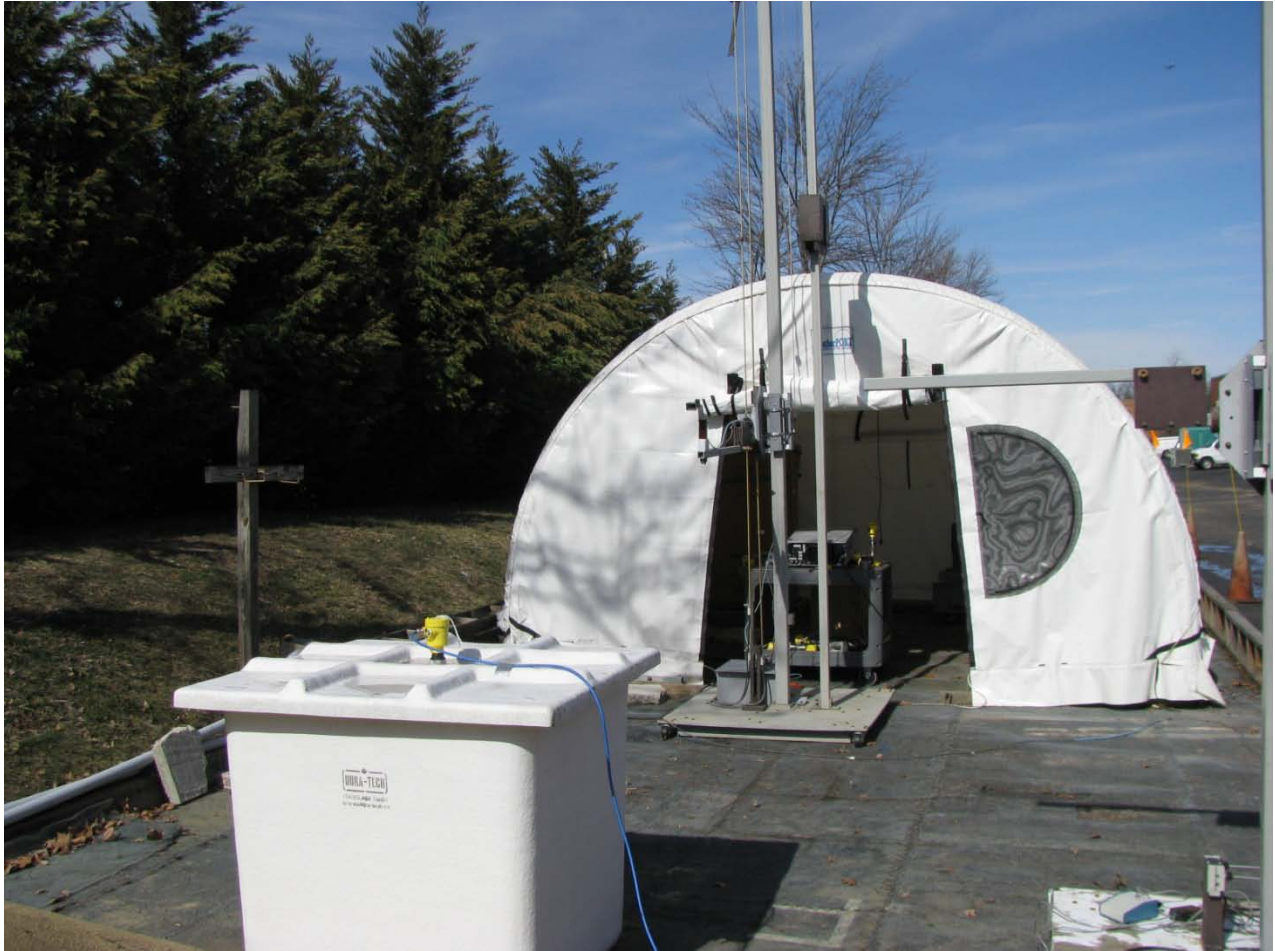
Photograph 48: ½" Stub Antenna Rear View Fiberglass Tank