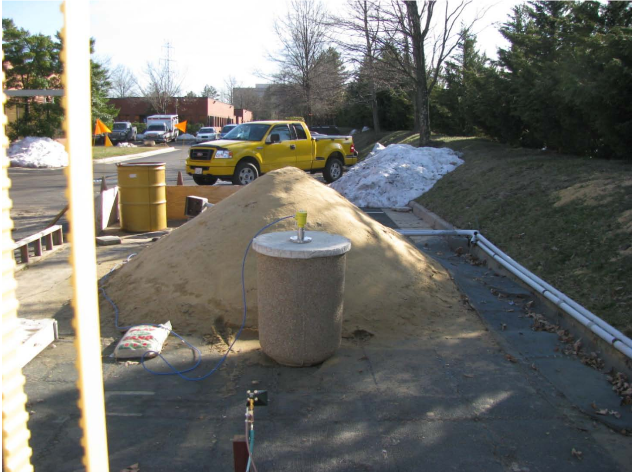
Photograph 27: 48mm Metal Antenna Front View Concrete Tank