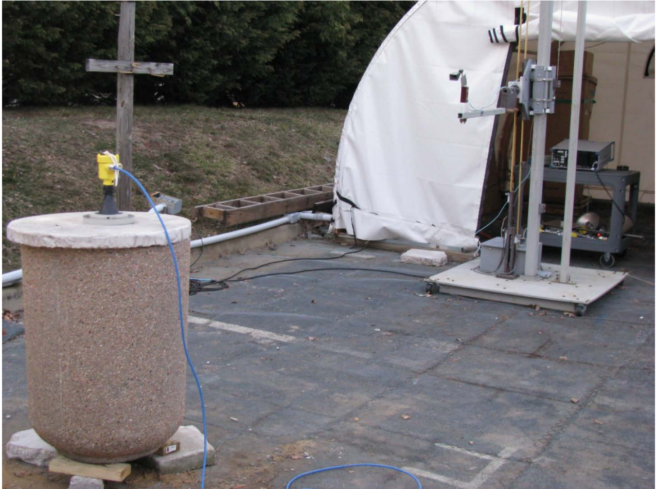
Photograph 30: 80mm Plastic Antenna Rear View Concrete Tank