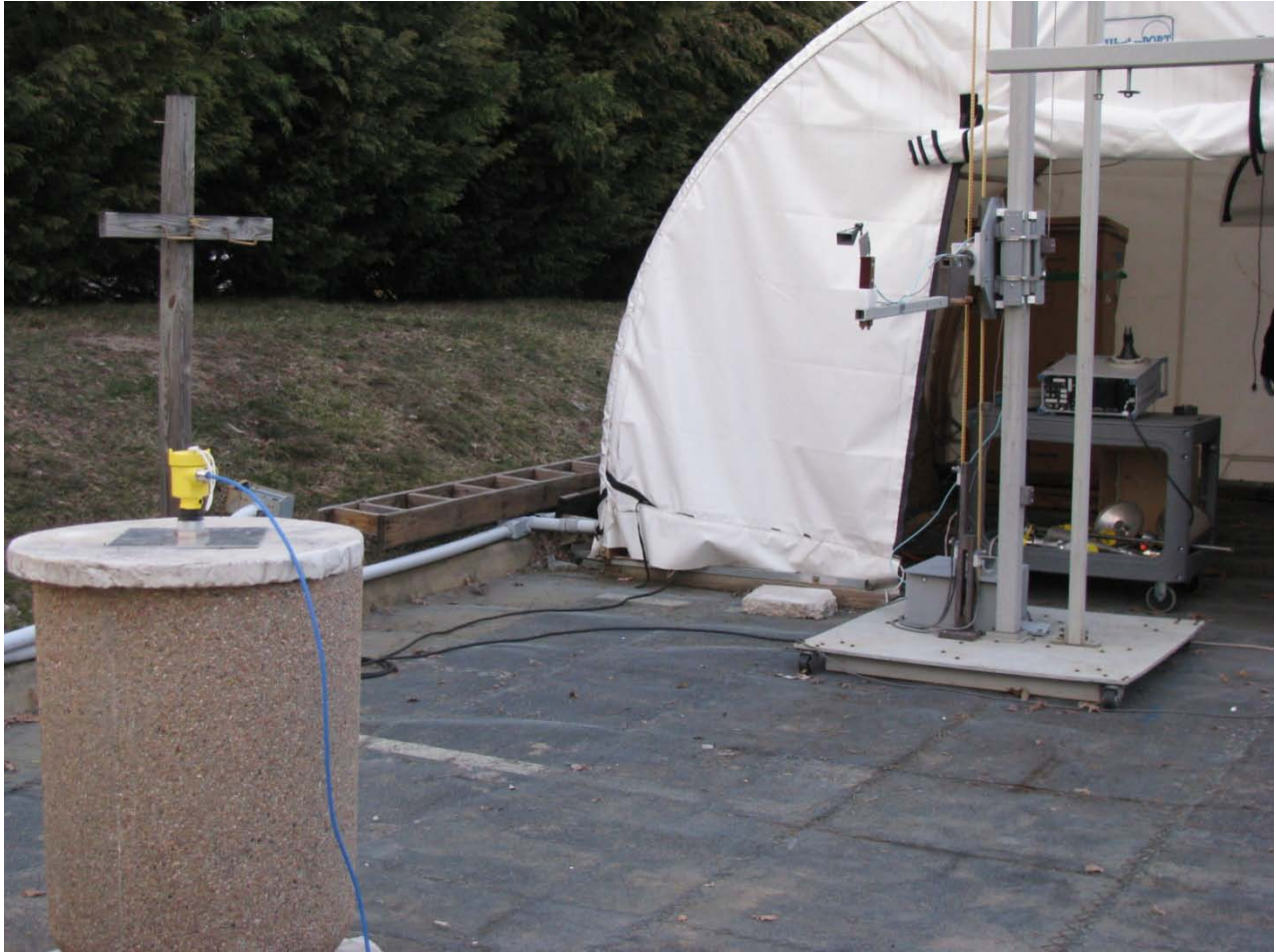
Photograph 32: 1/2" Stub Antenna Rear View Concrete Tank