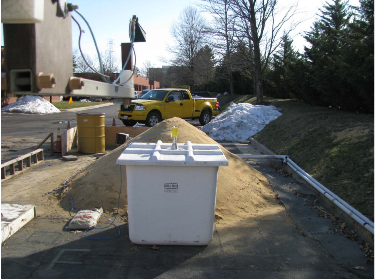
Photograph 41: 75mm Metal Antenna Front View Fiberglass Tank