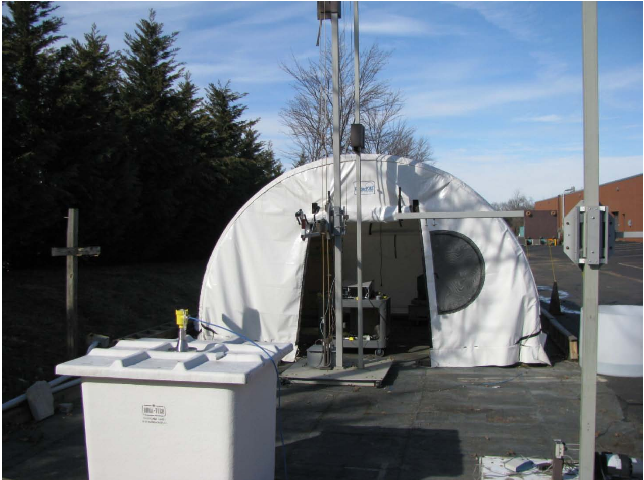
Photograph 42: 75mm Metal Antenna Rear View Fiberglass Tank