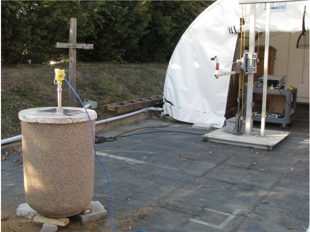
Photograph 33: 1/2" Standpipe Antenna Front View Concrete Tank