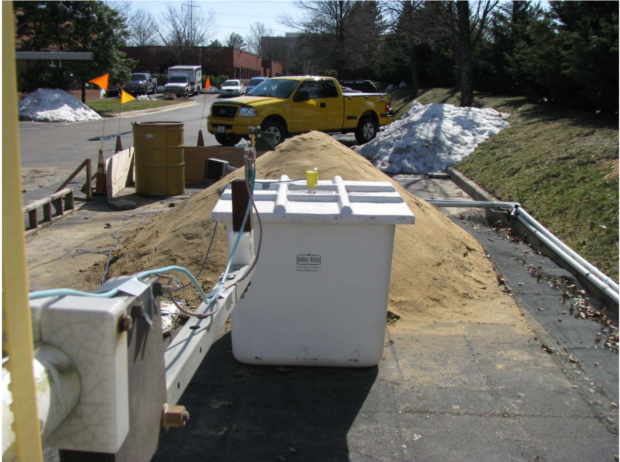
Photograph 39: 40mm Antenna Front View Fiberglass Tank