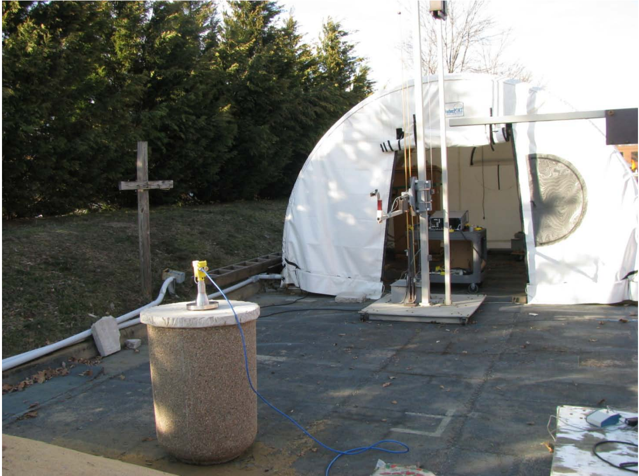
Photograph 26: 75mm Metal Antenna Rear View Concrete Tank