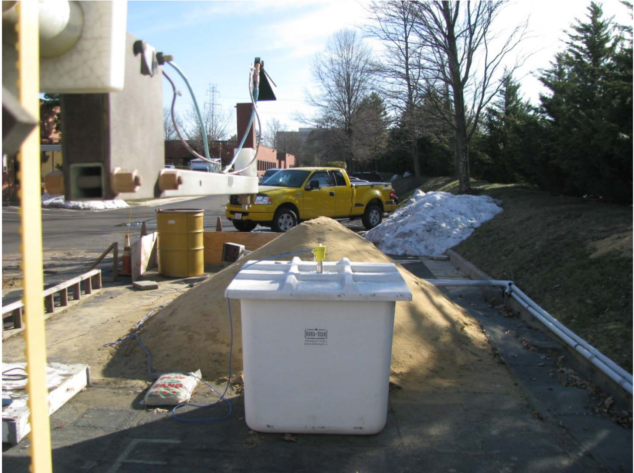
Photograph 43: 48mm Metal Antenna Front View Fiberglass Tank