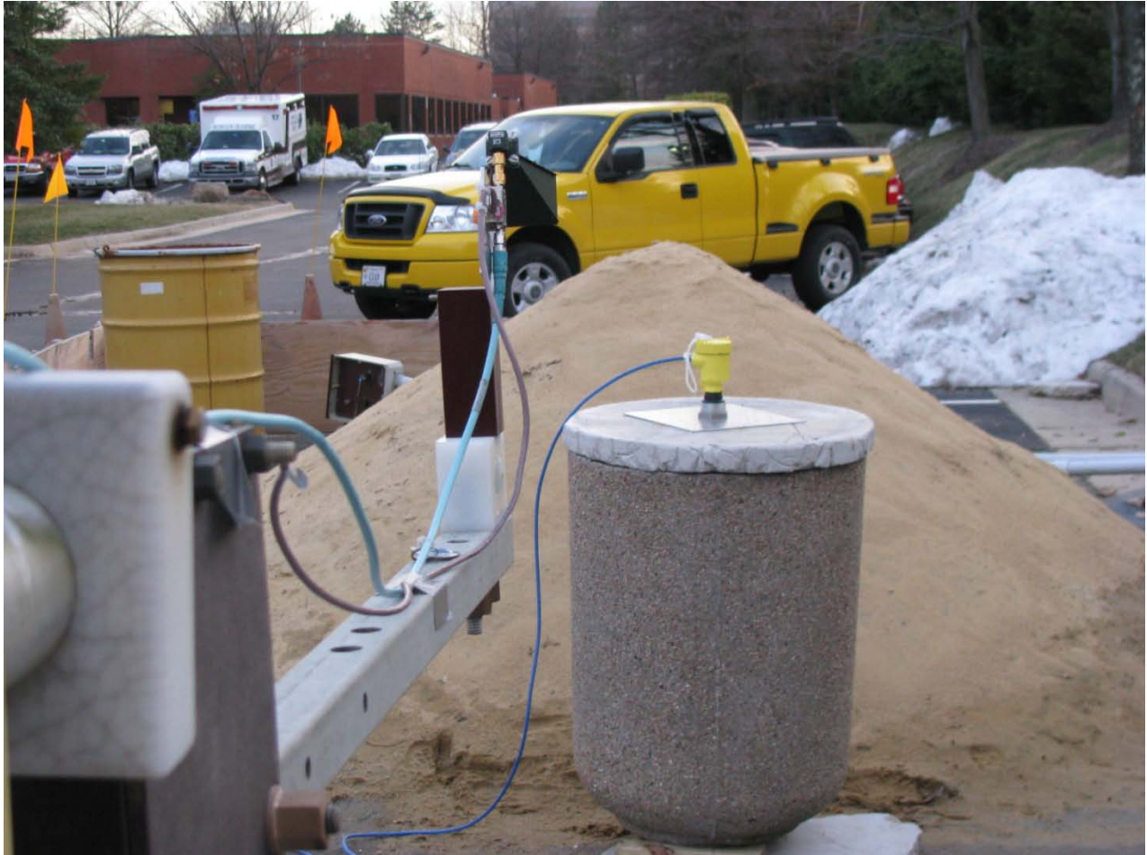
Photograph 31: 1/2" Stub Antenna Front View Concrete Tank