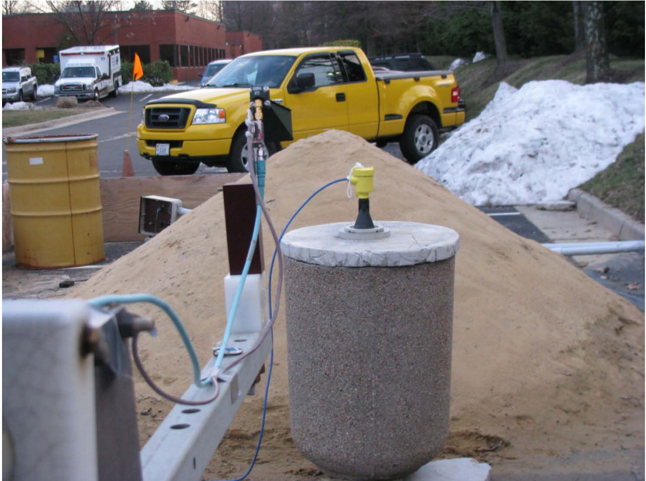
Photograph 29: 80mm Plastic Antenna Front View Concrete Tank