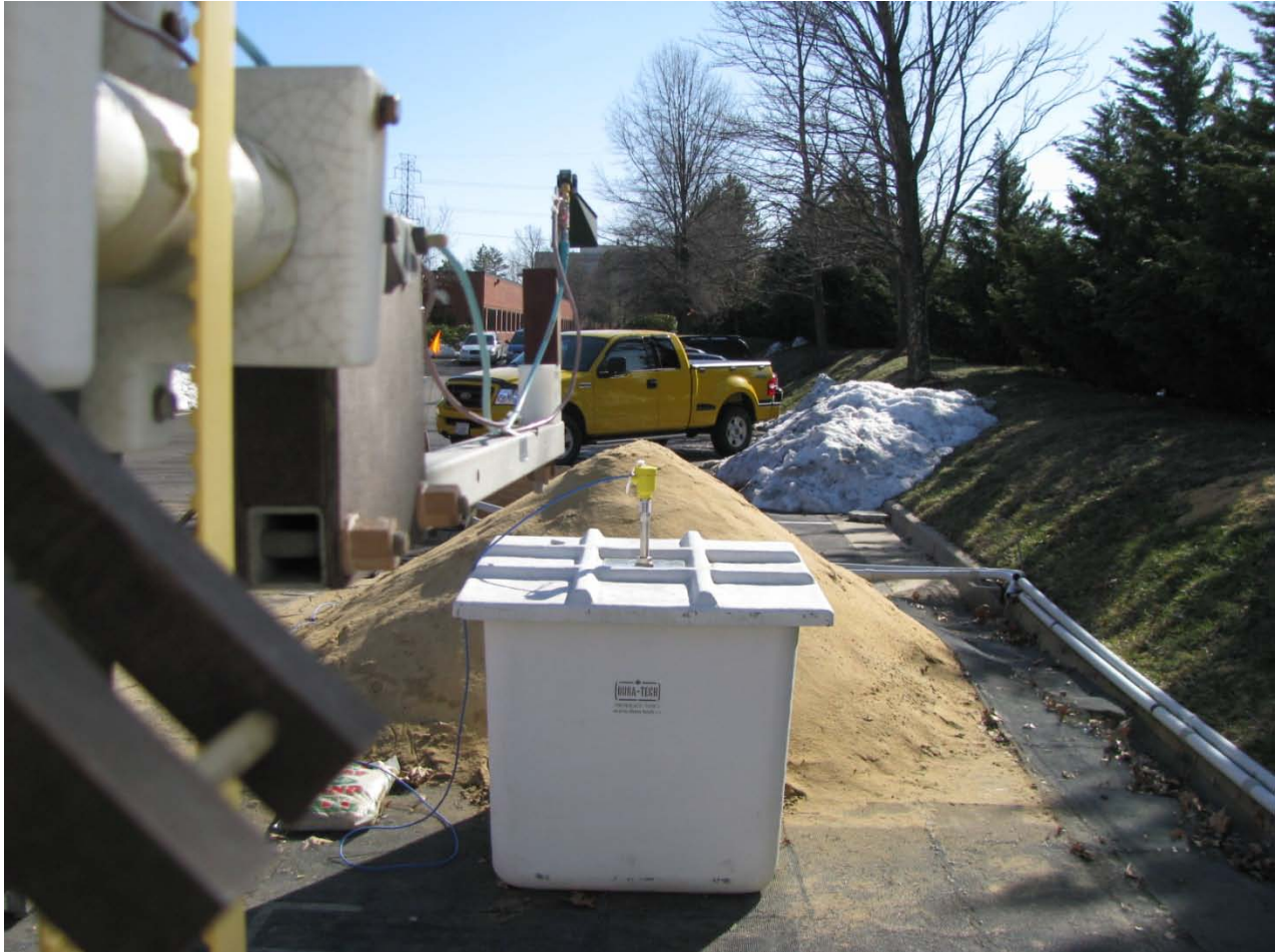
Photograph 37: 95mm Antenna Front View Fiberglass Tank