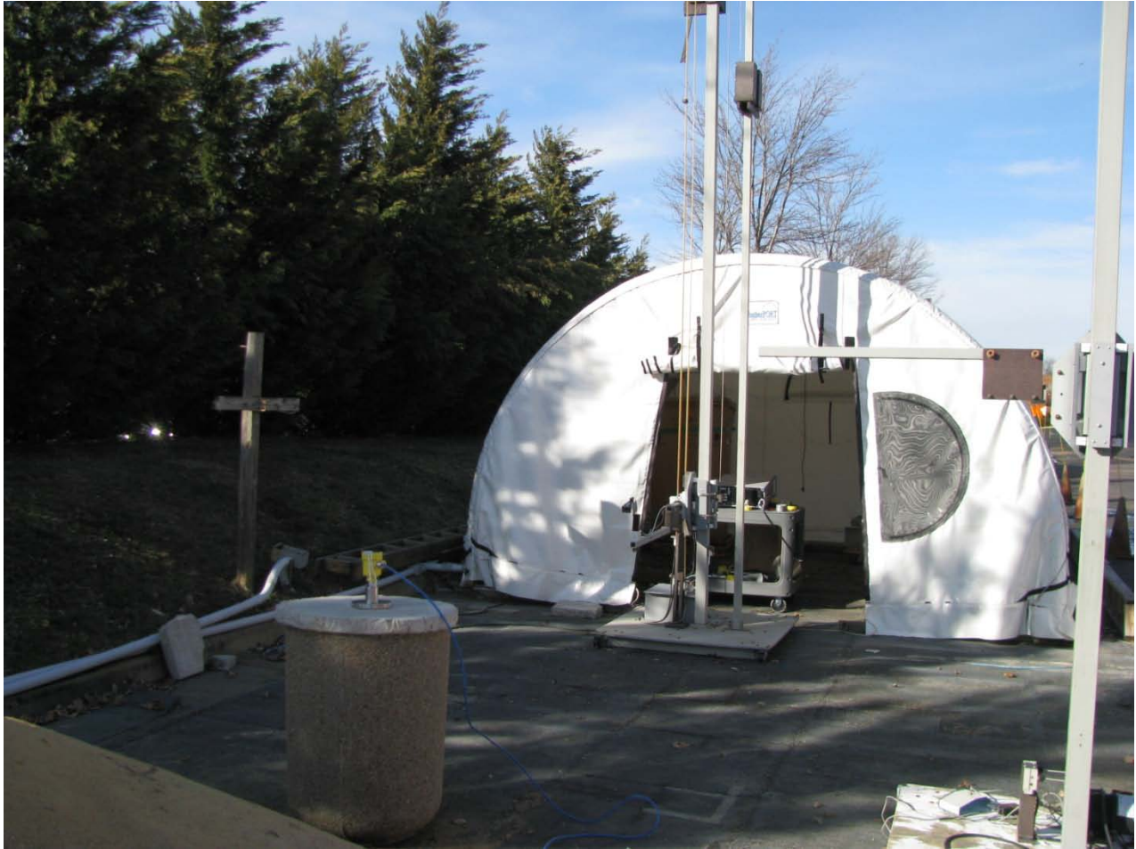
Photograph 28: 48mm Metal Antenna Rear View Concrete Tank