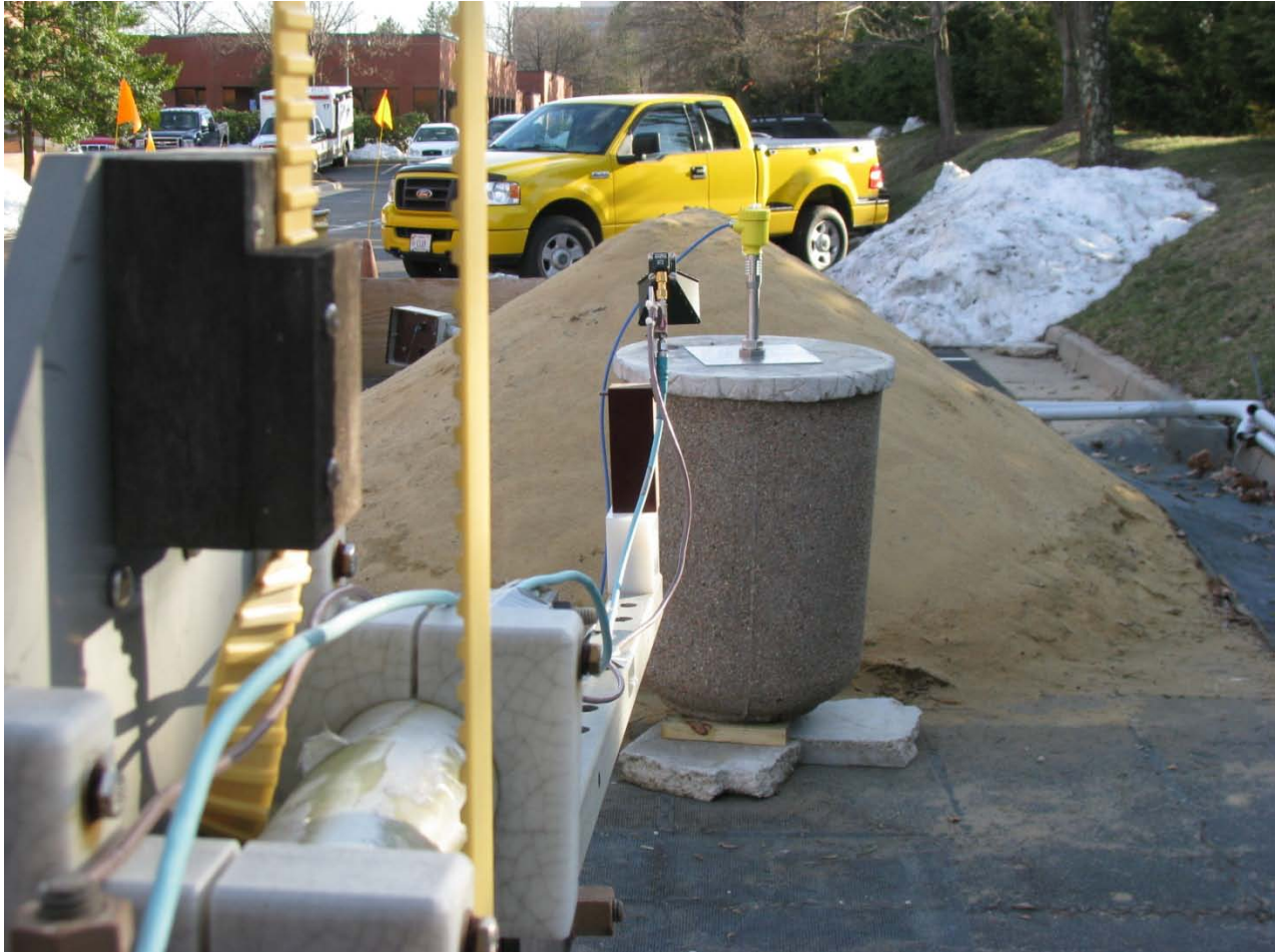
Photograph 34: ½" Standpipe Antenna Rear View Concrete Tank