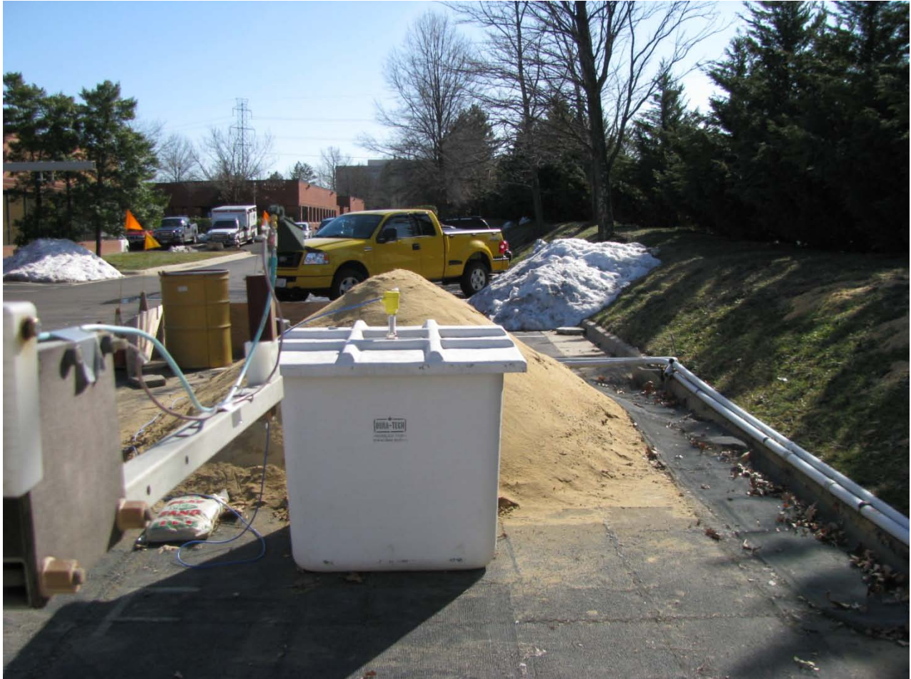
Photograph 49: 1/2" Standpipe Antenna Front View Fiberglass Tank