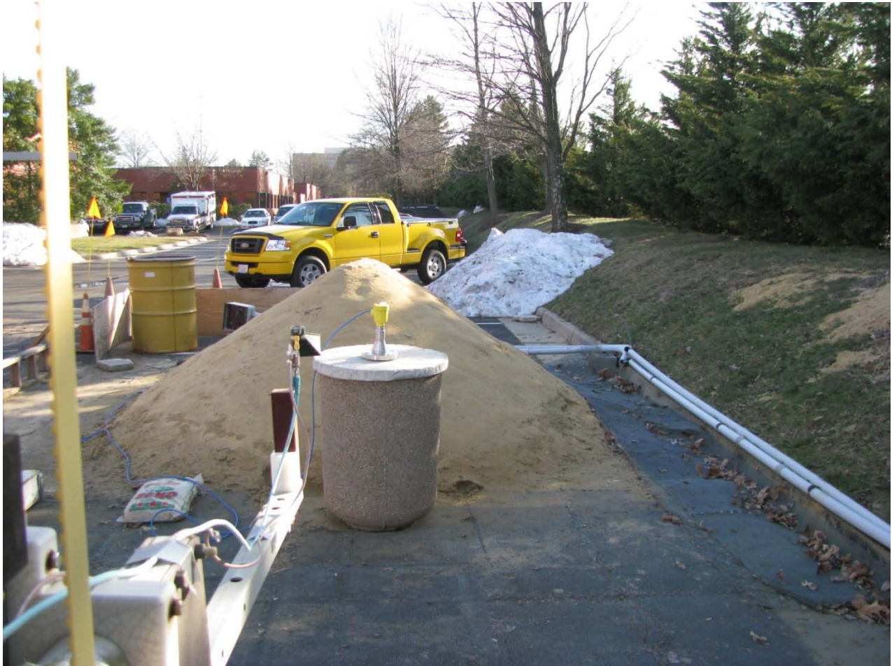
Photograph 25: 75mm Metal Antenna Front View Concrete Tank