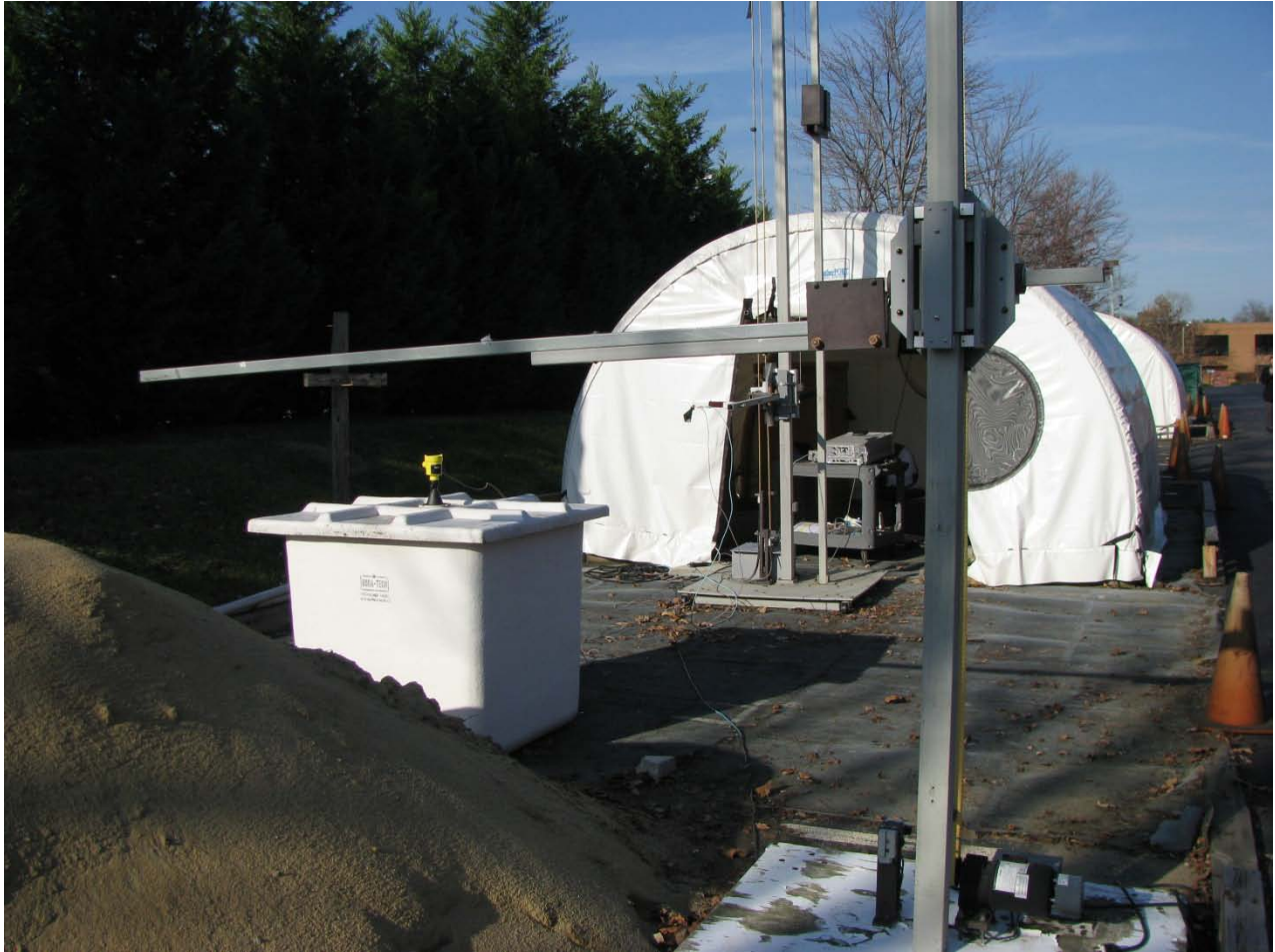
Photograph 46: 80mm Plastic Antenna Rear View Fiberglass Tank