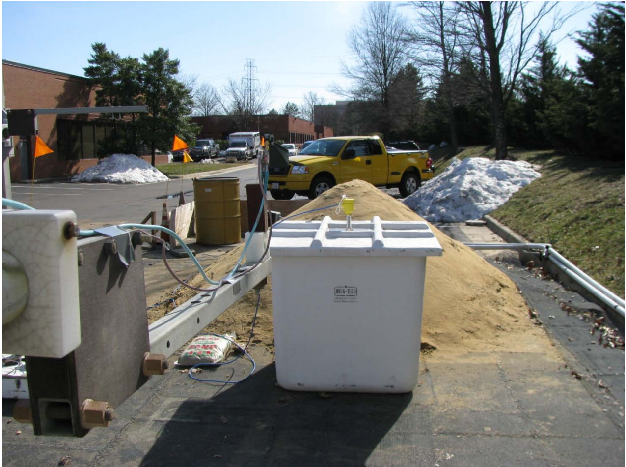
Photograph 35: 245mm Antenna Front View Fiberglass Tank