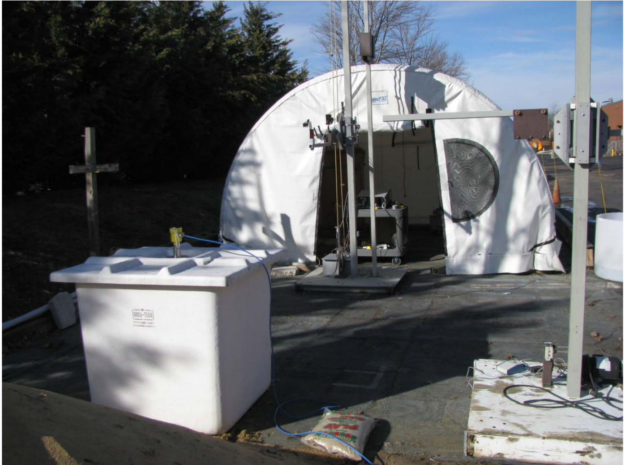
Photograph 44: 48mm Metal Antenna Rear View Fiberglass Tank