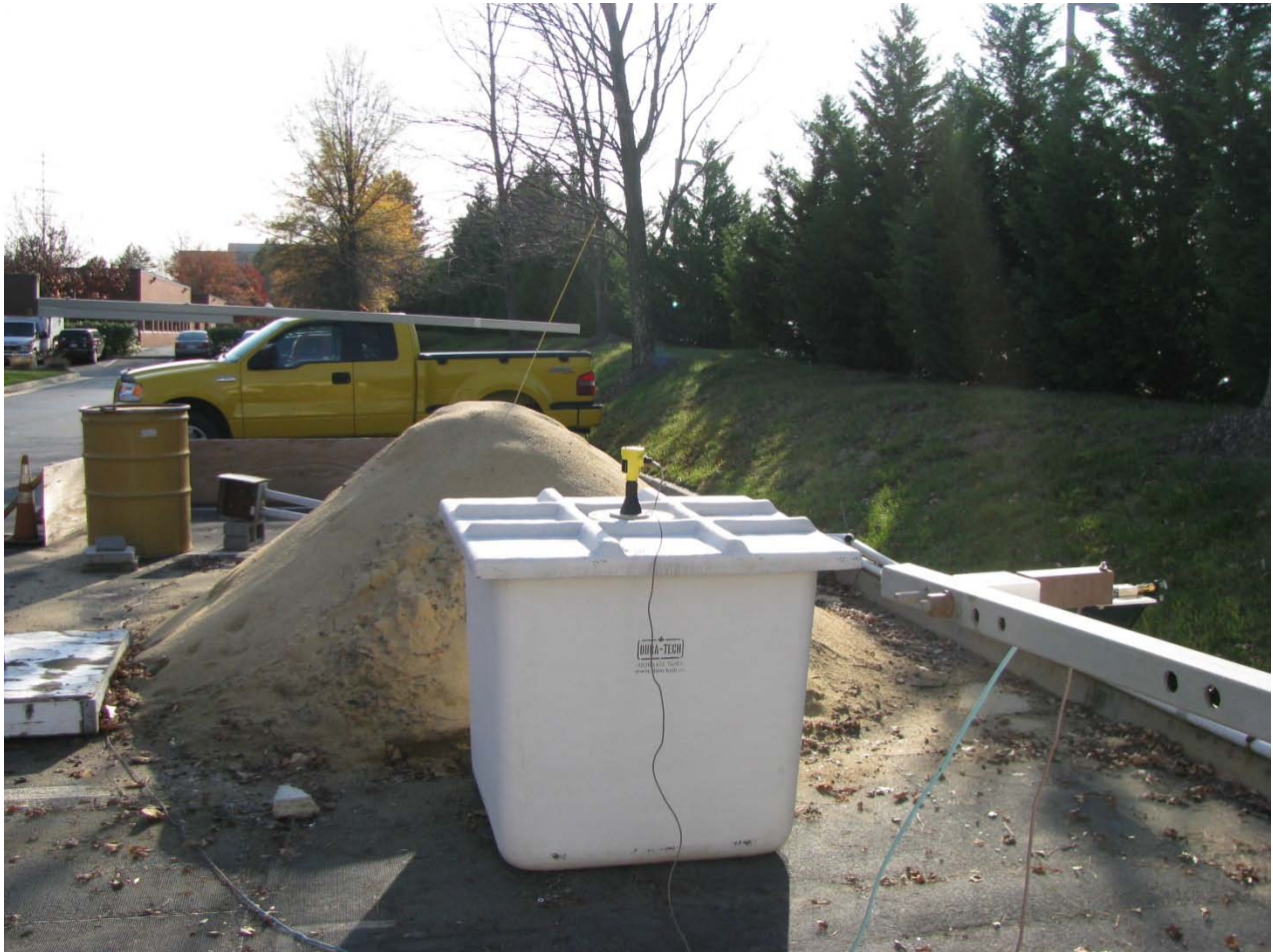
Photograph 45: 80mm Plastic Antenna Front View Fiberglass Tank