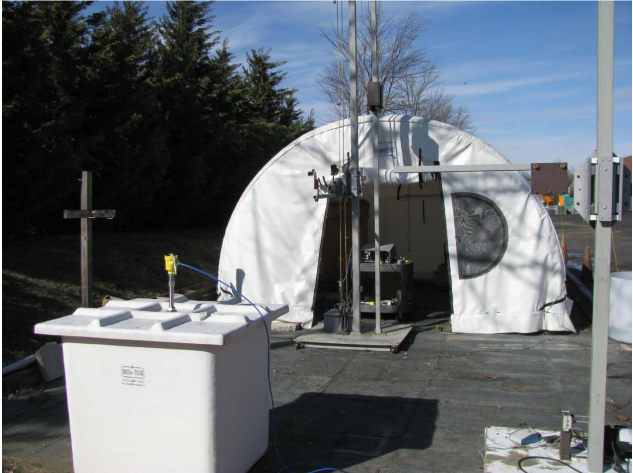
Photograph 38: 95mm Antenna Rear View Fiberglass Tank