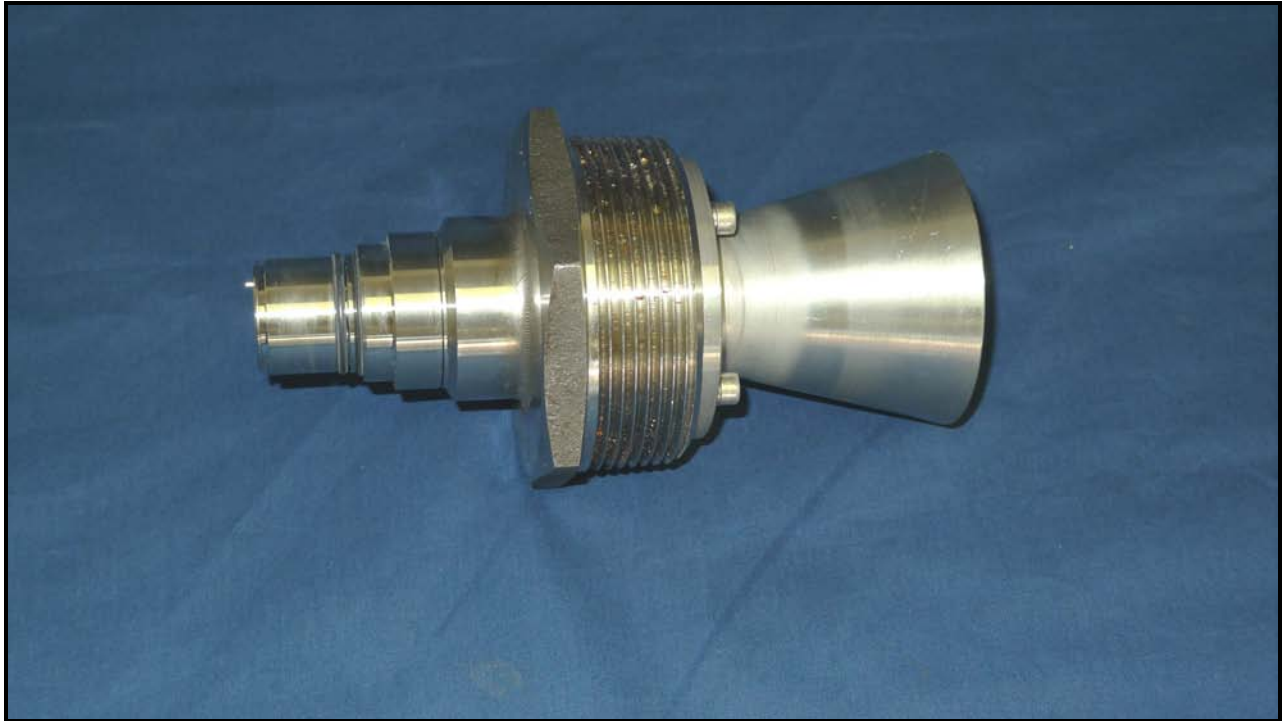
Photograph 2: 4" Horn Antenna