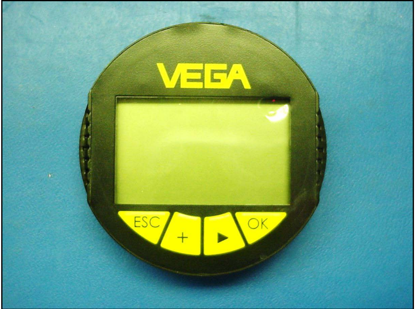
Photograph 17: LCD Display Top View