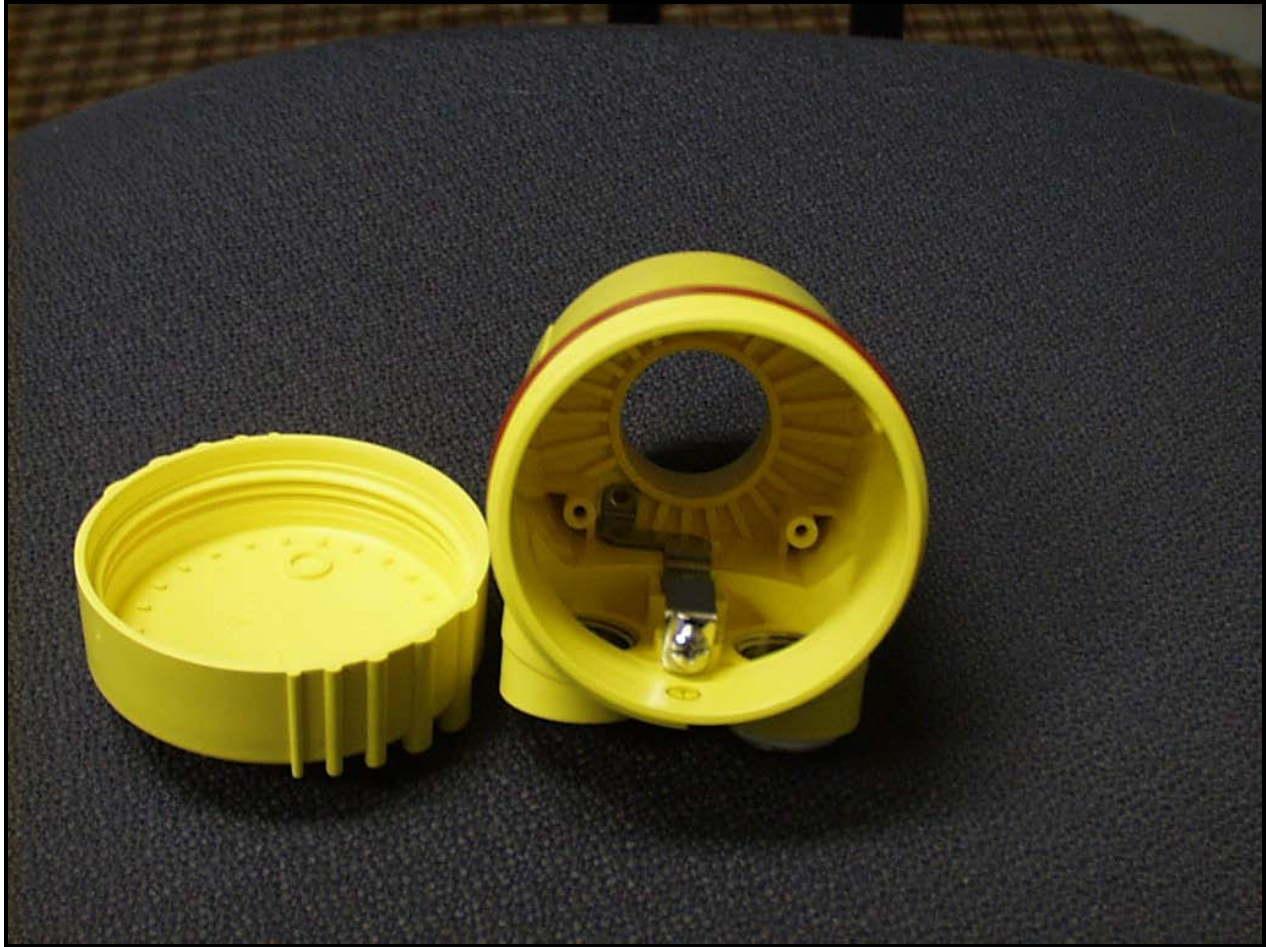
Photograph 7: Plastic Housing inside View