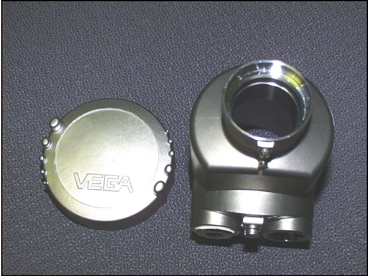
Photograph 14: Stainless Steel Housing Fitting