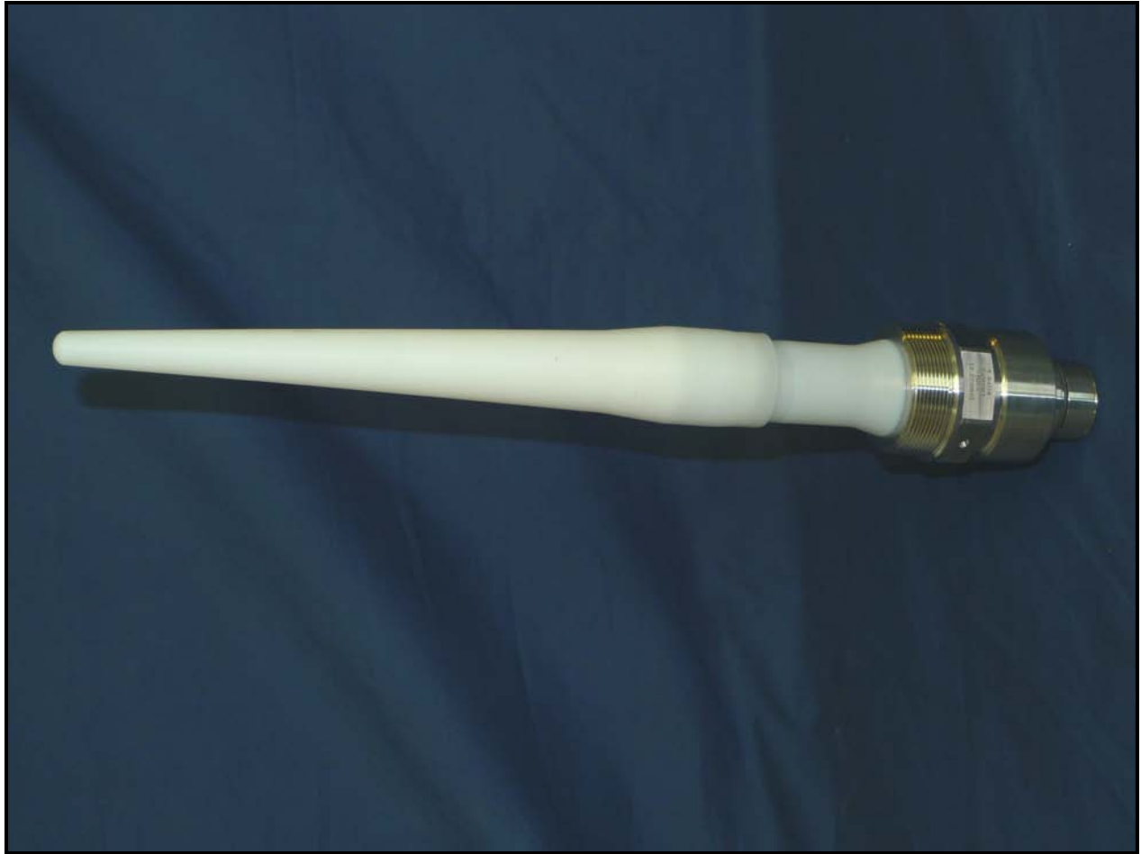
Photograph 3: 250mm Rod Antenna