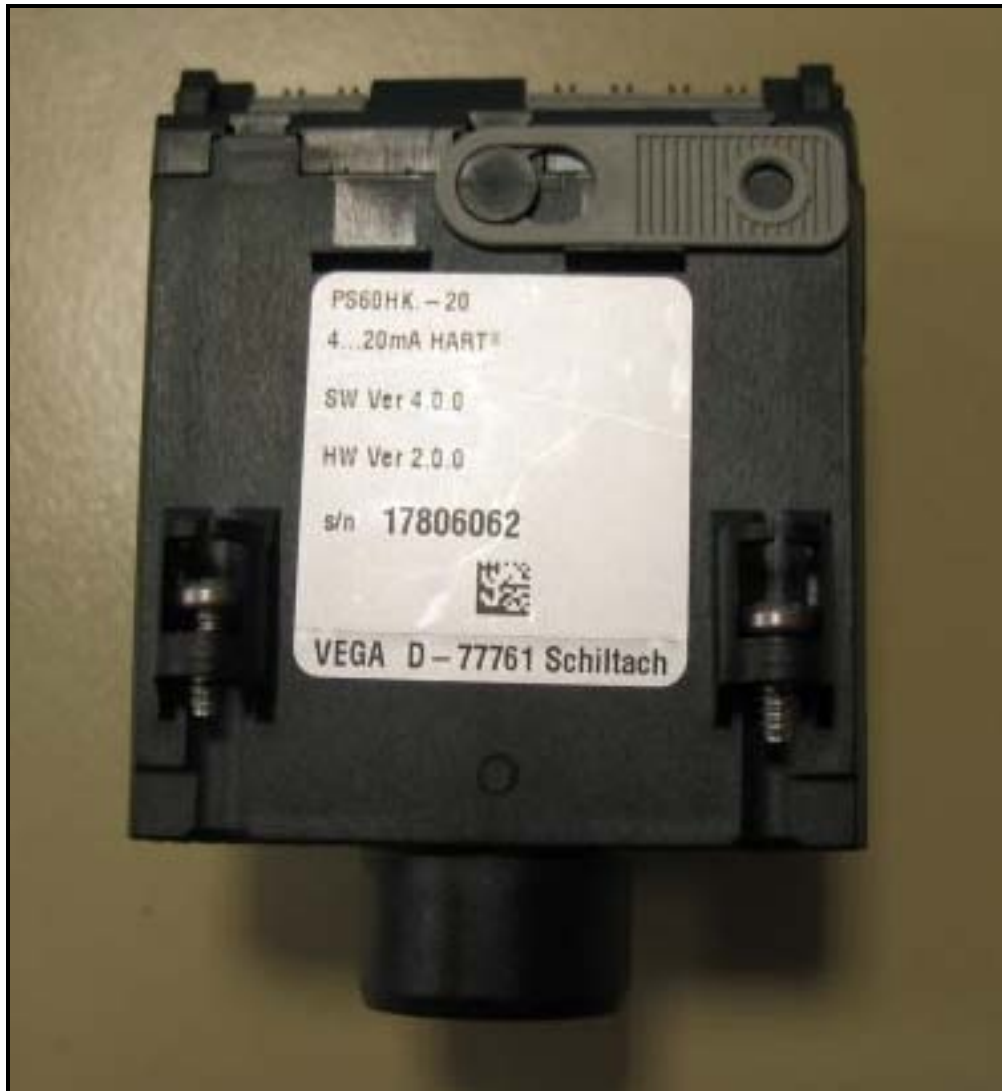
Photograph 19: Electronics Can (Front)