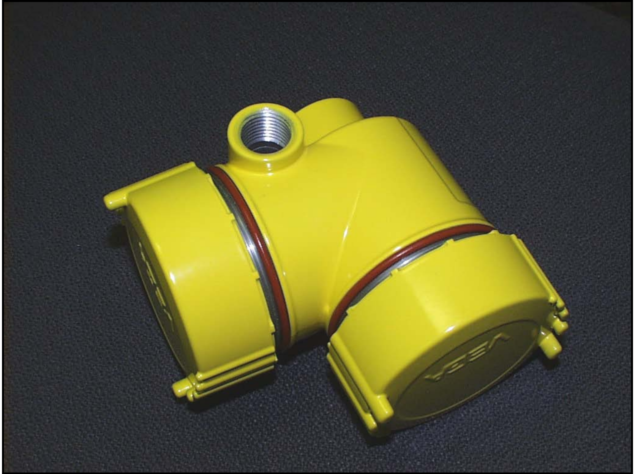
Photograph 11: Double Aluminum Chamber Housing Fitting