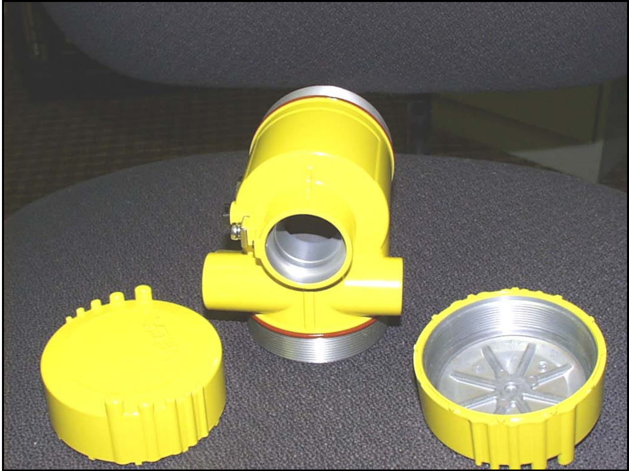
Photograph 13: Double Aluminum Chamber Housing Rear View