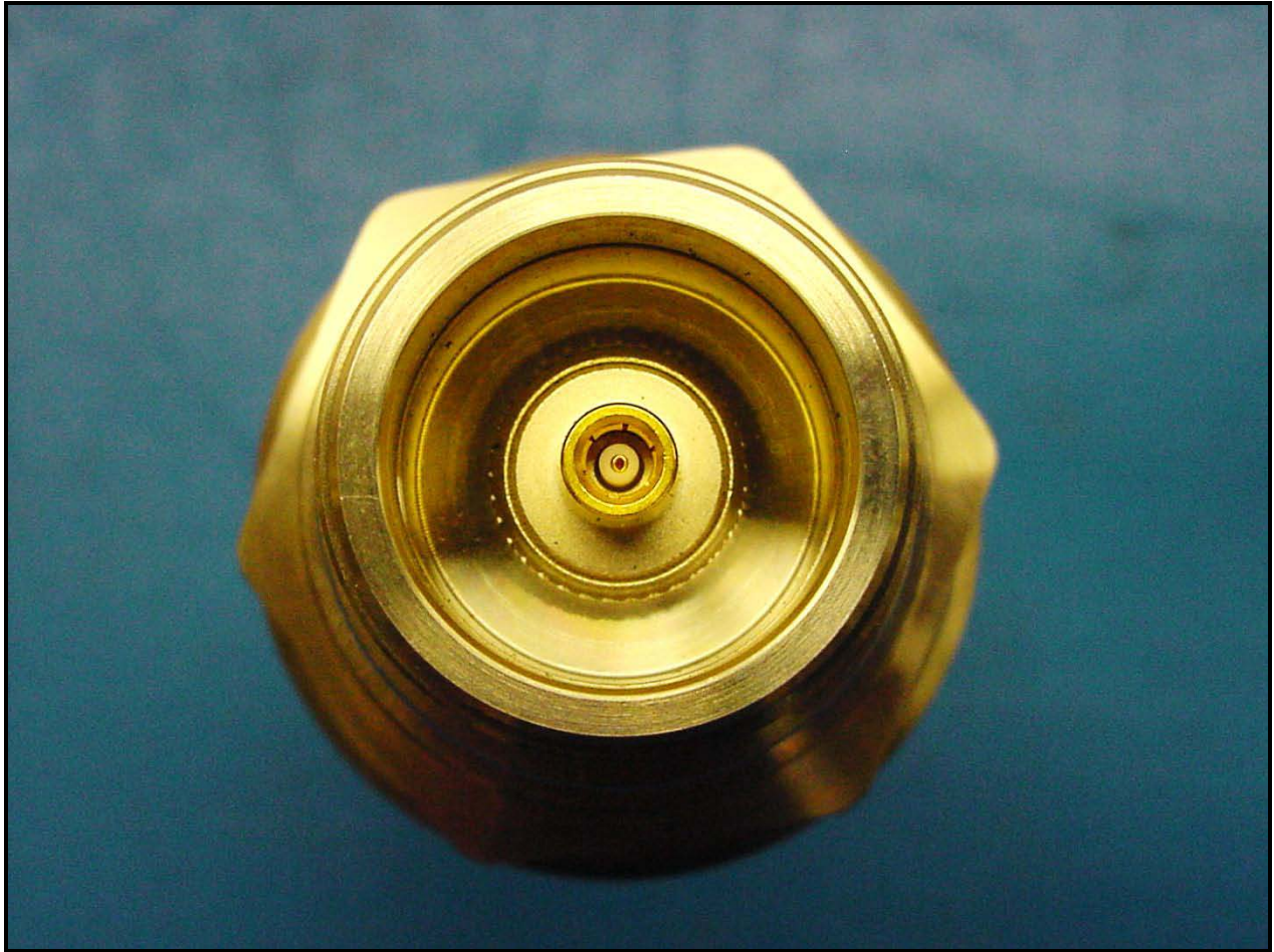
Photograph 5: Antenna Port