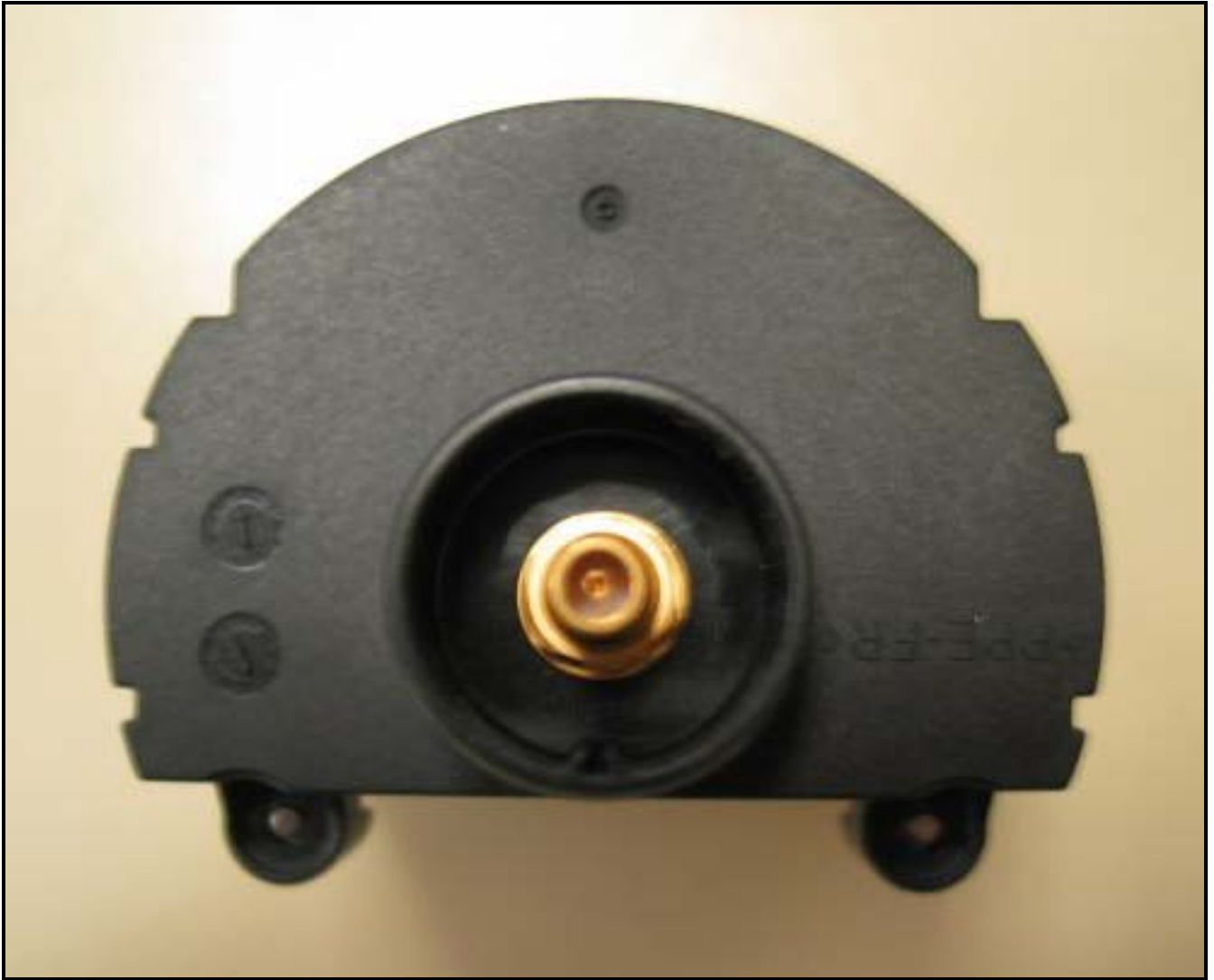
Photograph 21: Electronics Can (Bottom)