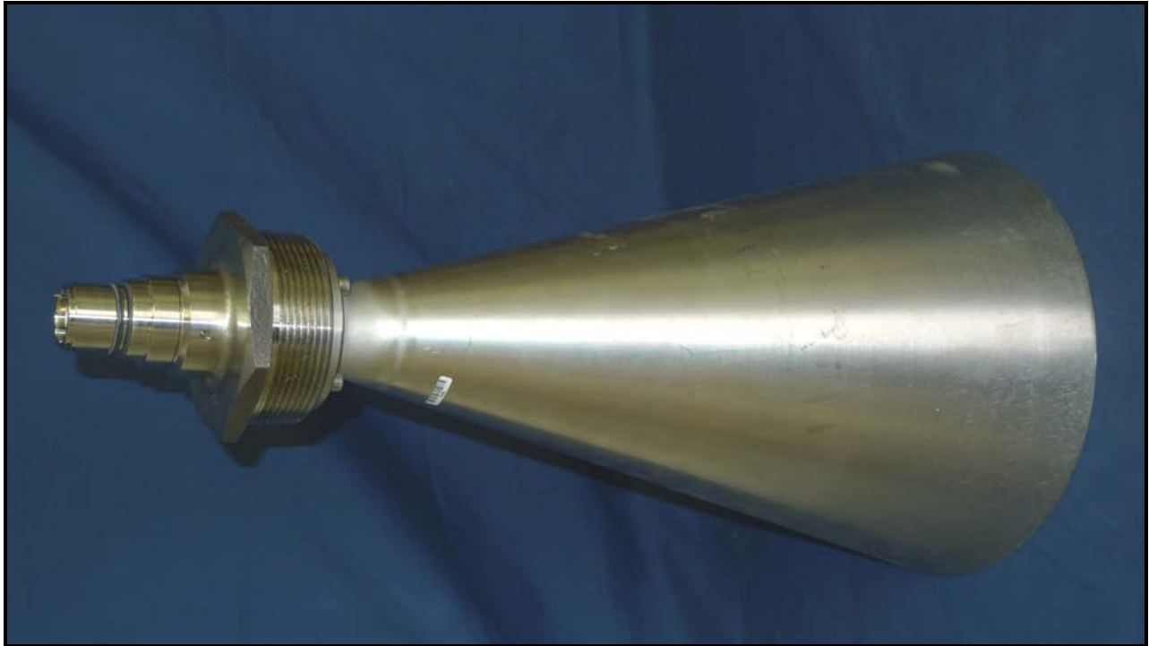
Photograph 1: 10" Horn Antenna