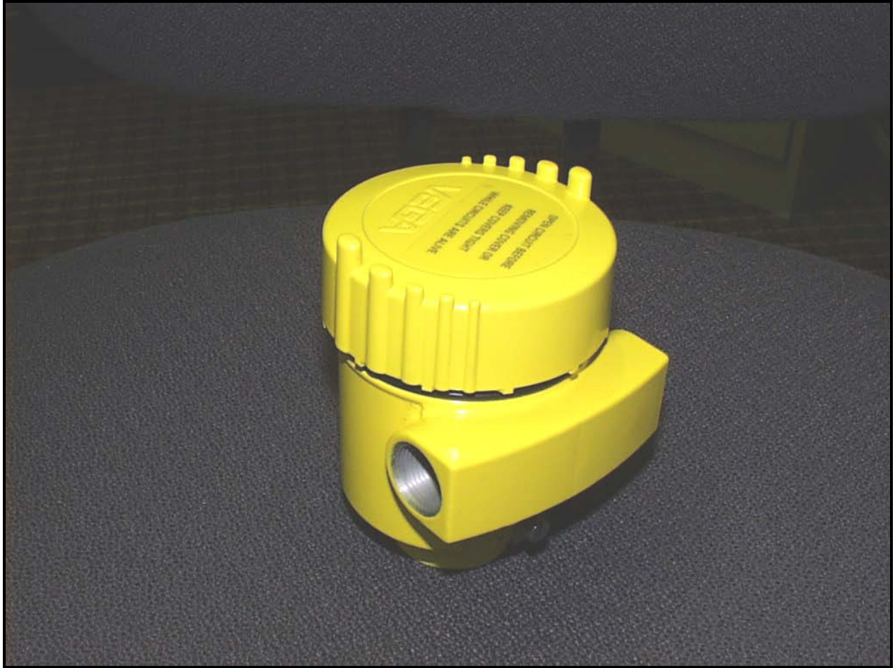
Photograph 10: Aluminum Housing Front View