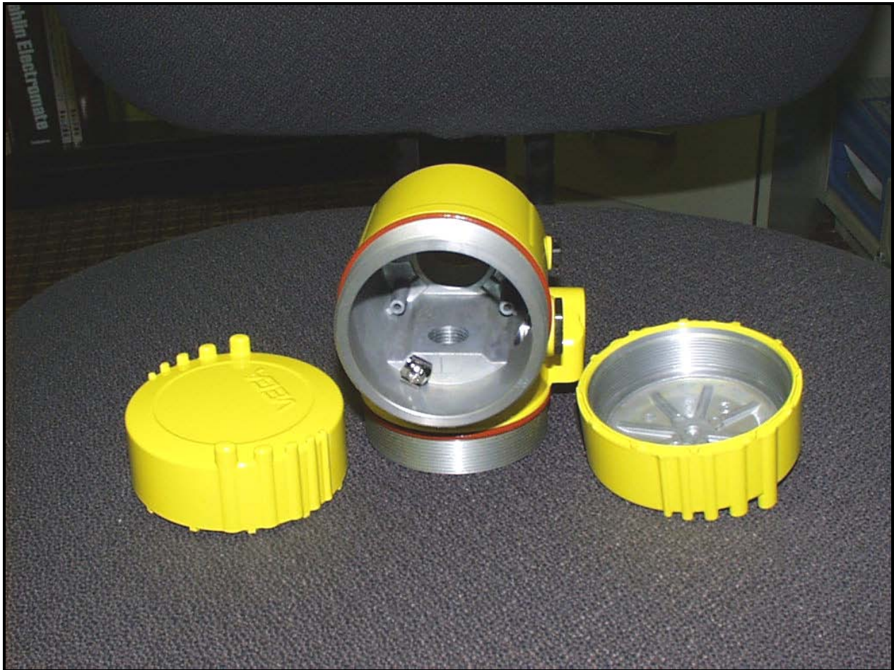
Photograph 12: Double Aluminum Housing Fitting Front View