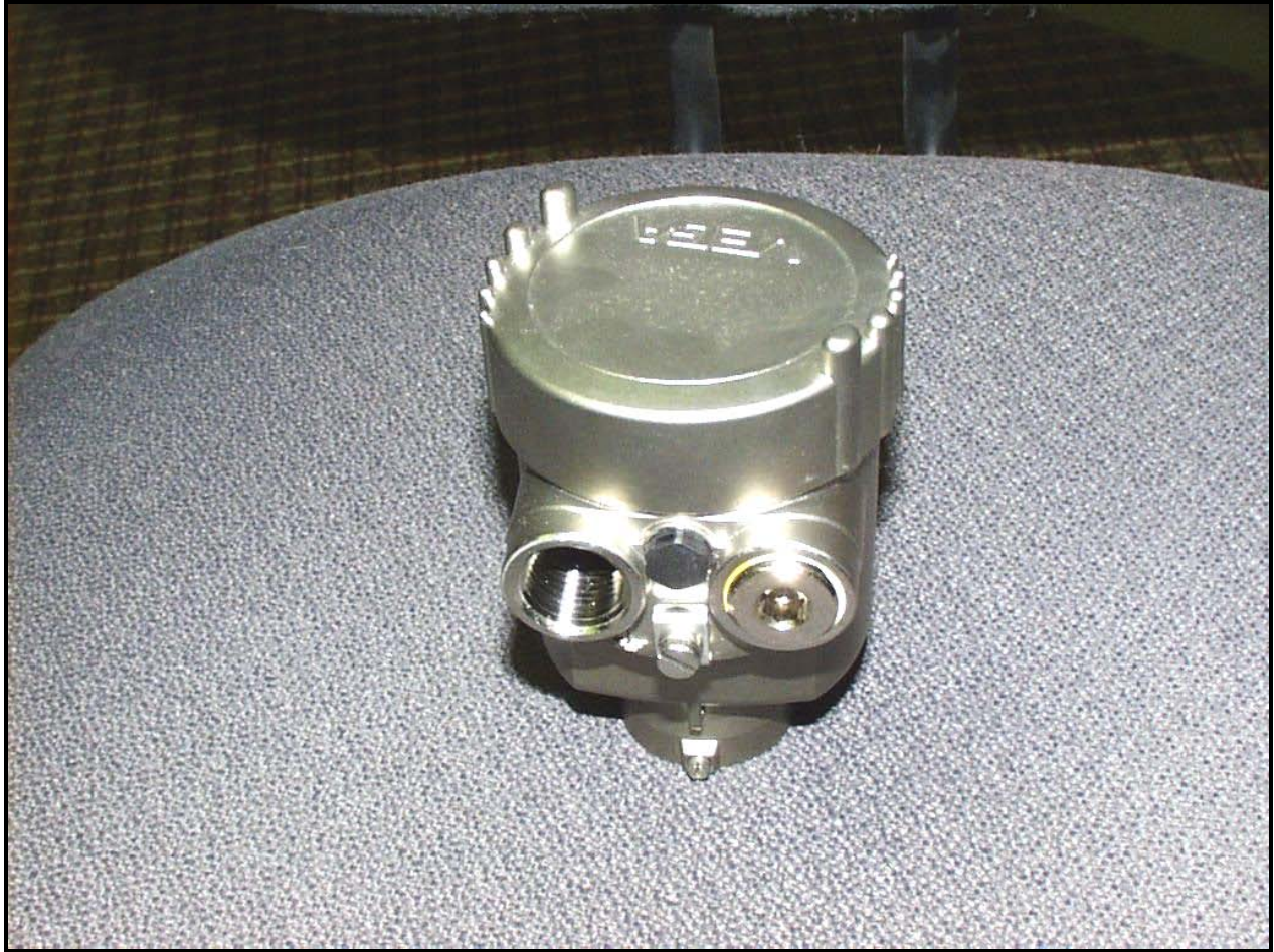
Photograph 15: Stainless Steel Housing Front View