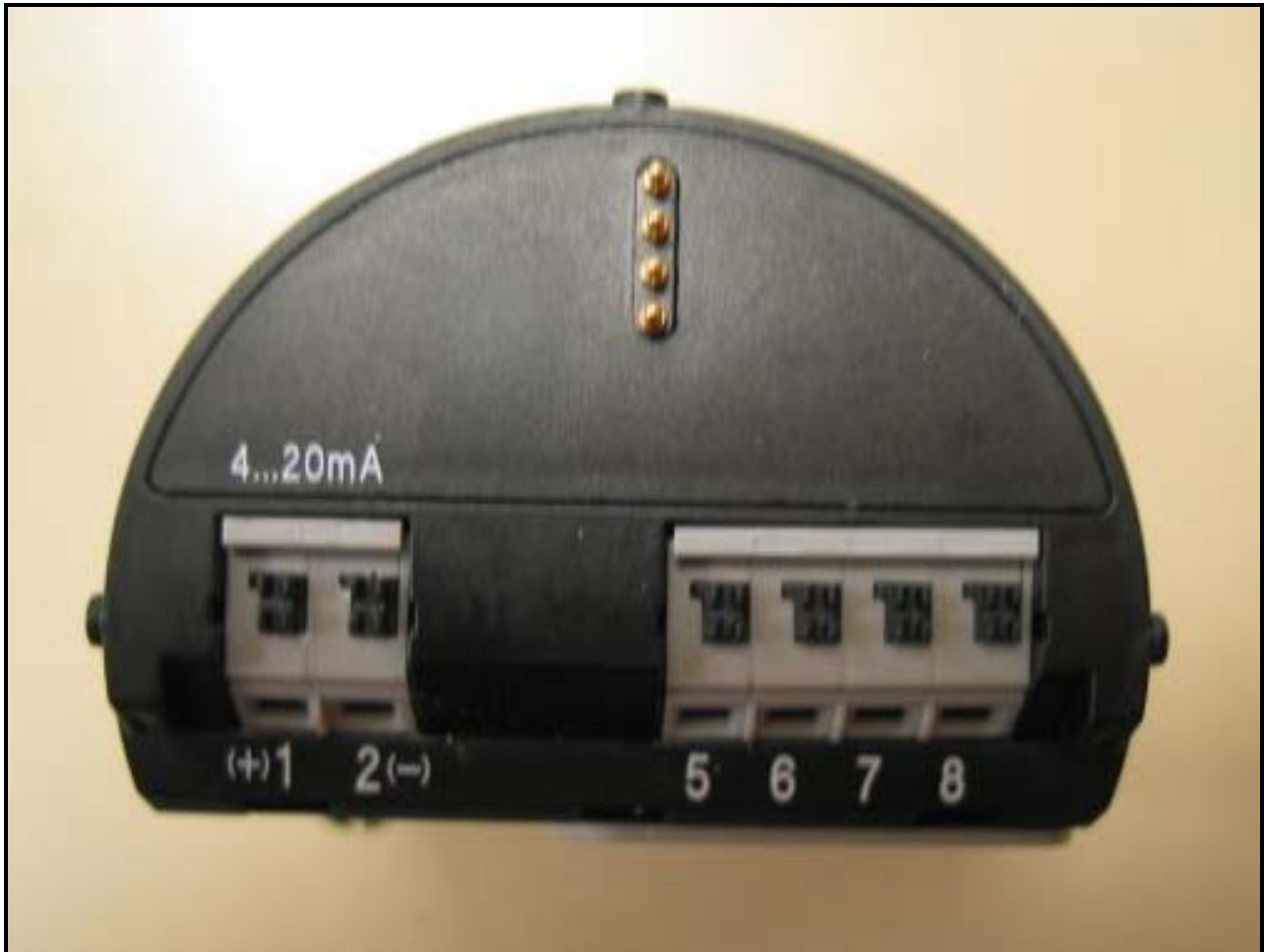
Photograph 20: Electronics Can (Top)