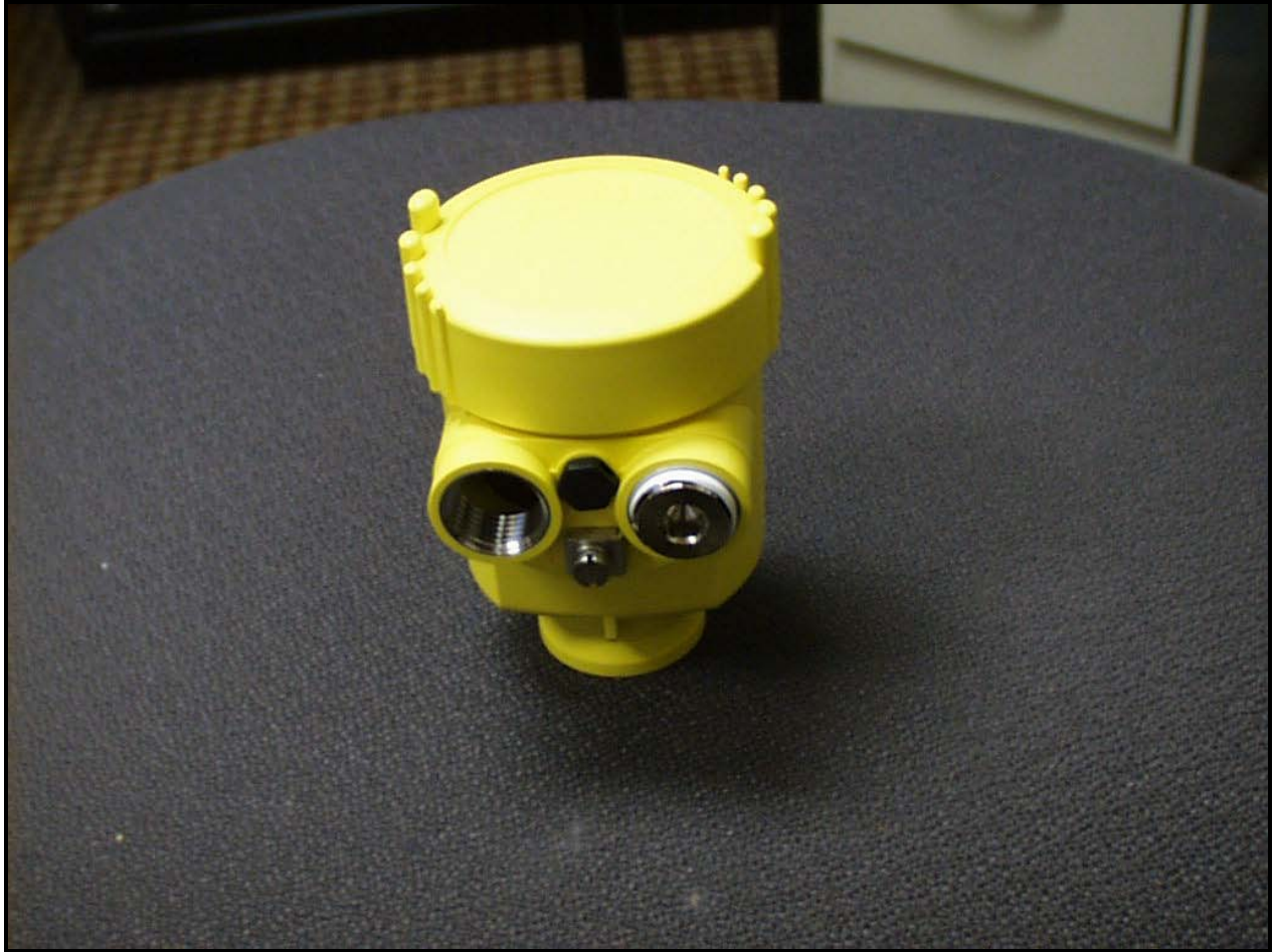
Photograph 6: Plastic Housing Front View