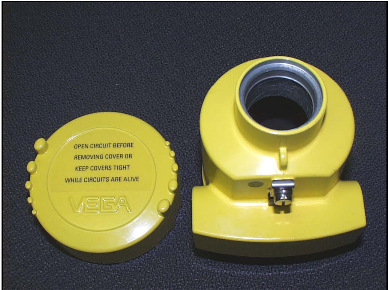
Photograph 9: Aluminum Housing