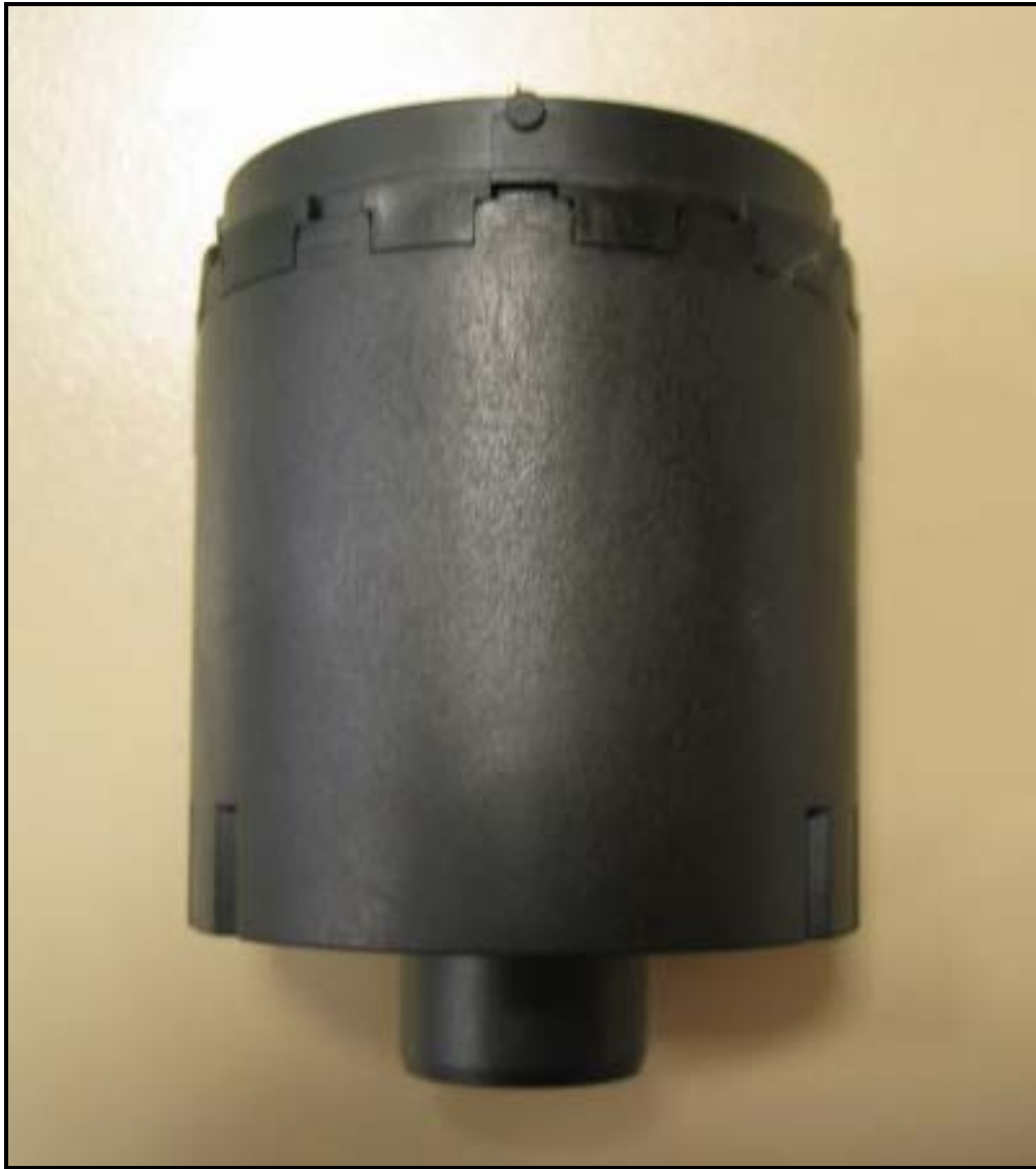
Photograph 22: Electronics Can (Rear)