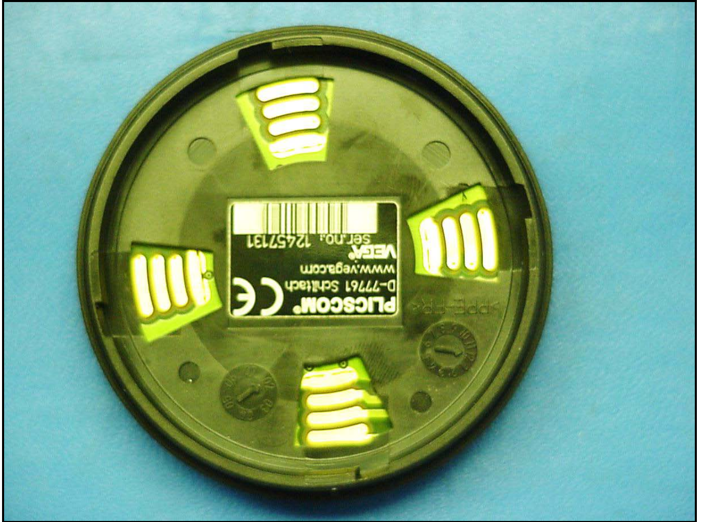
Photograph 18: LCD Display Bottom View