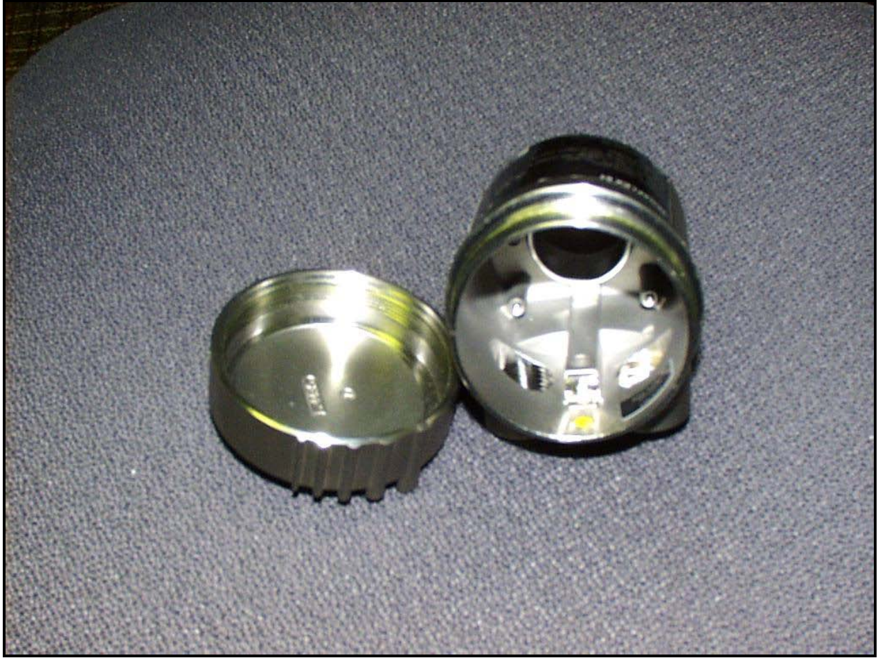
Photograph 16: Stainless Steel Housing Top View