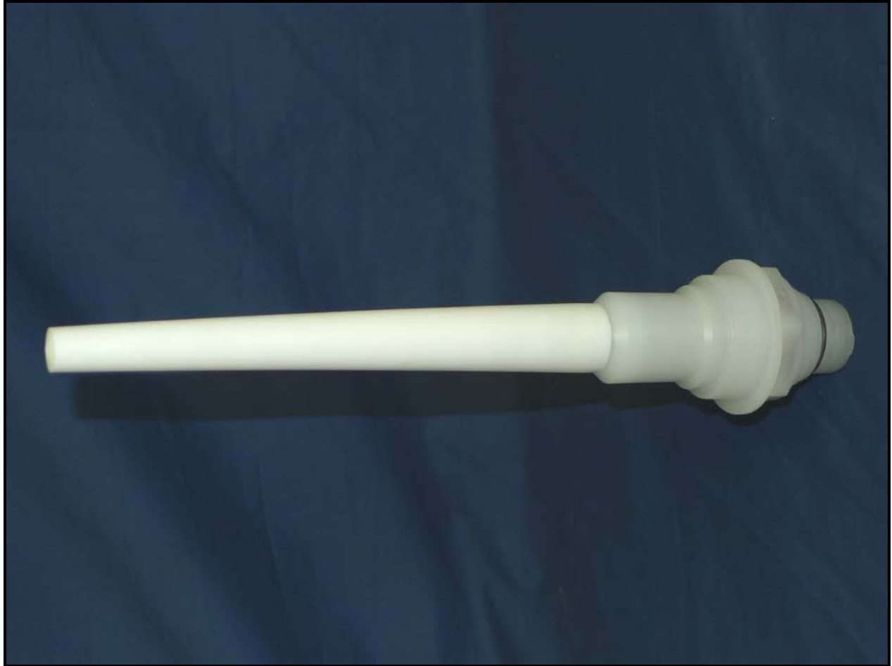
Photograph 4: 50mm Rod Antenna