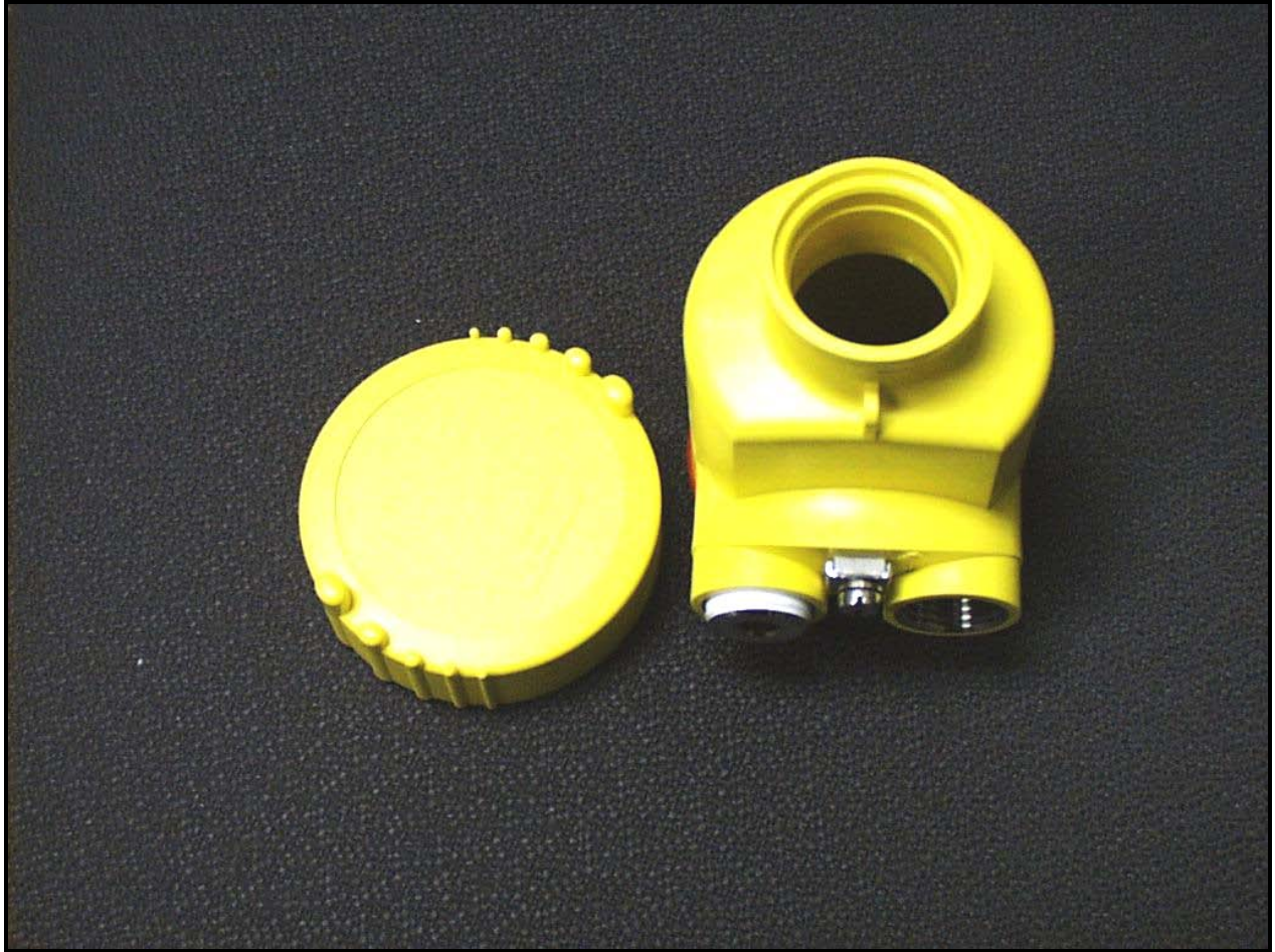
Photograph 8: Plastic Housing Fitting